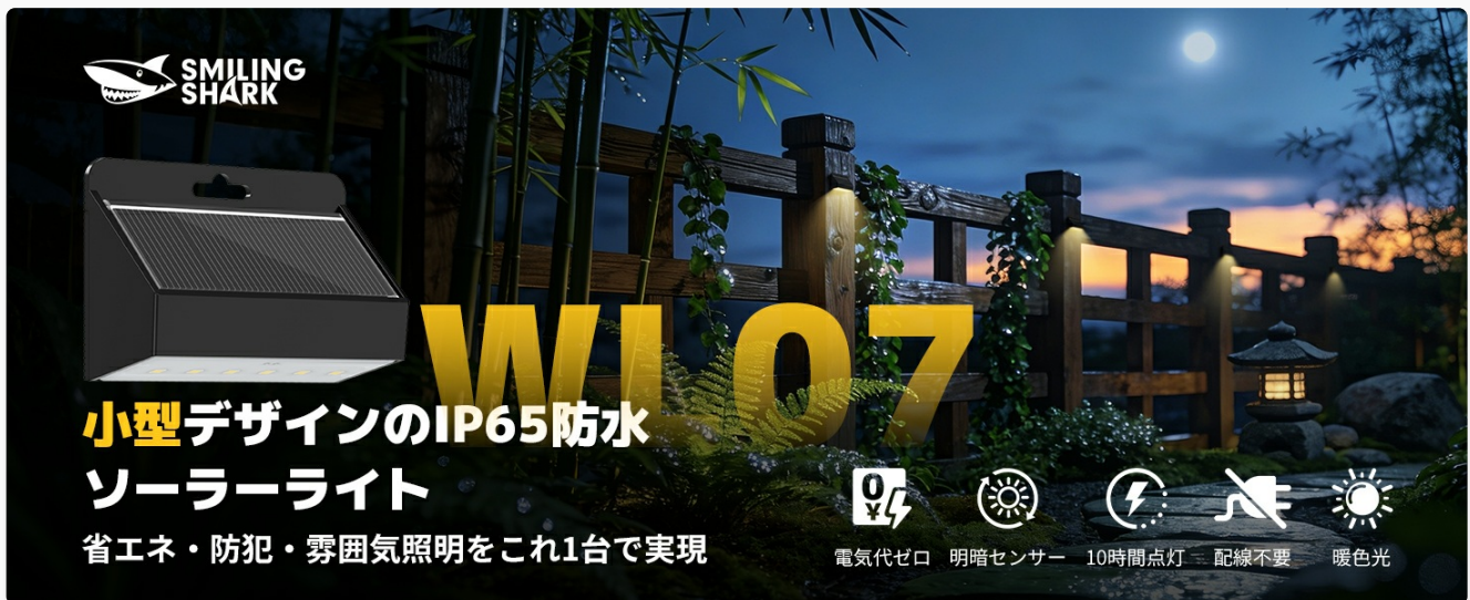
Image: Smiling Shark WL07 Solar Lights providing warm illumination for an outdoor deck and fence.

Thank you for choosing the Smiling Shark WL07 Solar Light. This product is designed to provide efficient, ambient lighting for your outdoor spaces using solar energy. Its compact design, automatic operation, and durable construction make it ideal for various applications. Please read this manual carefully before installation and use to ensure optimal performance and longevity of your solar lights.