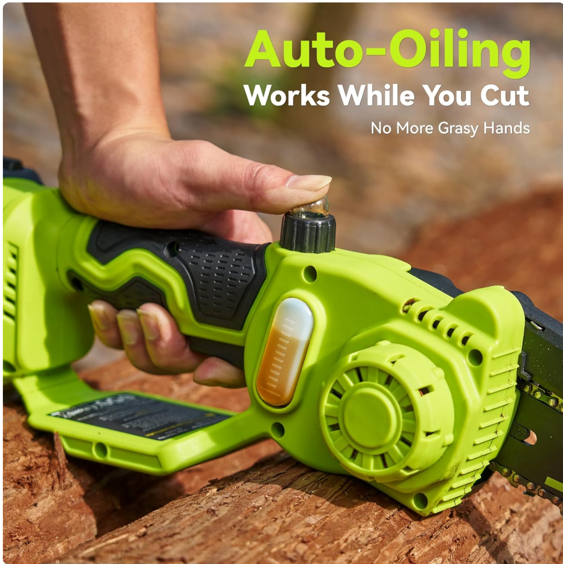
Figure 4.4: Filling the auto-oiling system with bar and chain oil.