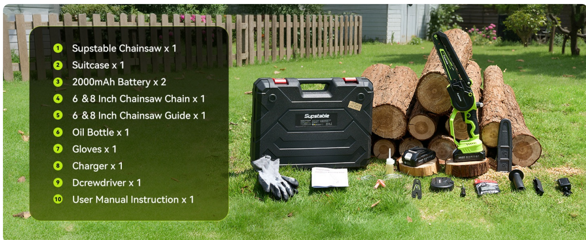
Figure 3.2: Visual representation of the Supstable Mini Chainsaw kit components.