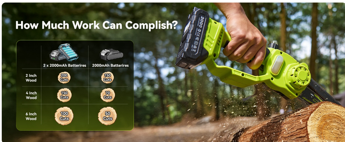
Figure 4.2: Battery performance details, indicating runtime and cutting capacity.