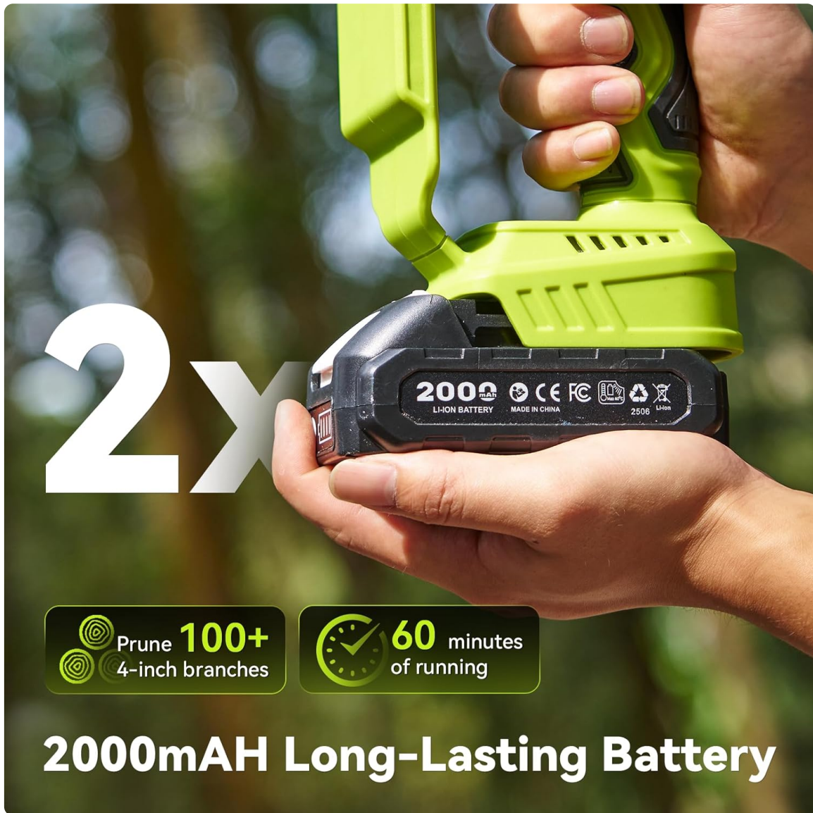
Figure 4.1: The two included 2000mAh rechargeable batteries.