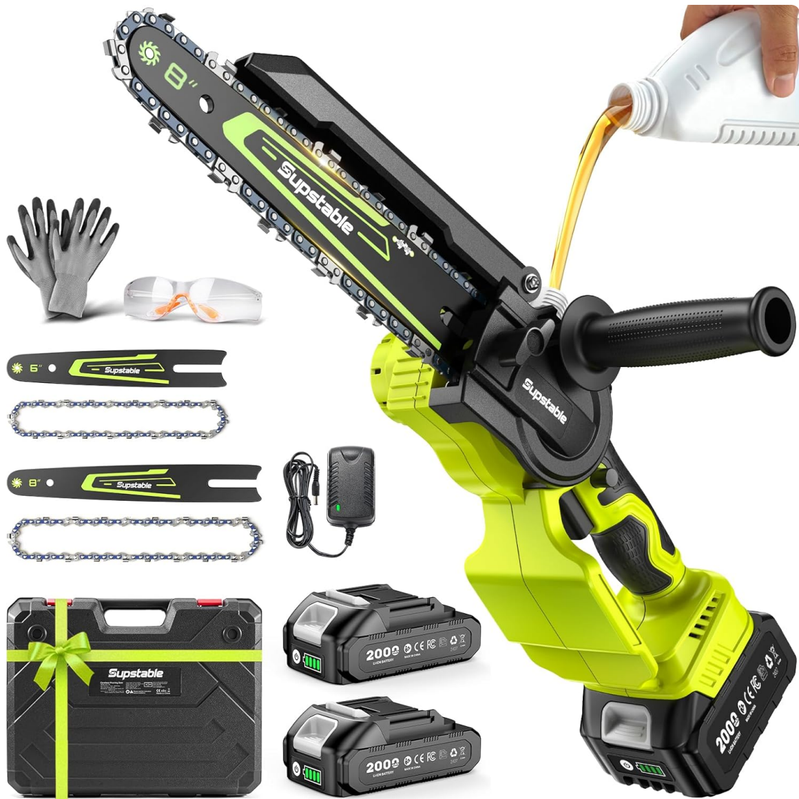
Figure 3.1: Complete package contents of the Supstable Mini Chainsaw.