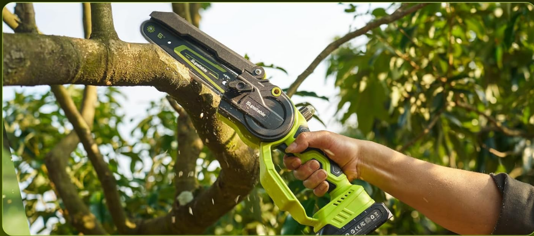
Figure 5.1: Examples of using the 8-inch and 6-inch guide bars for different cutting tasks.