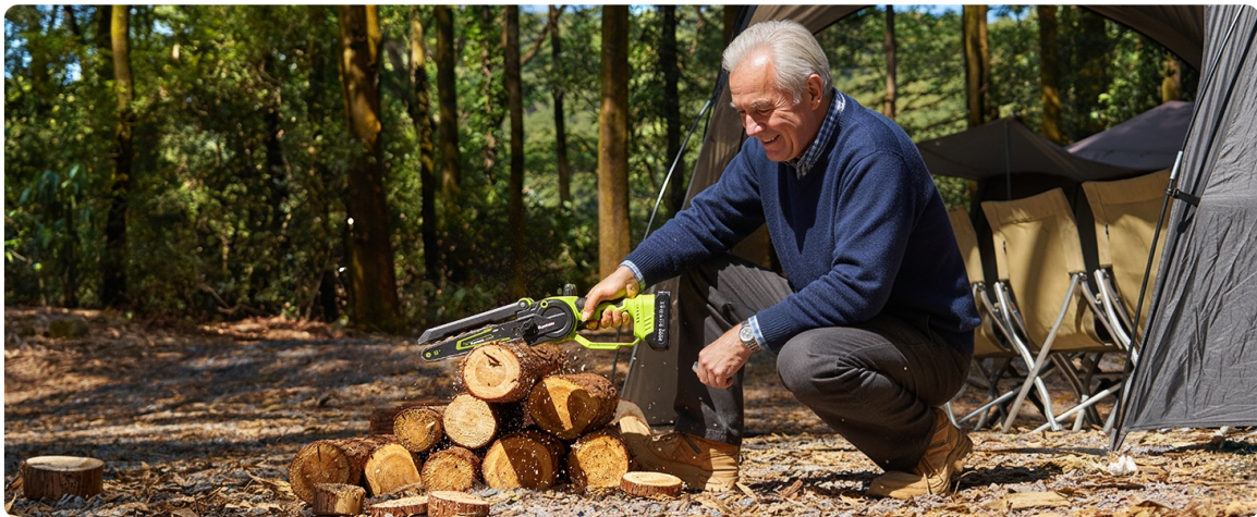
Figure 4.5: The auto-oiling system ensures continuous lubrication during operation.