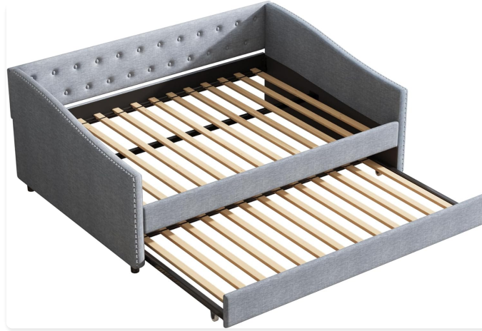
Image 4.1: The daybed frame with the twin trundle fully extended, illustrating the slat support system.