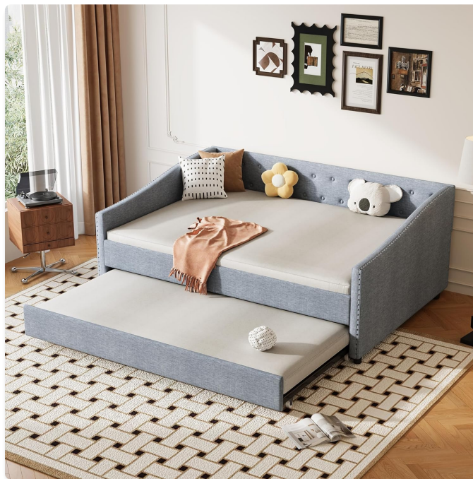
Image 1.1: Fully assembled SOFTSEA Full Size Daybed with Twin Trundle, shown with the trundle extended, in a room setting.

Thank you for choosing the SOFTSEA Full Size Daybed with Twin Trundle. This manual provides essential information for the safe assembly, operation, and maintenance of your new furniture. Please read all instructions carefully before beginning assembly and retain this manual for future reference.