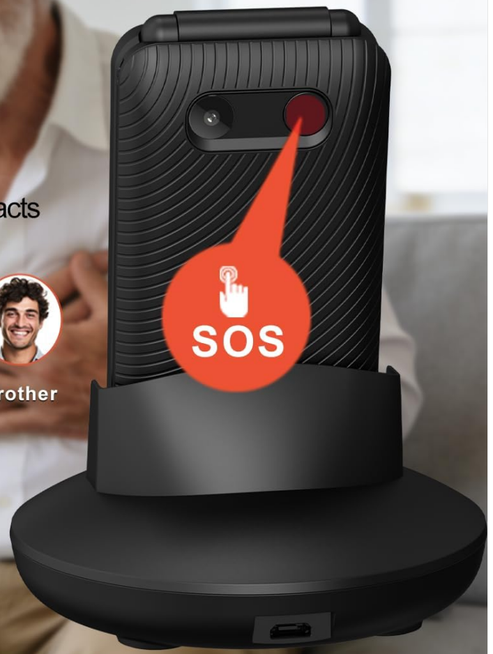
Image: The SilisoundTek C8 Flip Phone displaying the SOS button on its rear, along with an illustration of setting up emergency contacts.