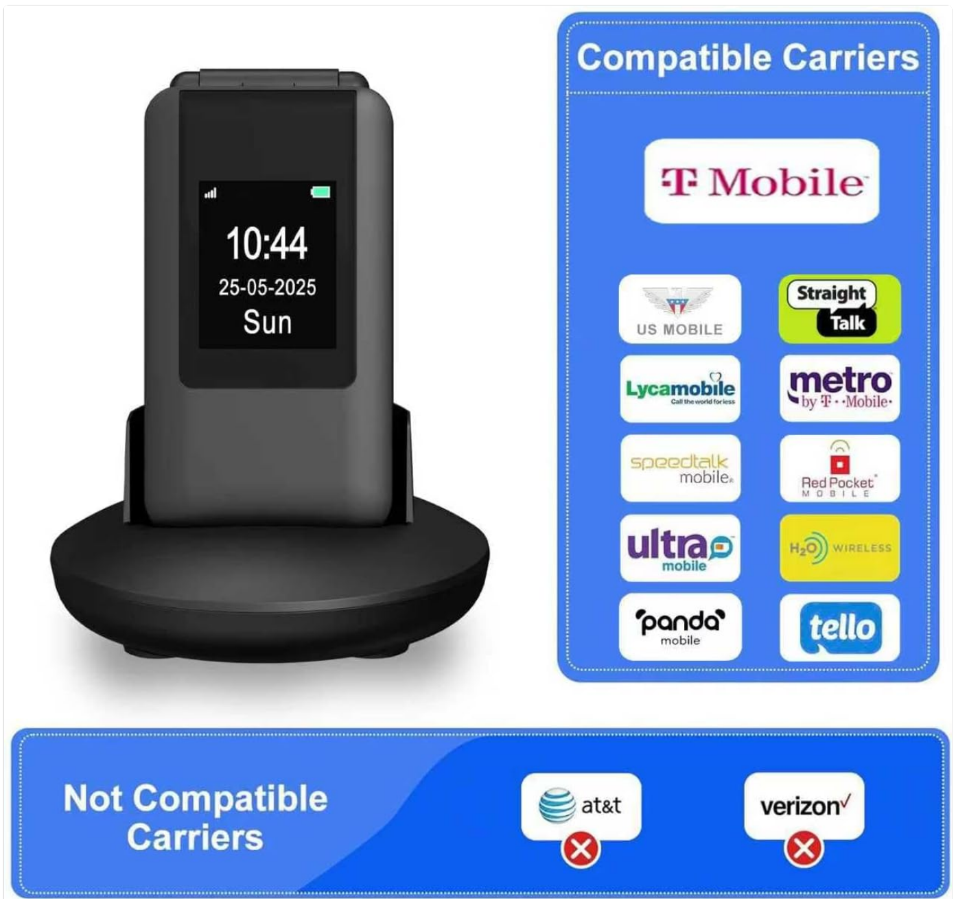
Image: A visual guide to compatible carriers (T-Mobile, MetroPCS, etc.) and non-compatible carriers (AT&T, Verizon) for the SilisoundTek C8 Flip Phone.