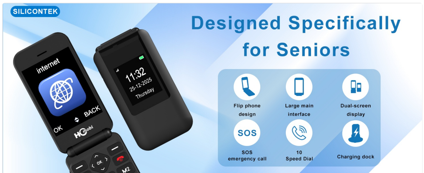
Image: Overview of the SilisoundTek C8 Flip Phone highlighting features like dual-screen, large buttons, and SOS function.

The SilisoundTek C8 Flip Phone is designed with ease of use in mind, particularly for seniors. It features a dual-screen display, large buttons, a spacious screen with large font, and amplified volume for clear communication. Key functionalities include an SOS emergency button, speed dial, and compatibility with 4G LTE networks.