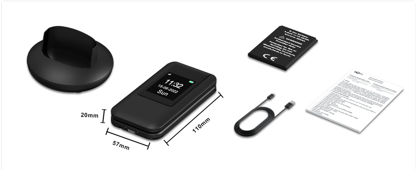
Image: Contents of the SilisoundTek C8 package, showing the phone, charging dock, USB cable, and battery.