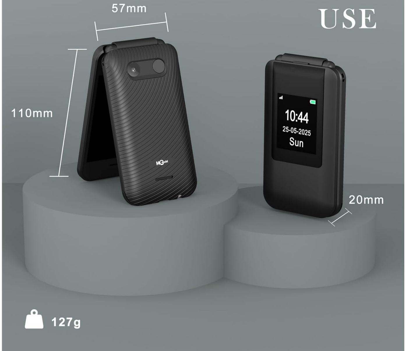
Image: Dimensions and weight of the SilisoundTek C8 Flip Phone.