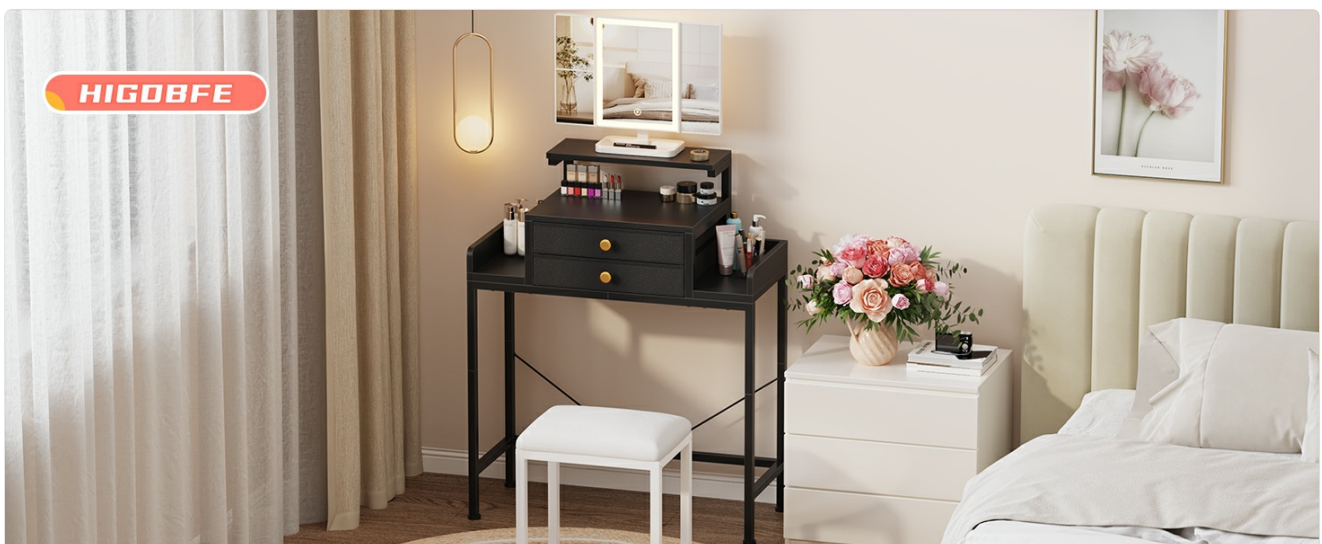
Overview of the HIGDBFE 28.4"W Vanity Desk with Mirror and Lights.

Thank you for choosing the HIGDBFE 28.4"W Vanity Desk with Mirror and Lights. This compact and functional makeup table is designed to provide a dedicated space for your beauty routine, featuring a tri-fold LED mirror, adjustable height, and convenient storage. This manual provides detailed instructions for assembly, operation, maintenance, and troubleshooting to ensure optimal use and longevity of your vanity desk.