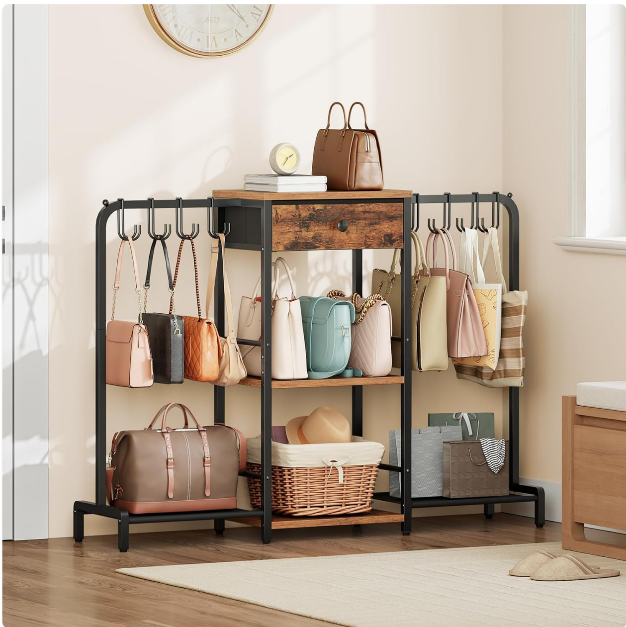
Image 1.1: The HOOBRO 3-Tier Purse Organizer, Model BF97CJ01, showcasing its storage capabilities for handbags and accessories.