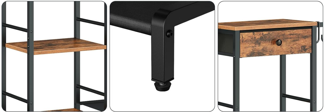
Image 4.2: Detailed views of key components: movable hooks, adjustable feet for stability, and the convenient fabric drawer.