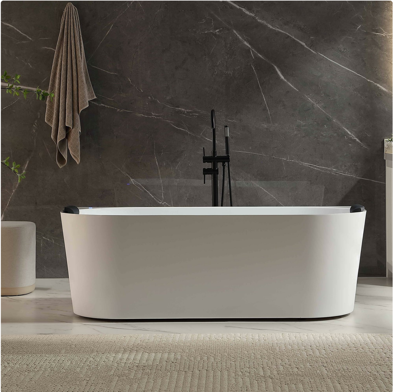
Image: Empava 71-inch Freestanding Whirlpool Bathtub with water and blue chromotherapy light.