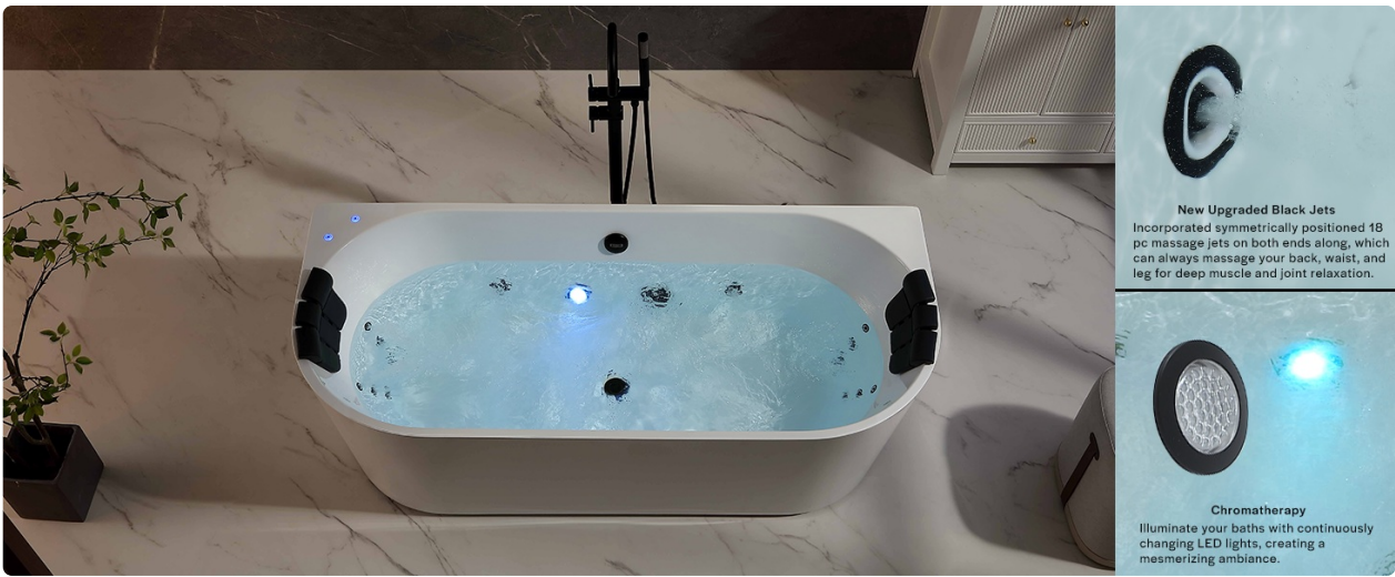
Image: Close-up of whirlpool jets and chromotherapy light in the Empava bathtub.