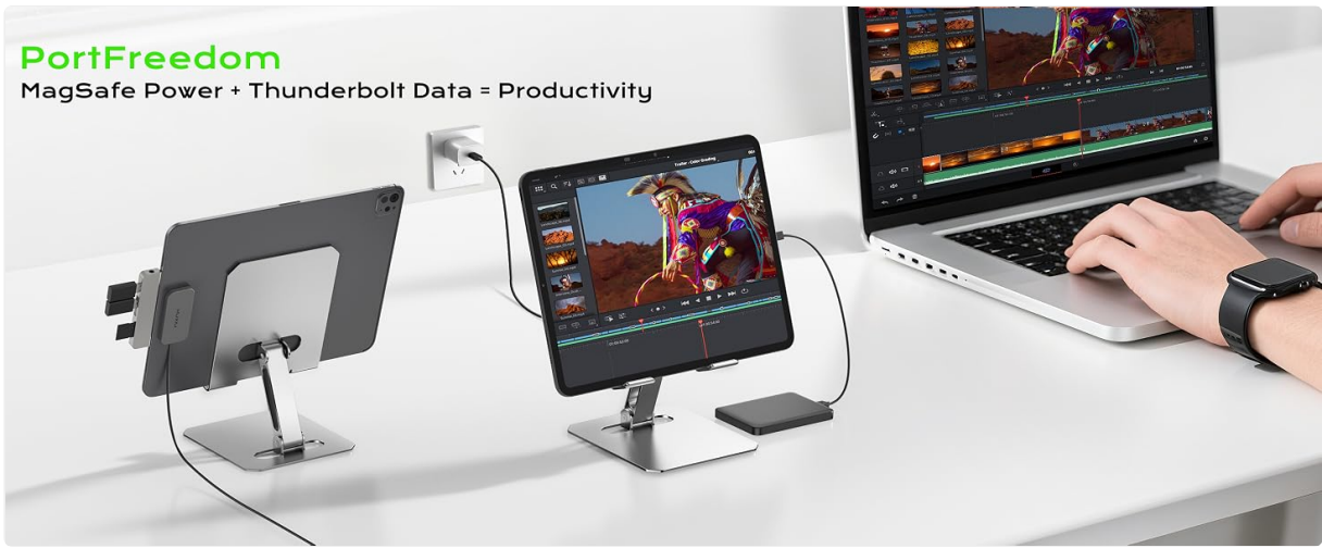
Image: The charger allows the iPad's Thunderbolt port to remain free for connecting accessories like a hub, enhancing productivity.

MagSafe Power + Thunderbolt Data = Productivity