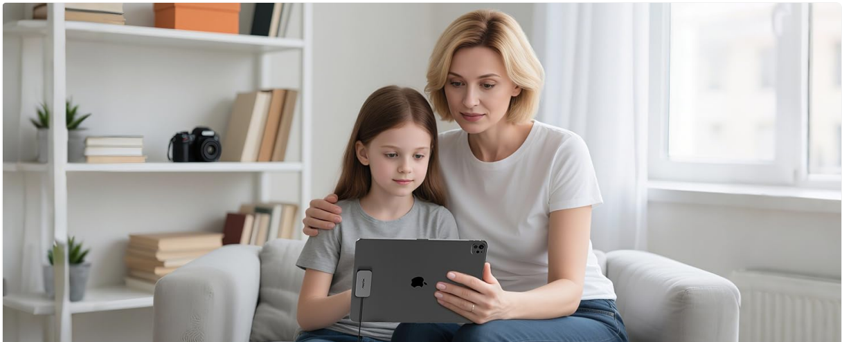
Image: The charger's ultra-thin and light design allows for easy portability, fitting into small bags or pockets.