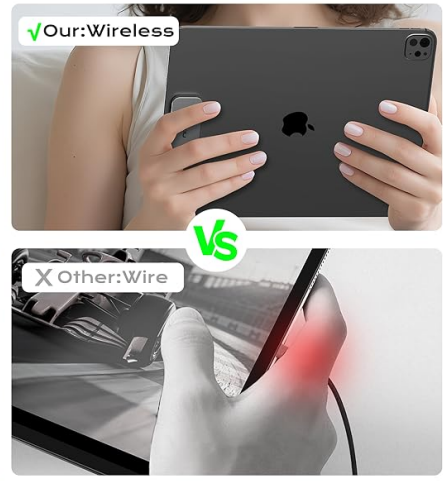
Image: The slim profile of the charger ensures comfortable use during activities like gaming, without blocking hands.

Video: Highlights the innovative magnetic wireless charging method for iPad, emphasizing convenience and protection of the Thunderbolt port.