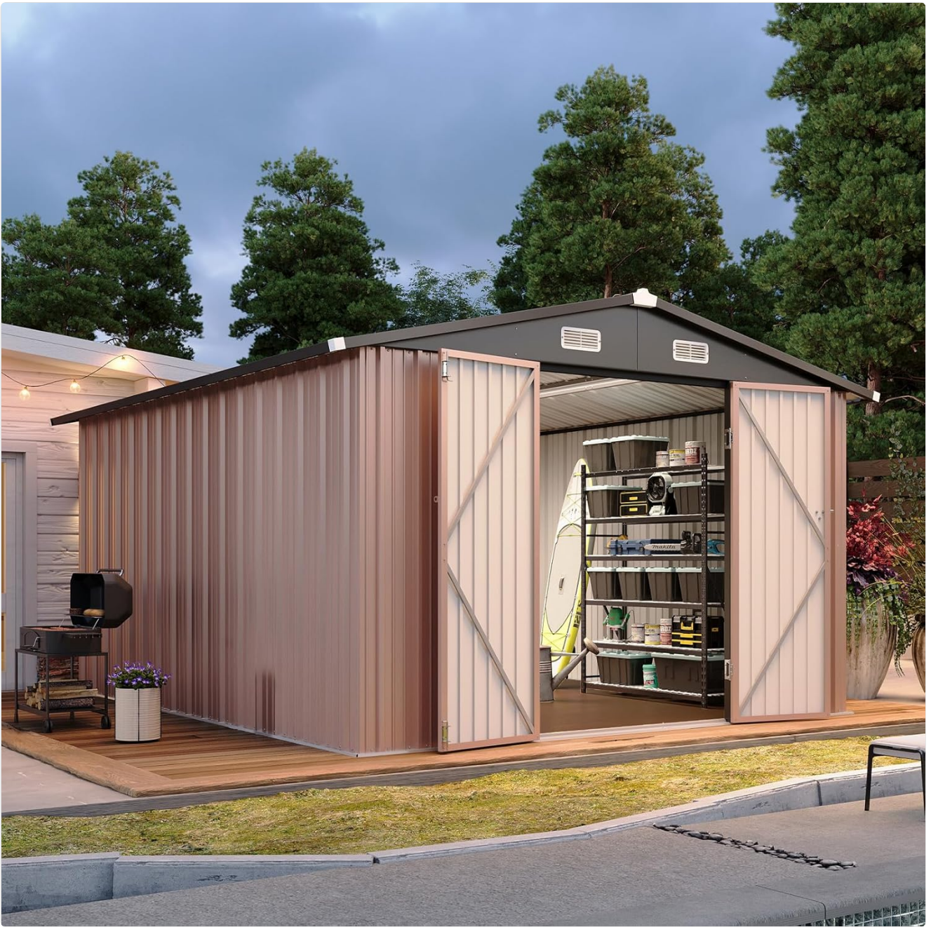
Figure 1: The Aoxun 10x12 Outdoor Storage Shed, showcasing its spacious interior and robust design.