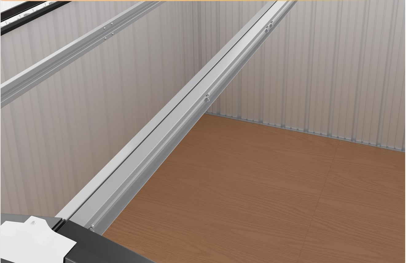
Figure 5: Key features enhancing the shed's durability and user experience.