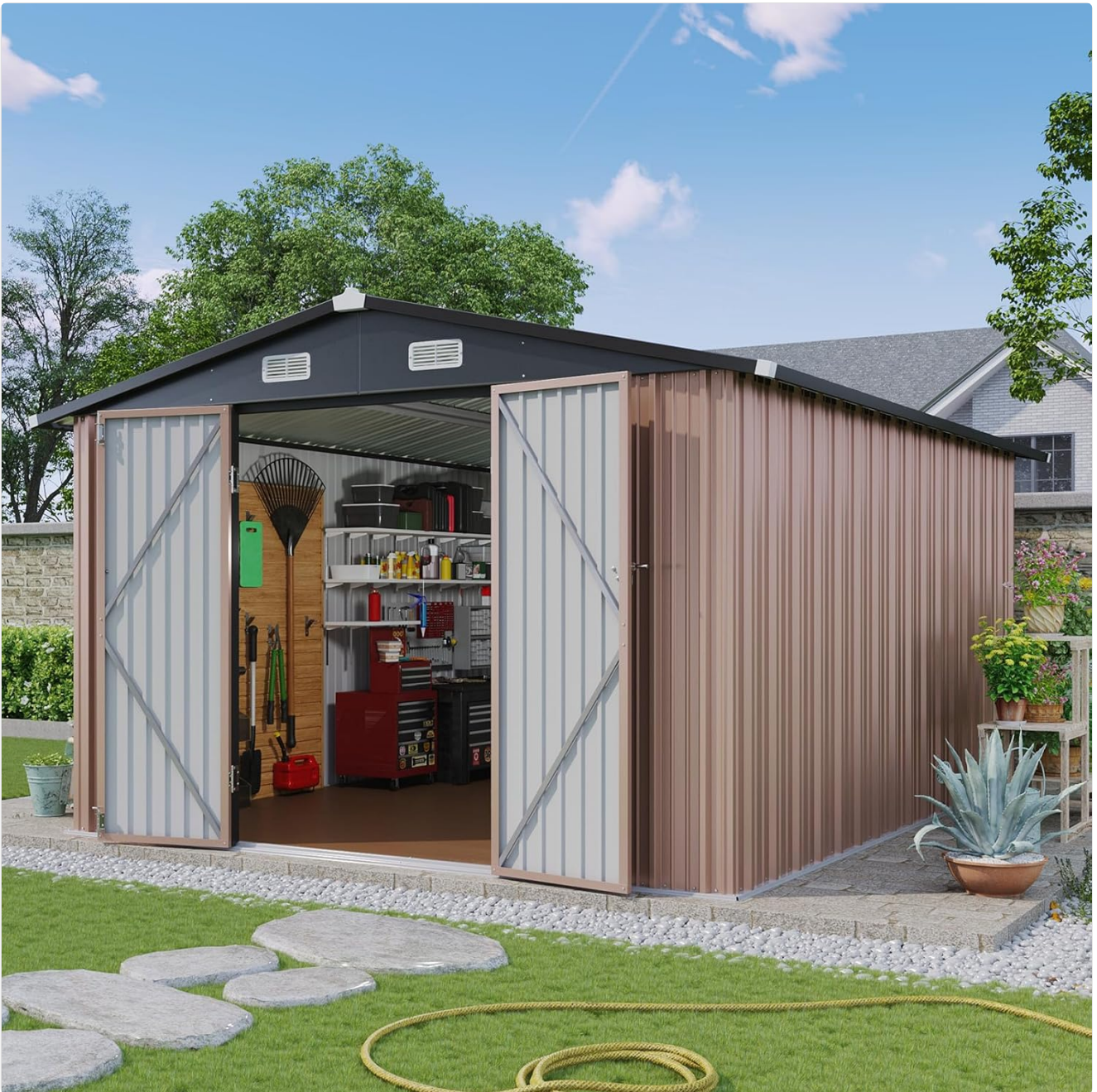
Figure 3: Example of interior organization and storage capacity.