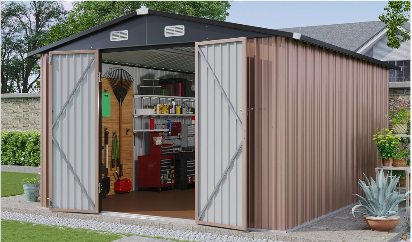
Figure 7: The premium thick floor prevents direct ground contact and supports significant weight.