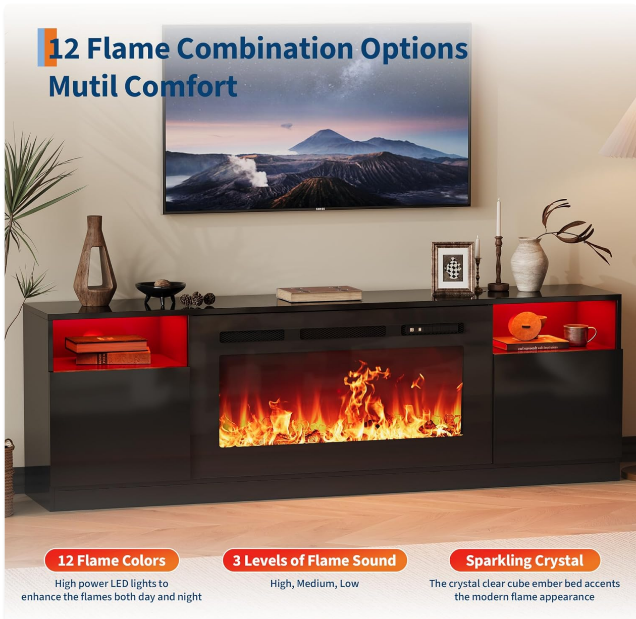
Figure 4: Fireplace Flame and Crystal Features.