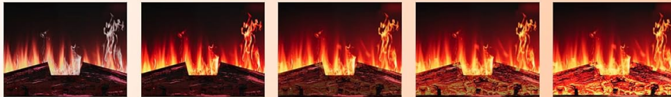
Figure 5: Vivid Flames with Multiple Color Options.