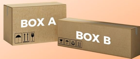
Figure 3: Packaging and overall dimensions of the TV stand.

Reinforced packaging ensures safe delivery (may arrive separately)