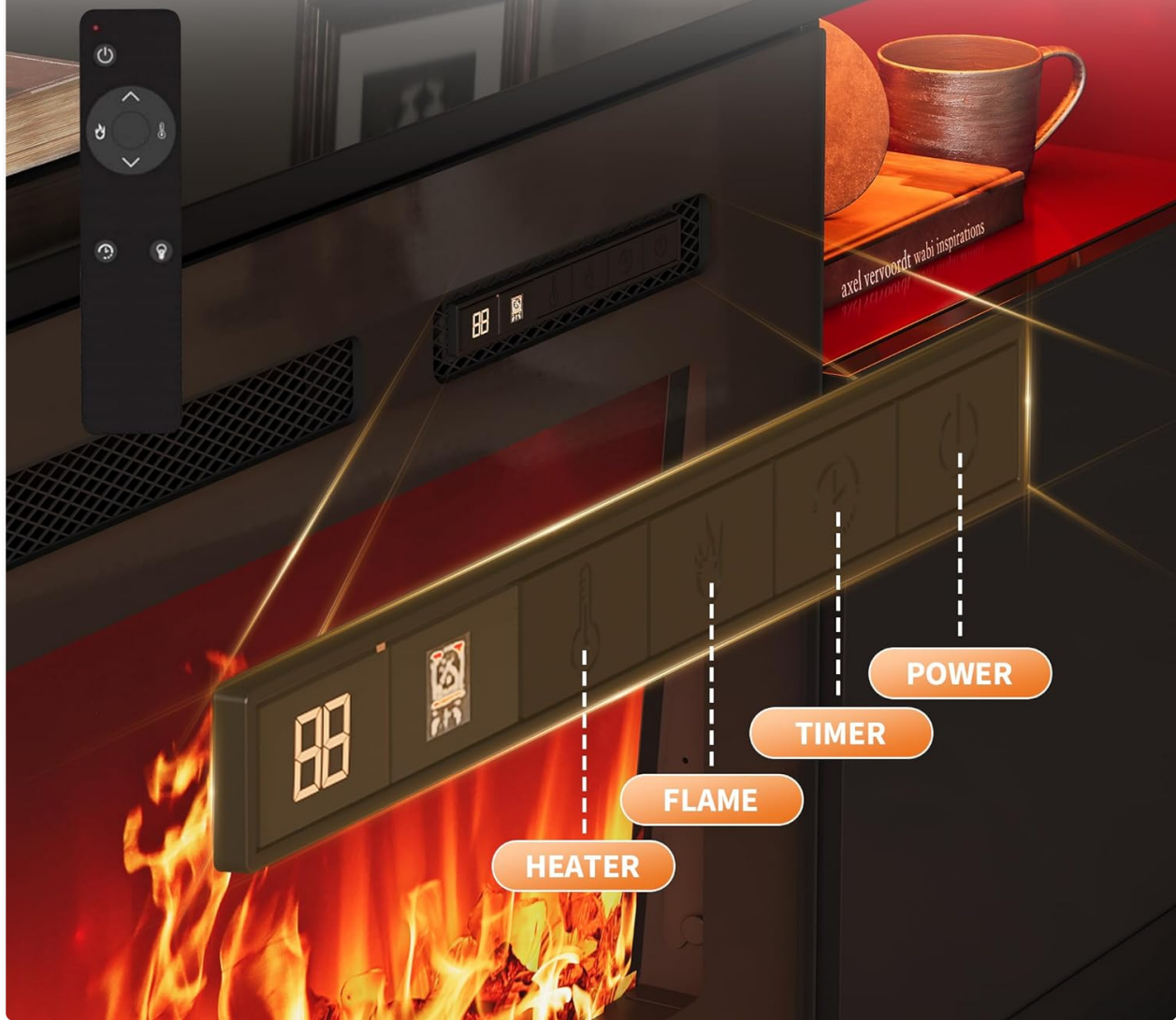
Figure 7: Fireplace Control Panel and Remote.