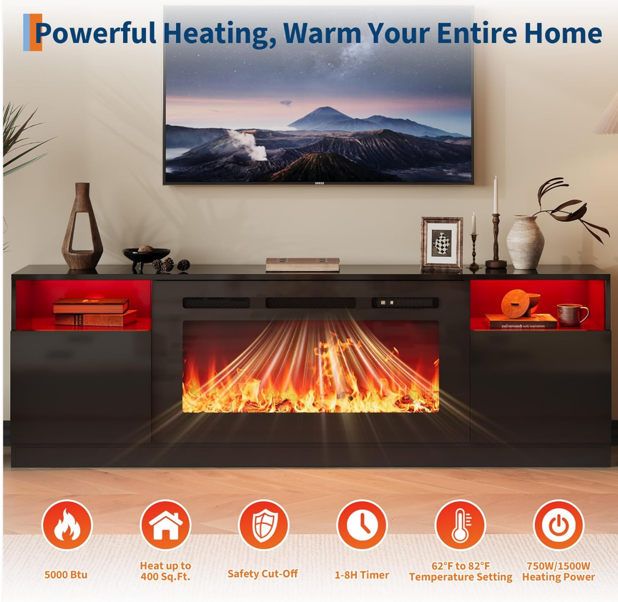
Figure 6: Powerful Heating Features.