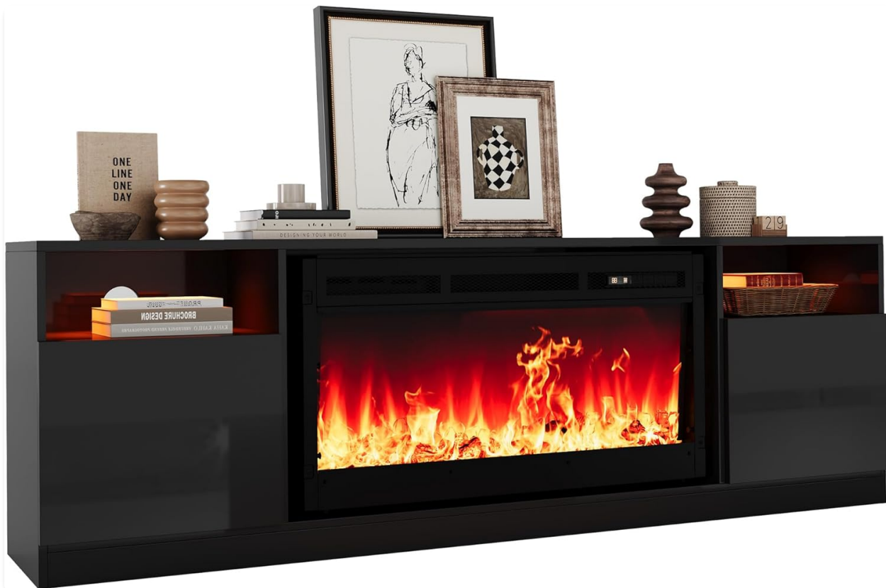
Figure 1: Fully assembled Garvee 70-inch Fireplace TV Stand.

Thank you for purchasing the Garvee 70-inch Fireplace TV Stand. This modern entertainment center is designed to accommodate TVs up to 80 inches and features a built-in 36-inch electric fireplace with LED lights. This manual provides essential information for safe assembly, operation, maintenance, and troubleshooting to ensure optimal performance and longevity of your product.