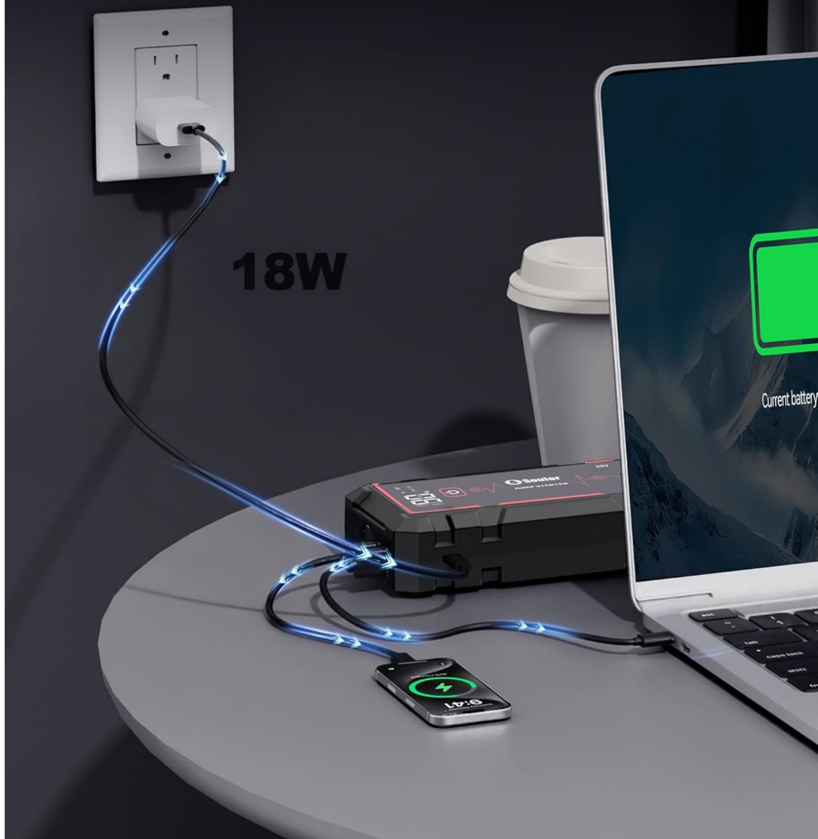
Image: The Soulor CY20 Jump Starter acting as a portable power bank, charging a smartphone and a laptop simultaneously via its USB ports.