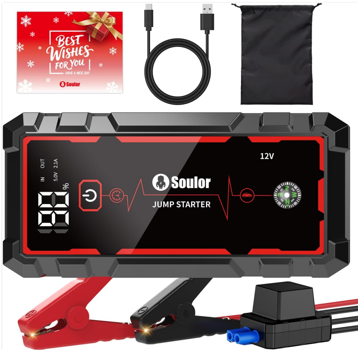
Image: The Soulor CY20 Jump Starter package contents, including the main unit, smart jumper cables, USB-C cable, user manual, and storage bag.