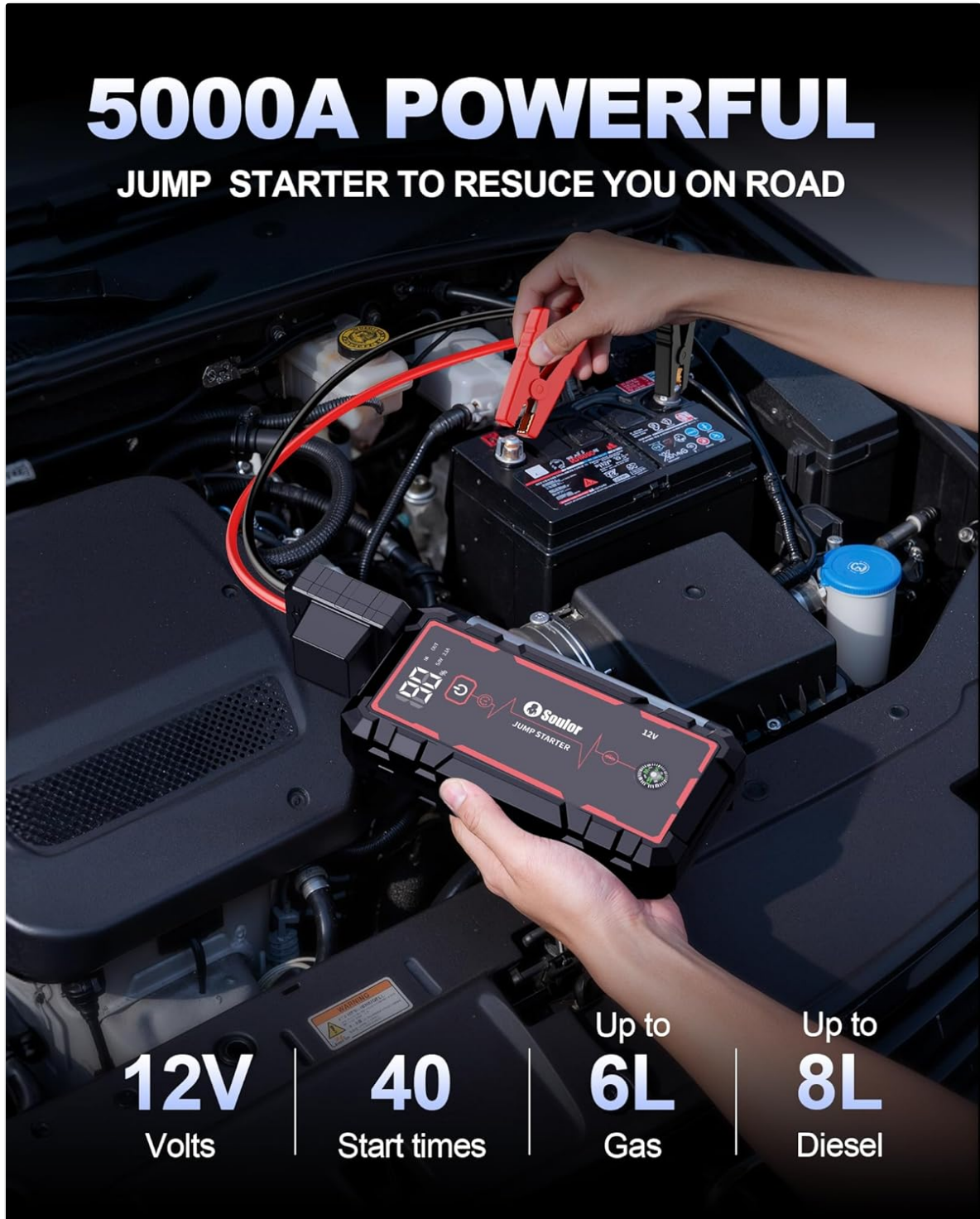
Image: The Soulor CY20 Jump Starter connected to a car battery, demonstrating its powerful jump-starting capability for various vehicle types.