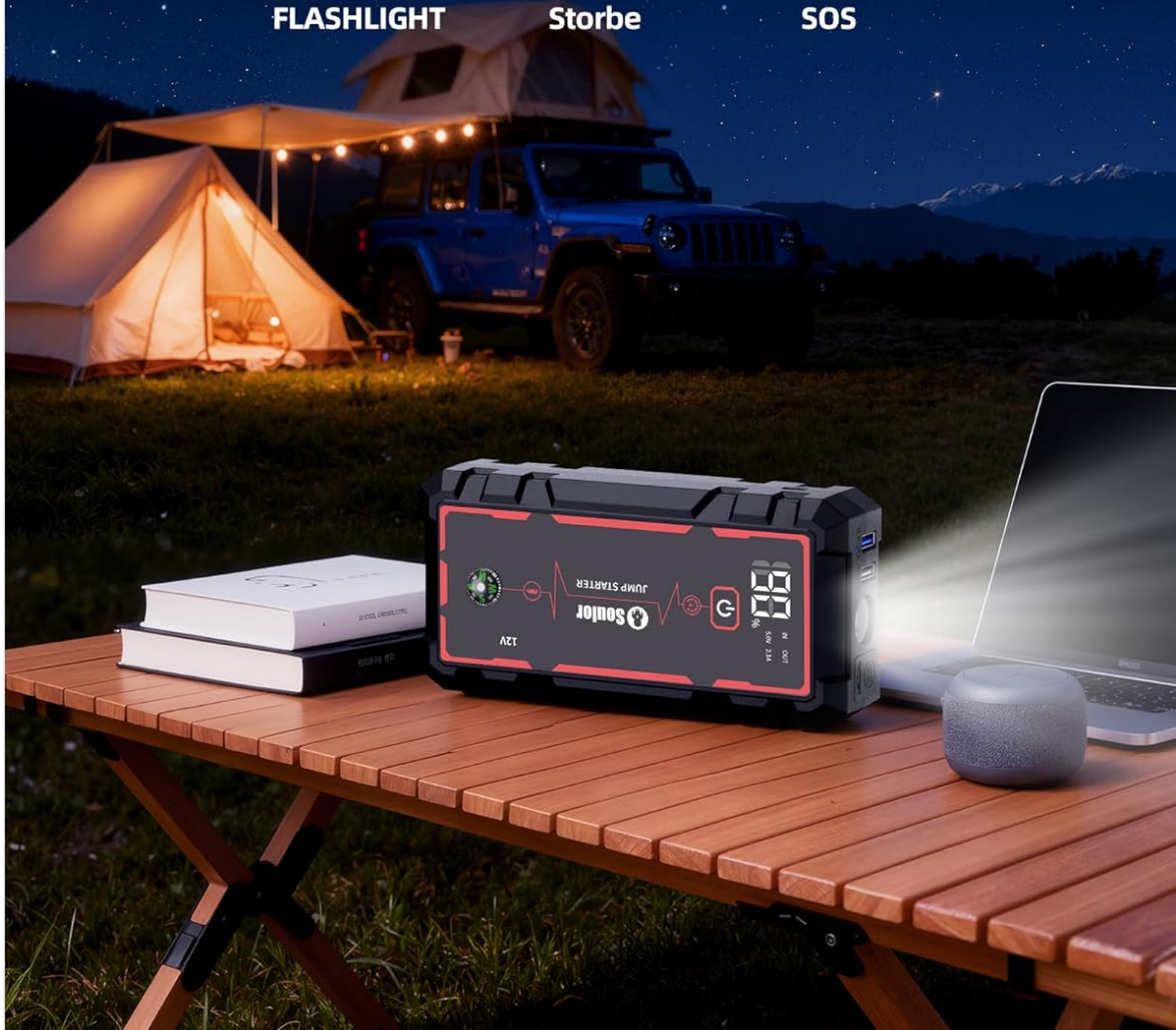
Image: The Soulor CY20 Jump Starter's 600-lumen LED flashlight illuminating a campsite at night, showcasing its emergency lighting capability.