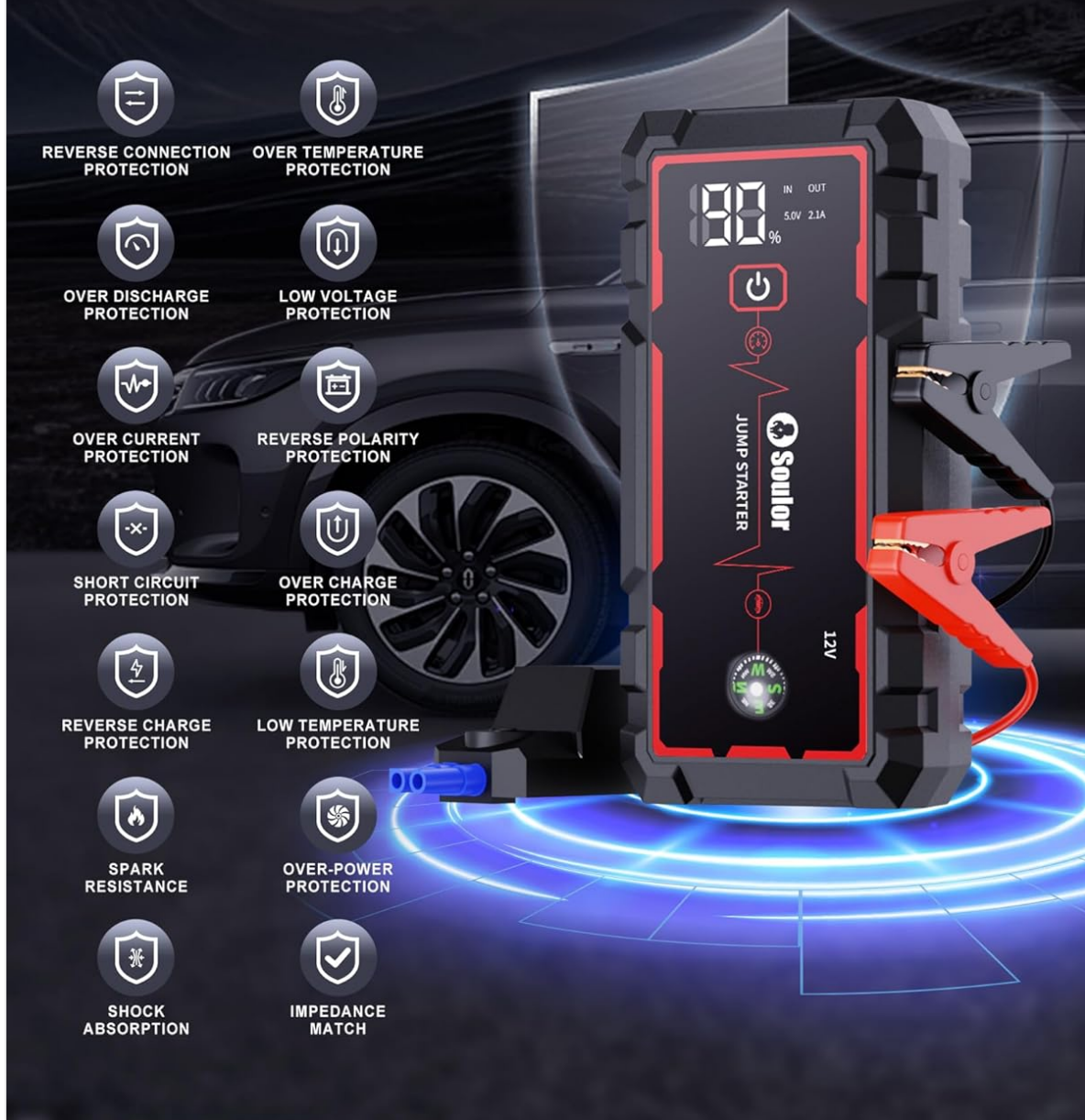
Image: A visual representation of the 14 intelligent safety protections integrated into the Soulor CY20 Jump Starter, ensuring safe operation.