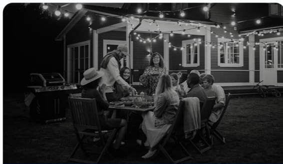
Ordinary Night Vision

Image: Illustration of the camcorder's dual video recording feature, capturing both a front-facing 5K view and a rear-facing 1080P view simultaneously.