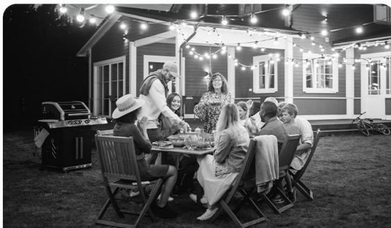
IR Night Vision