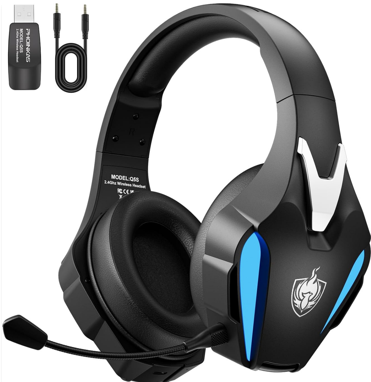
Image 1.1: PHOINIKAS Q5S Wireless Gaming Headset, showing the headset, USB dongle, and 3.5mm audio cable.