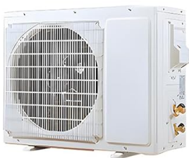
24.8"x9.37"x19.88" Outdoor Unit