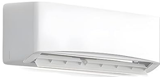
28.35"x7.48"x11.42" Indoor unit