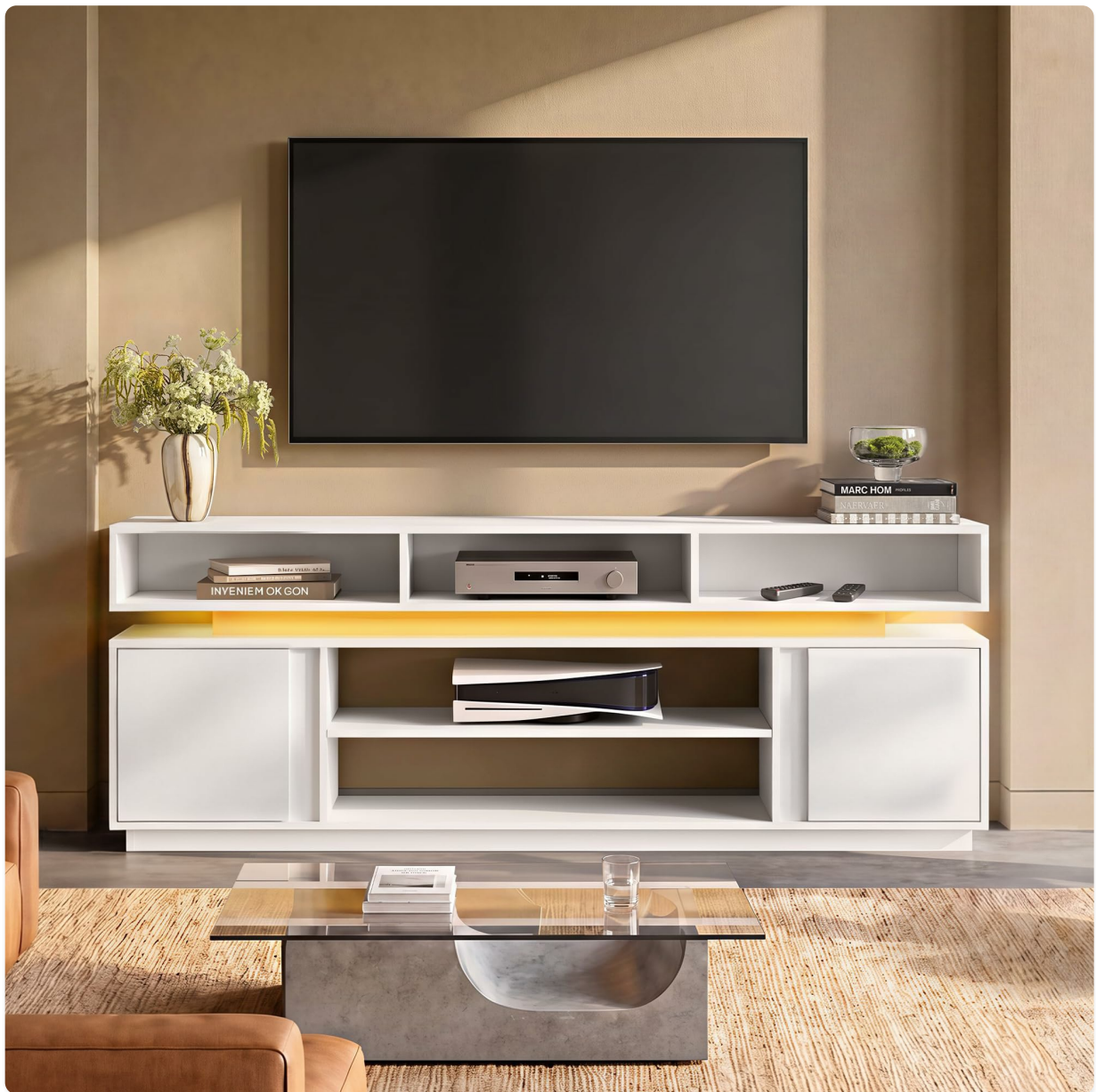
Image 1.1: The WLIVE Modern TV Stand (Model AD SG084BL) in a typical setup.