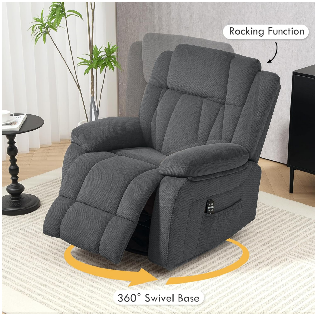
Image 5.3.1: A diagram highlighting the 360-degree swivel base and the rocking functionality of the recliner chair.