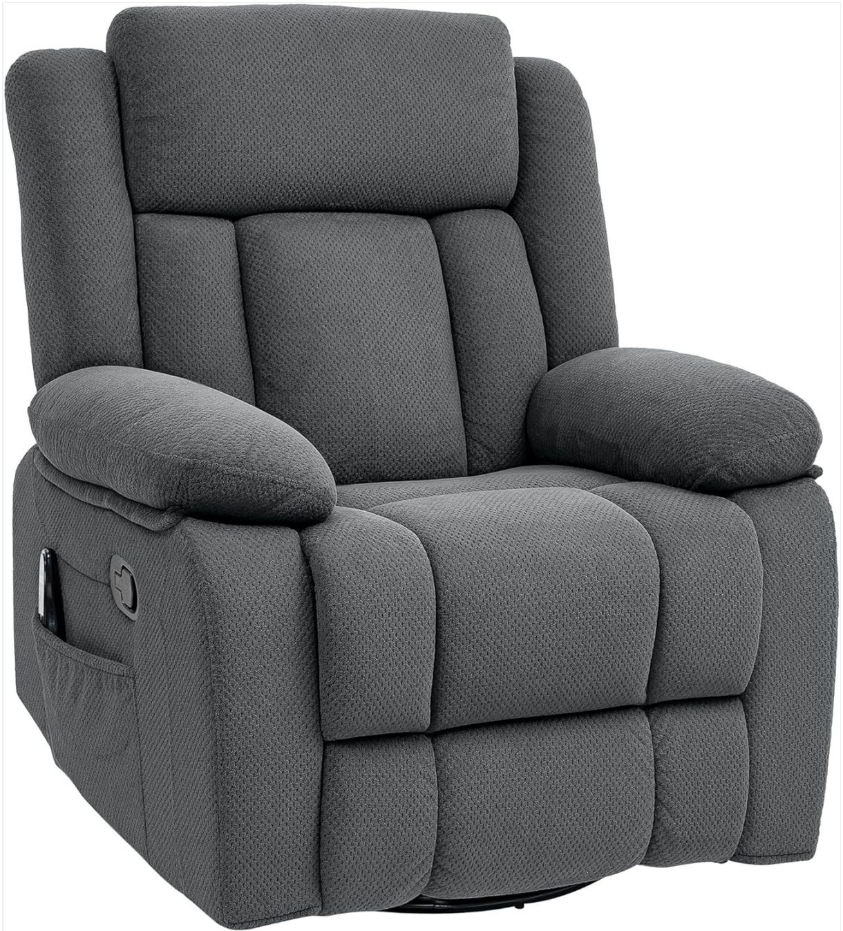
Image 1.1: The HOMCOM 700-176V80GY Recliner Chair in its upright position, showcasing its grey velvet-feel fabric and plush design.