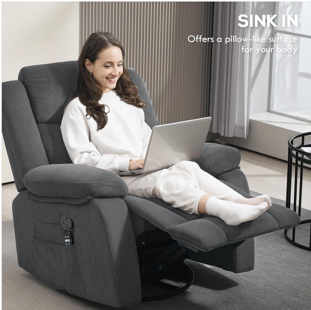
Image 5.1.3: A person using a laptop while seated in the recliner, demonstrating the chair's versatility for various activities.