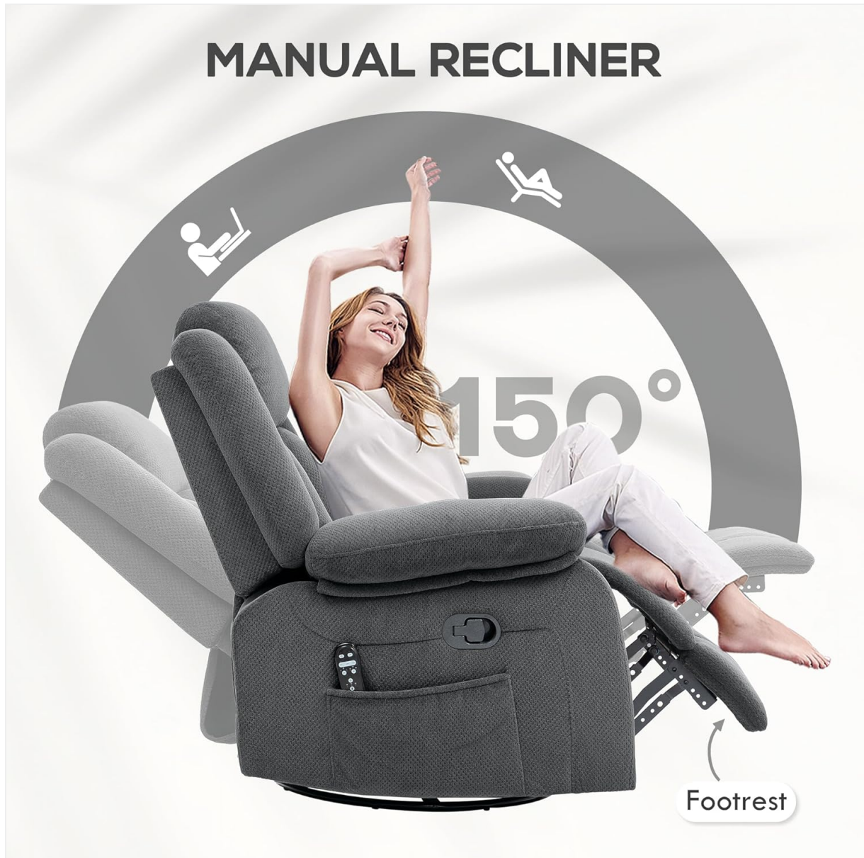
Image 5.1.1: A visual guide demonstrating the manual reclining process, showing how to activate the recline and footrest with the side tab.

To recline the chair and raise the footrest, locate the side tab on the right side of the chair (when seated). Pull the tab to release the locking mechanism, then lean back gently. The chair will recline up to 150 degrees, and the footrest will extend simultaneously. To return to the upright position, push down on the footrest with your legs and lean forward until the chair locks into place.