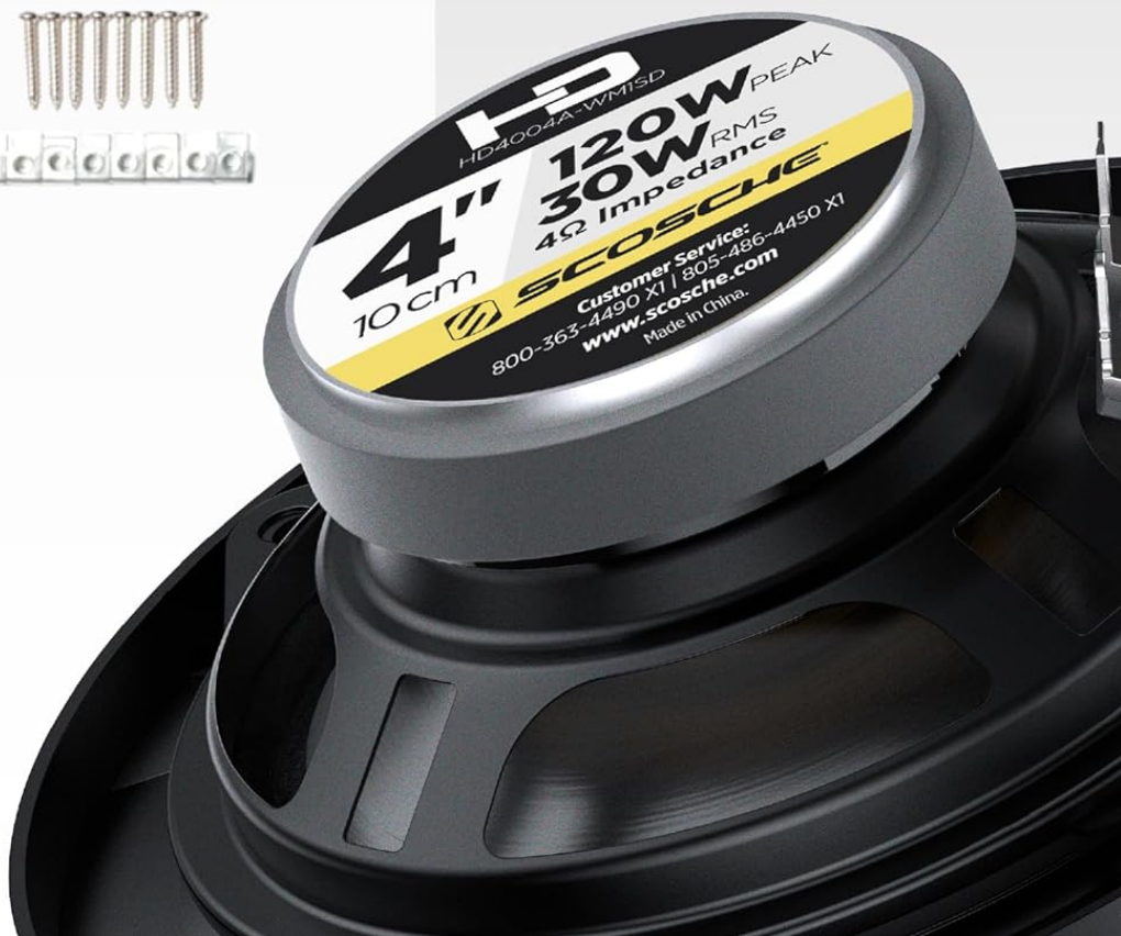
Image: Contents of the Scosche HD4004A-WM1SD speaker box, including two speakers, two speaker grilles, and a set of mounting hardware.