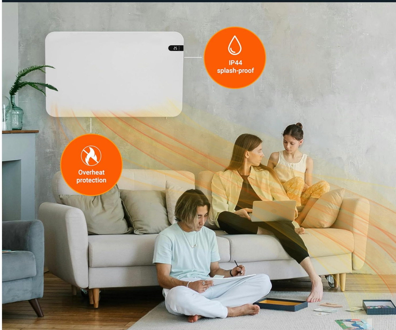
Image: Safety features of the Königshaus Smart Dual Space Heater, including overheat protection and IP44 splash-proof design, ensuring safe operation in various environments.