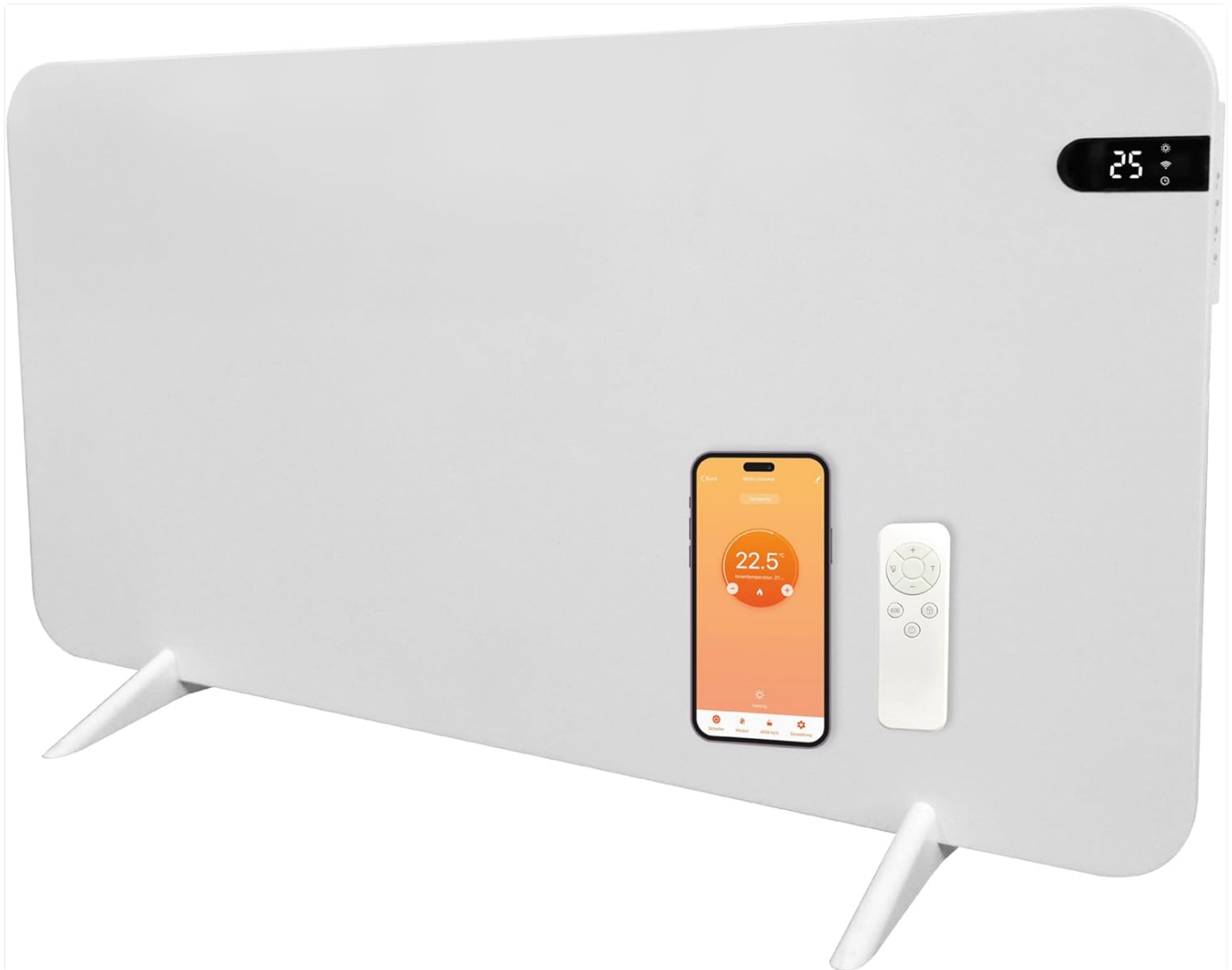
Image: The Königshaus heater set up in a freestanding position, demonstrating its mobile use capability.