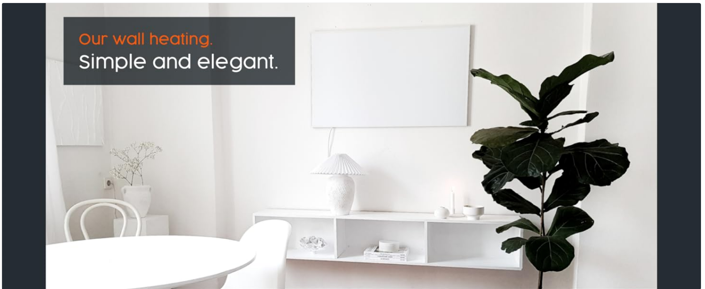
Image: The Könighaus heater installed as a wall-mounted unit, highlighting its minimalist aesthetic.