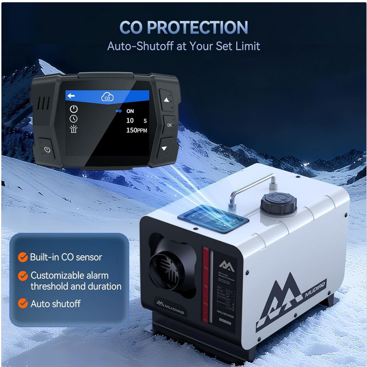
Figure 2: Display illustrating the Carbon Monoxide (CO) protection feature.