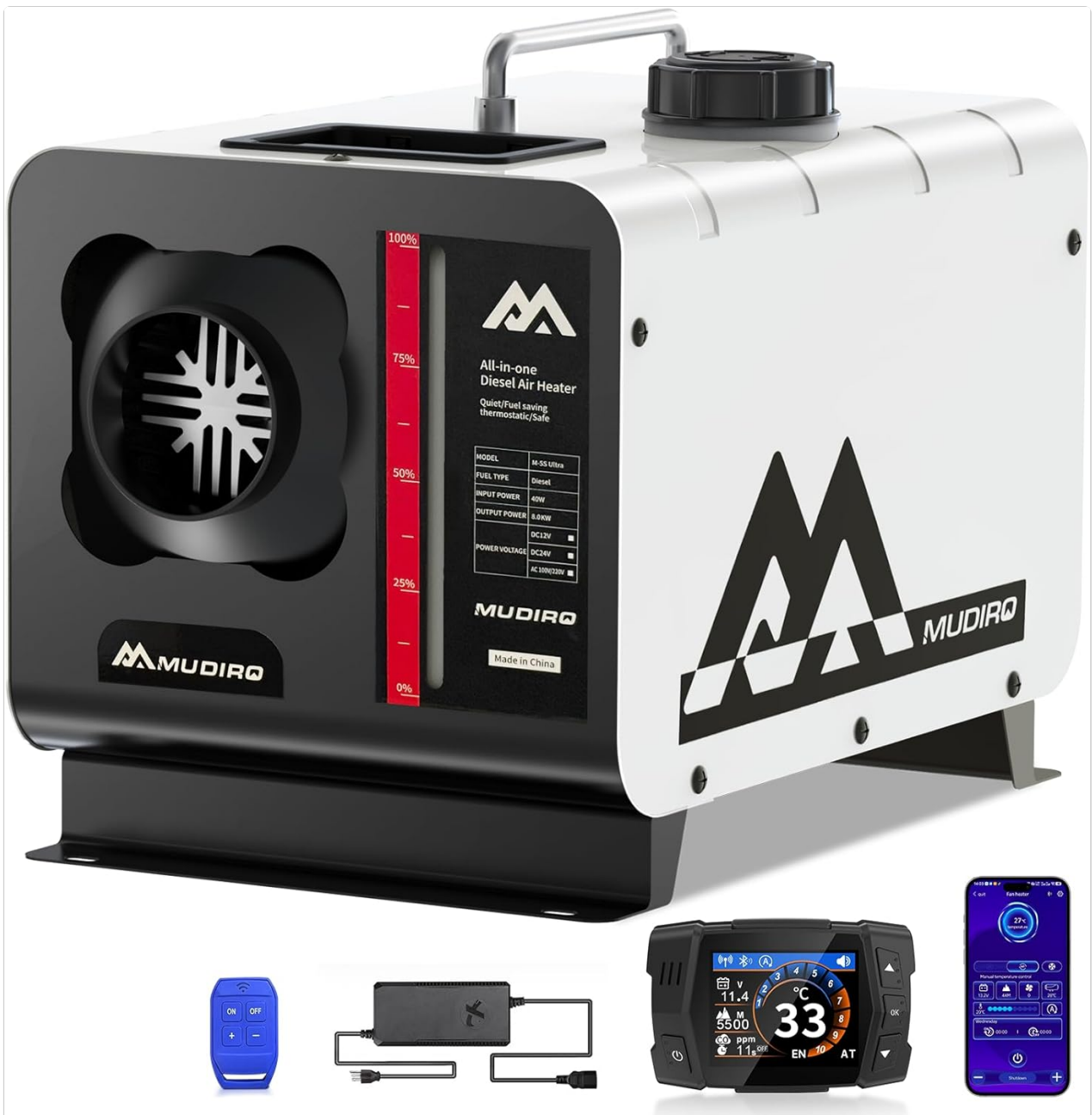
Figure 1: MUDIRO M-5S Evo-H Diesel Heater and included accessories.