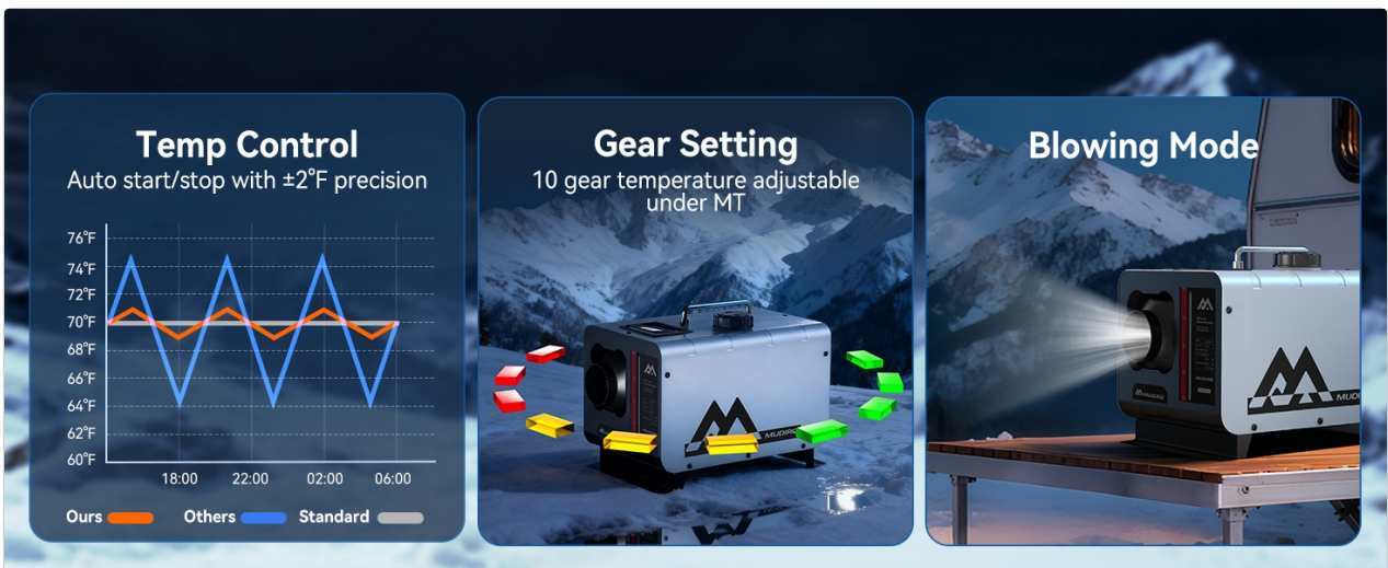
Figure 7: Visual representation of temperature control, gear settings, and blowing mode.