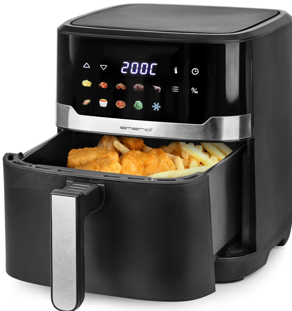
Figure 4: The Emerio AF-132658.3 Hot Air Fryer in use, showing cooked fries and chicken nuggets in the basket.