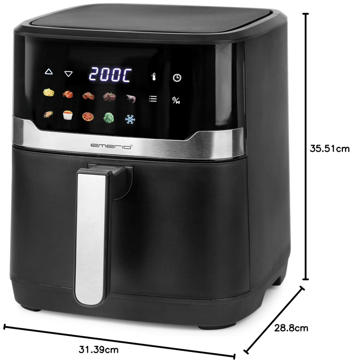
Figure 5: Dimensions of the Emerio AF-132658.3 Hot Air Fryer, showing height, width, and depth measurements.