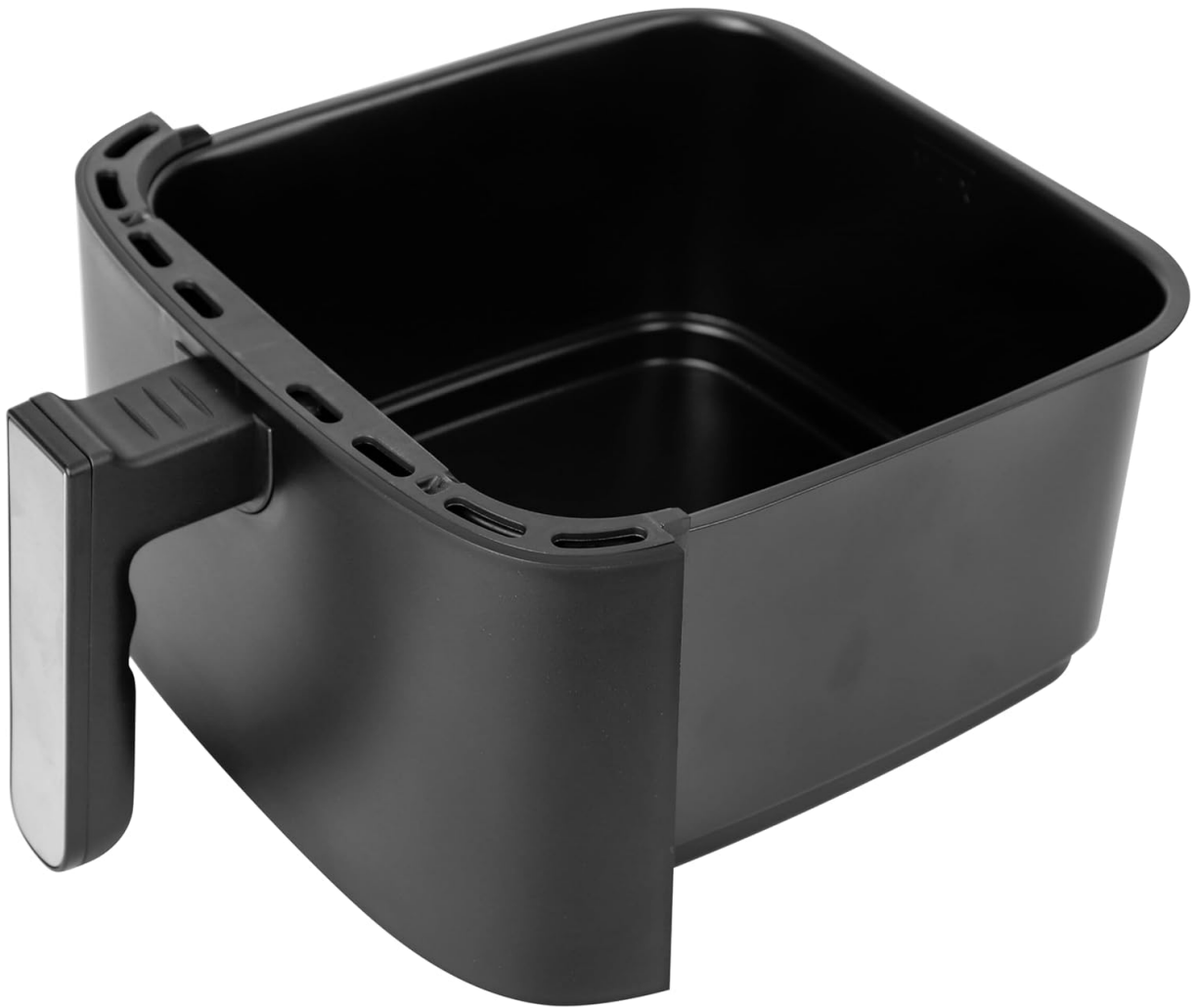
Figure 2: The 6.5-liter frying basket of the Emerio AF-132658.3 Hot Air Fryer, designed for large capacity cooking.