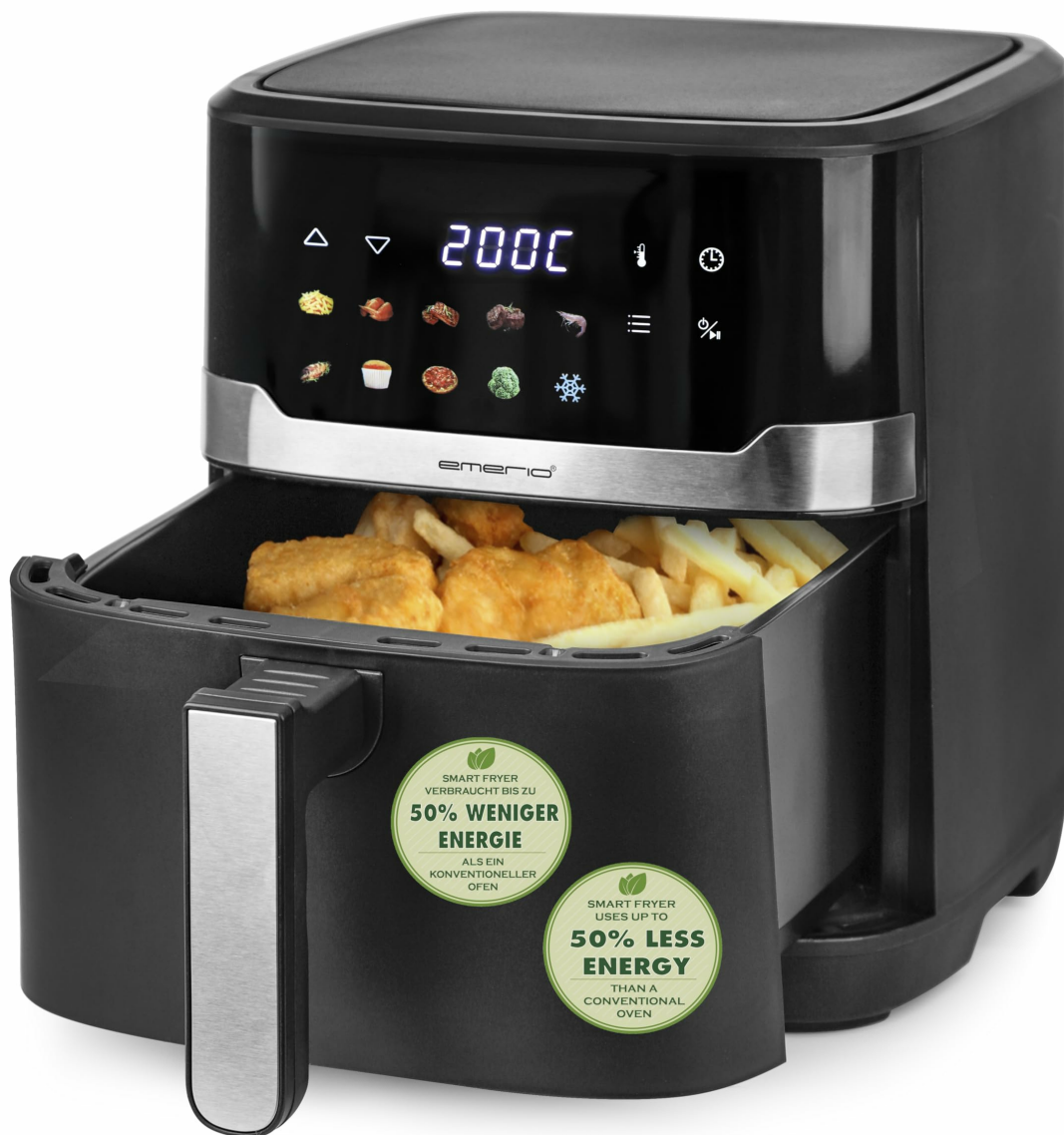
Figure 1: Front view of the Emerio AF-132658.3 Digital XXL Hot Air Fryer, showing the digital color display and handle.

Familiarize yourself with the components of your Emerio Digital XXL Hot Air Fryer.