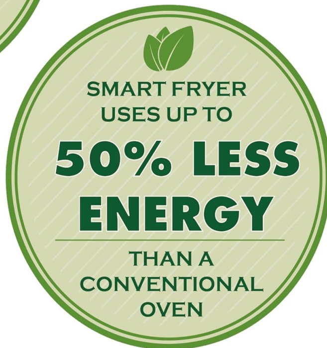
Figure 6: An informational graphic highlighting the energy efficiency of the Smart Fryer, indicating it uses up to 50% less energy compared to a conventional oven.