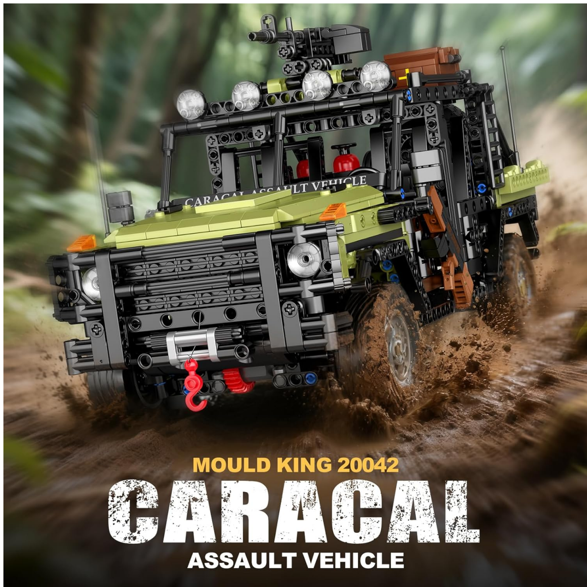
Image: The fully assembled Mould King 20042 Military Truck Off-Road Vehicle, showcasing its detailed design and military-themed features.