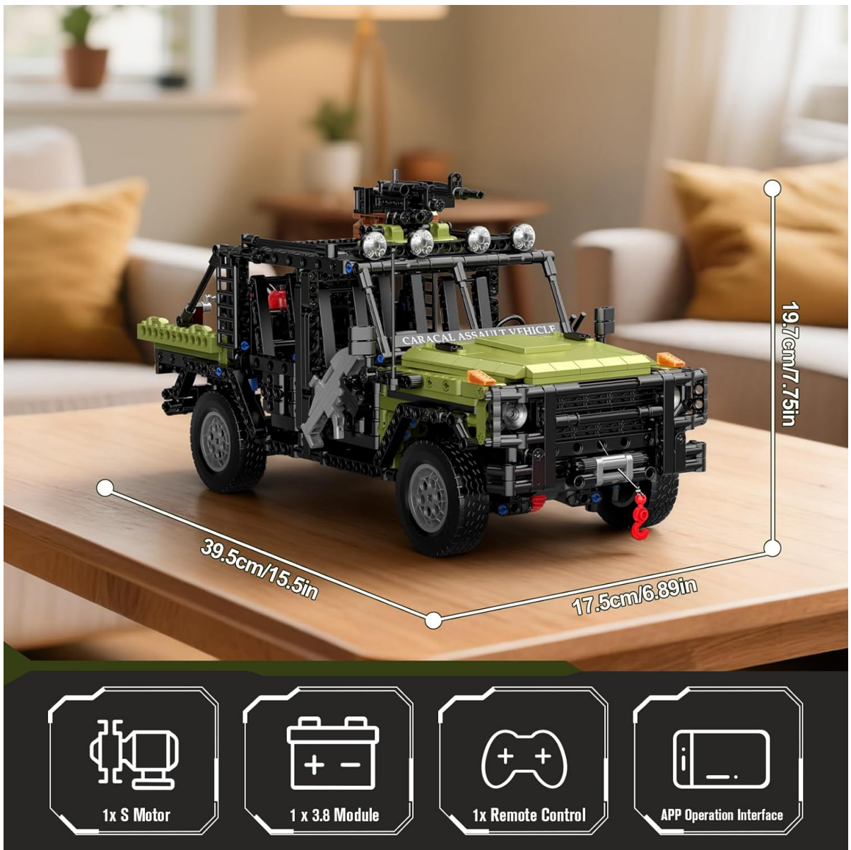
Image: The Mould King 20042 military truck displayed with its key dimensions (length 39.5cm/15.5in, width 17.5cm/6.89in, height 19.7cm/7.75in) and icons indicating its features: 1x S Motor, 1x 3.8 Module, 1x Remote Control, and APP Operation Interface.