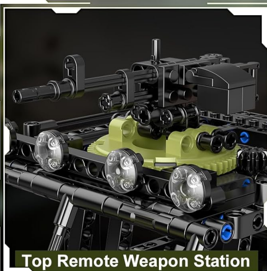
Top Remote Weapon Station