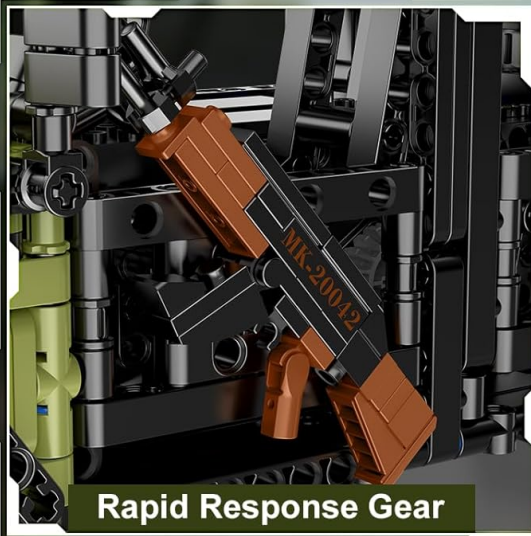
Rapid Response Gear