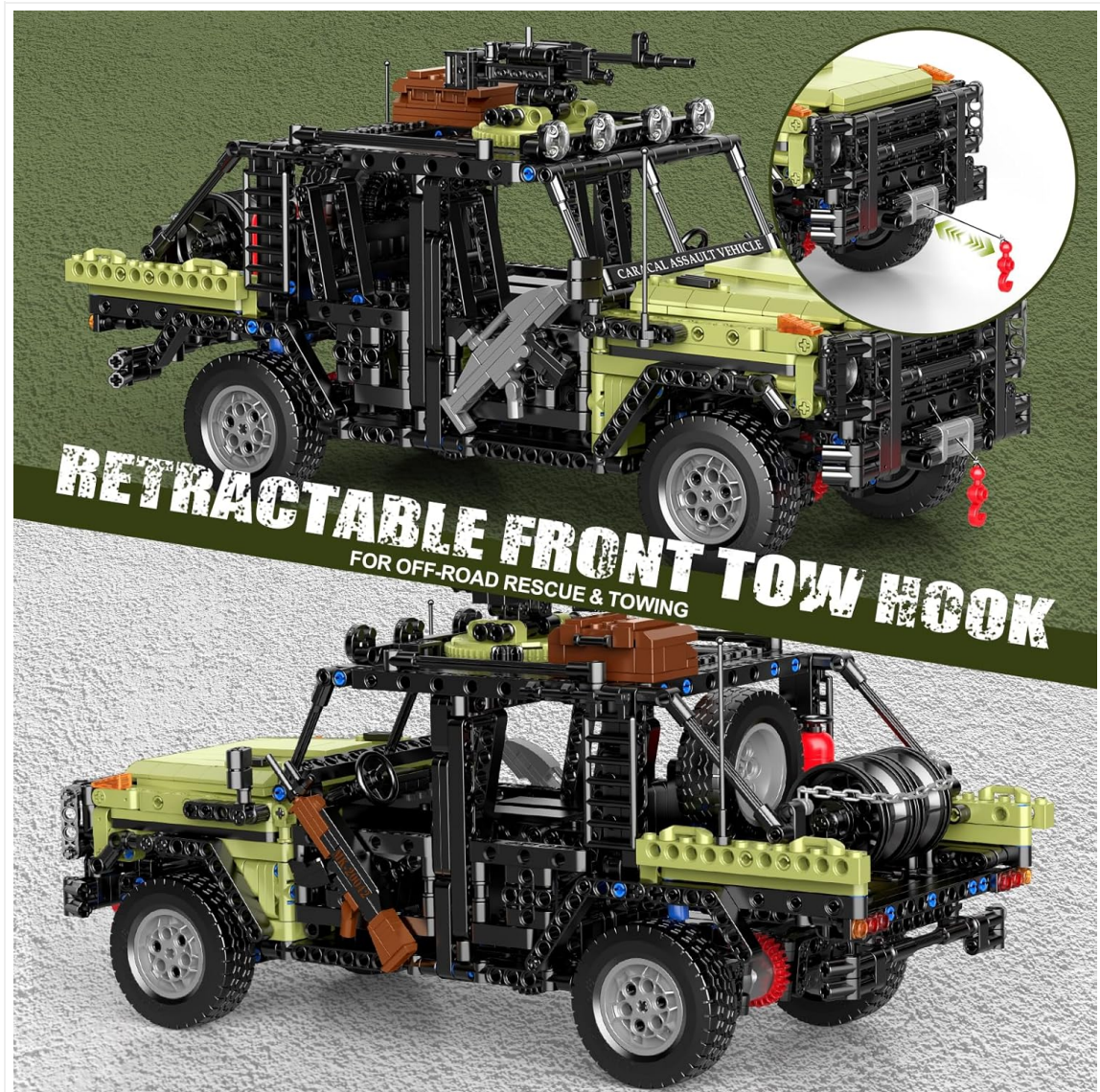
Image: The Mould King 20042 military truck from a side angle, highlighting the retractable front tow hook in an extended position and various details on the rear of the vehicle, including a spare tire and other equipment.