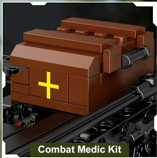
Combat Medic Kit