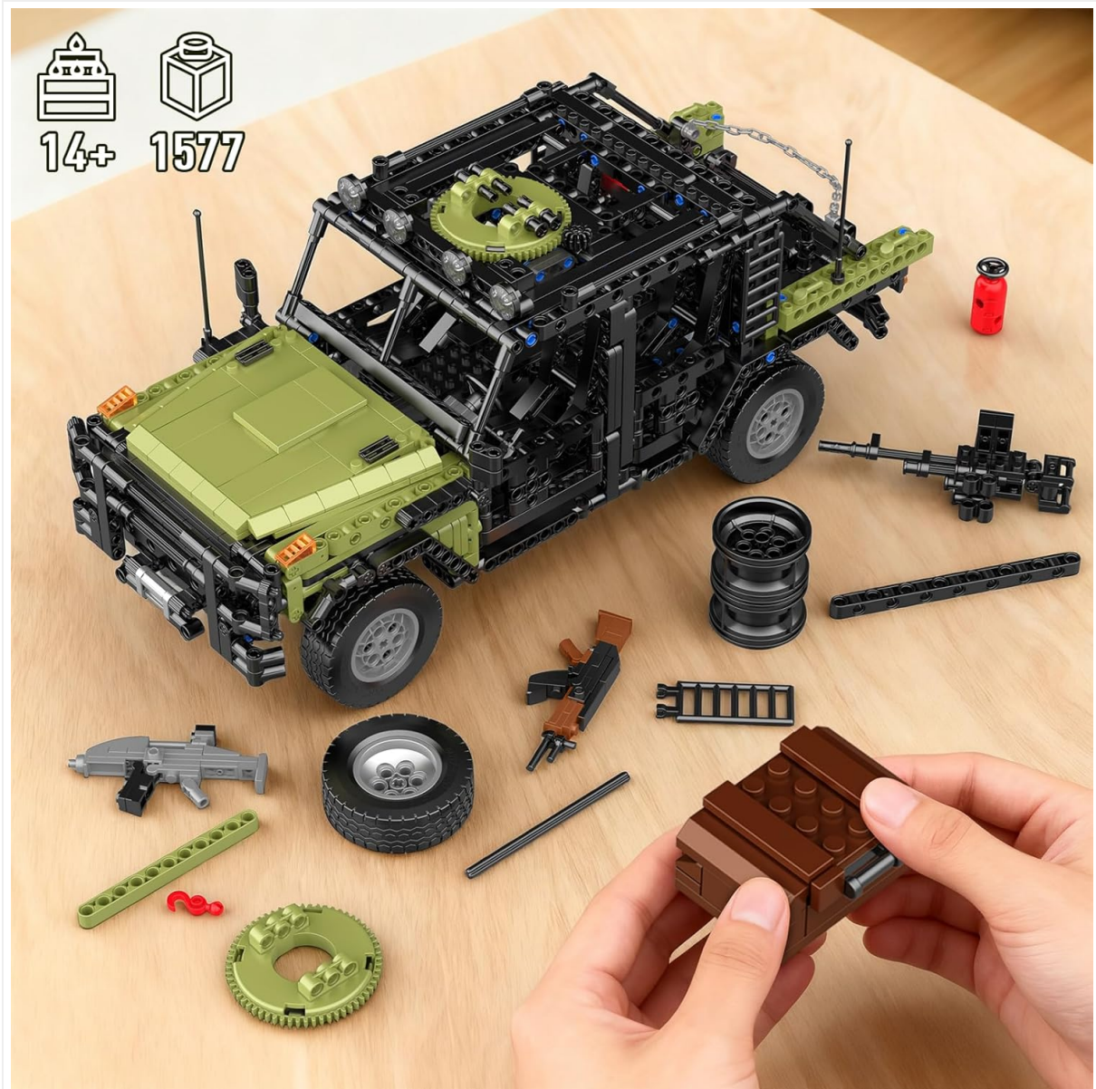
Image: Various parts of the Mould King 20042 building set, including bricks, wheels, and accessories, laid out on a wooden surface, ready for assembly. A partially assembled vehicle chassis is also visible.

Carefully unpack all components. Organize the bricks by type and size to facilitate the building process. Refer to the parts list in the separate instruction booklet to identify all included pieces.