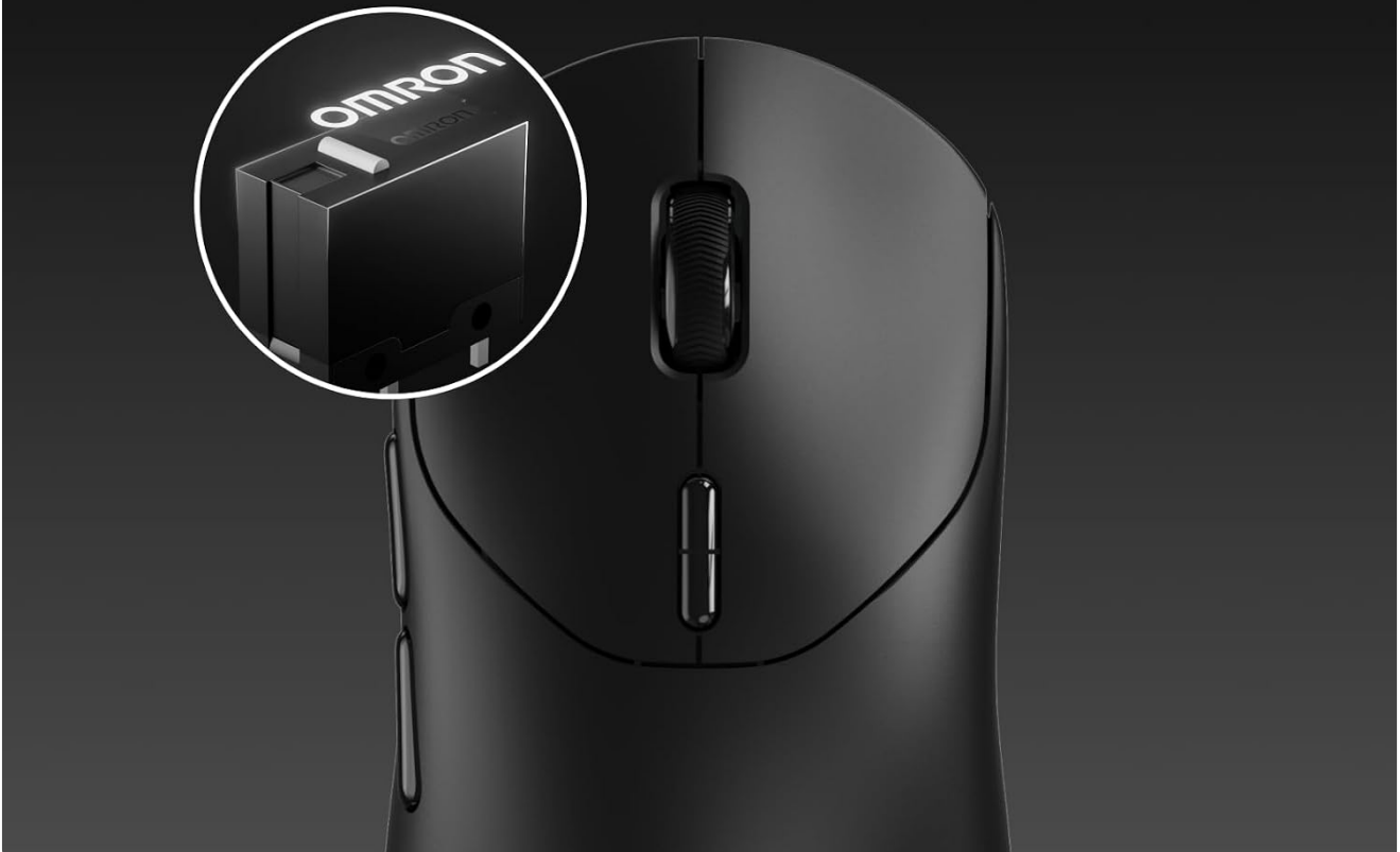
Figure 4: Detail of the Omron mechanical switches, rated for 100 million clicks, ensuring durability.