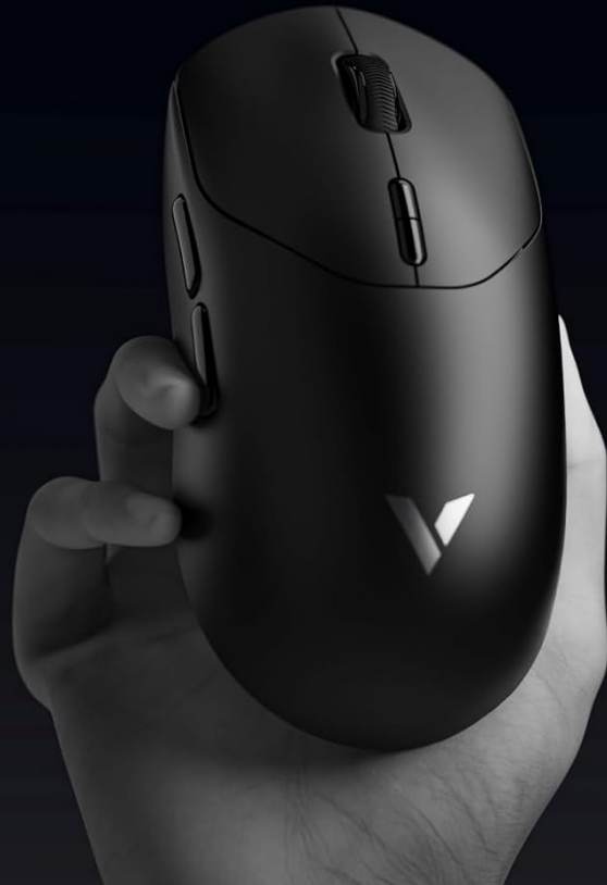
Figure 3: The ambidextrous ergonomic design of the RAPOO VT2 mouse, optimized for comfortable grip.

バランス抜群で素早く的確な操作が可能、 クローグリップ・フィンガータップグリップに最適化。