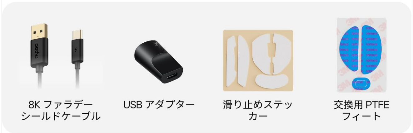
Figure 5: Overview of the RAPOO VT2 mouse dimensions and included accessories.