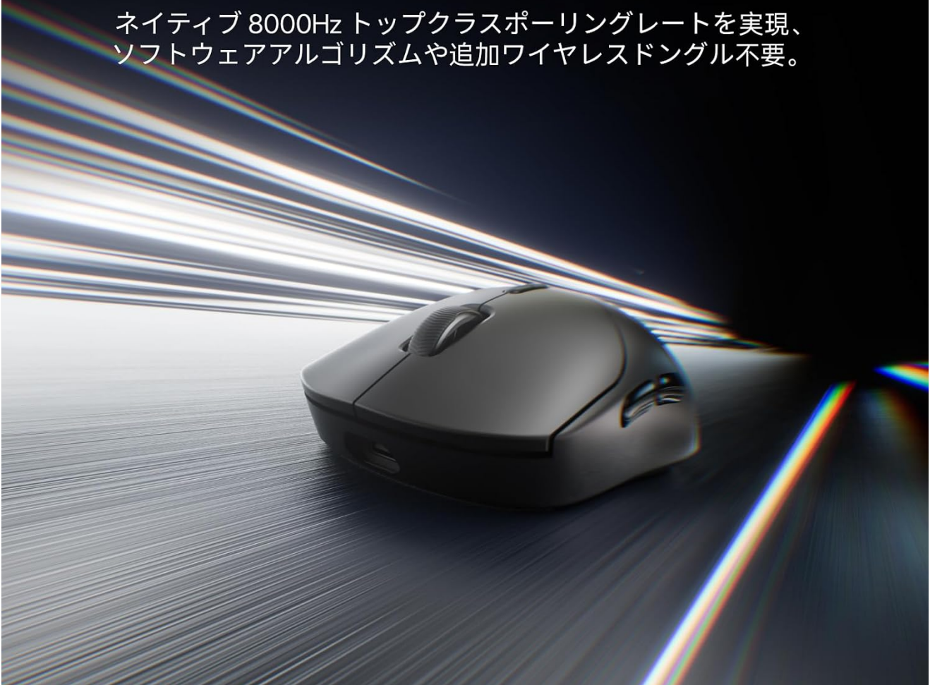
Figure 8: The RAPOO VT2 mouse delivering a true 8K wireless polling rate for superior tracking.

ネイティブ 8000Hz トップクラスポーリングレートを実現、 ソフトウェアアルゴリズムや追加ワイヤレス dongle 不要。