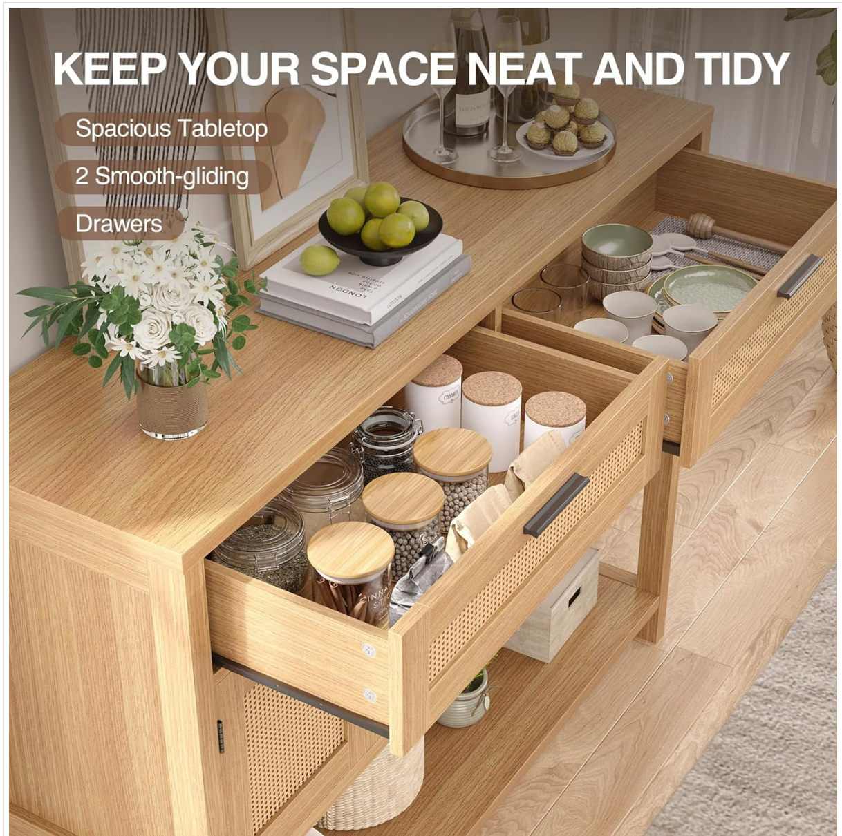
Figure 4.1: Open drawers. This image shows the two top drawers of the cabinet pulled open, revealing ample storage space for various items. The drawers feature smooth-gliding mechanisms.

The two top drawers are designed for smooth operation. Pull the handles gently to open and push to close. Avoid forcing the drawers, especially if they feel stiff, to prevent damage to the glides.