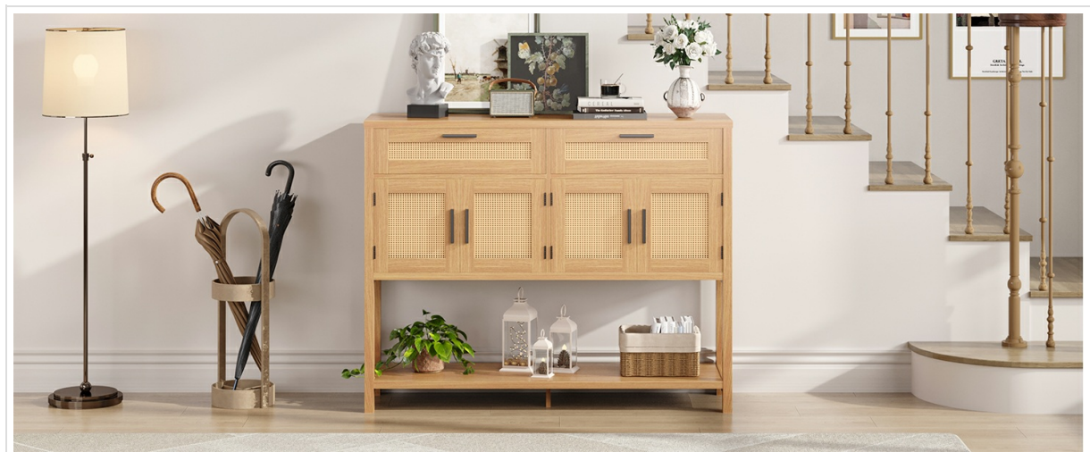
Figure 3.2: Fully assembled cabinet. This image shows the fully assembled cabinet in a dining room, demonstrating its functional use and aesthetic appeal.