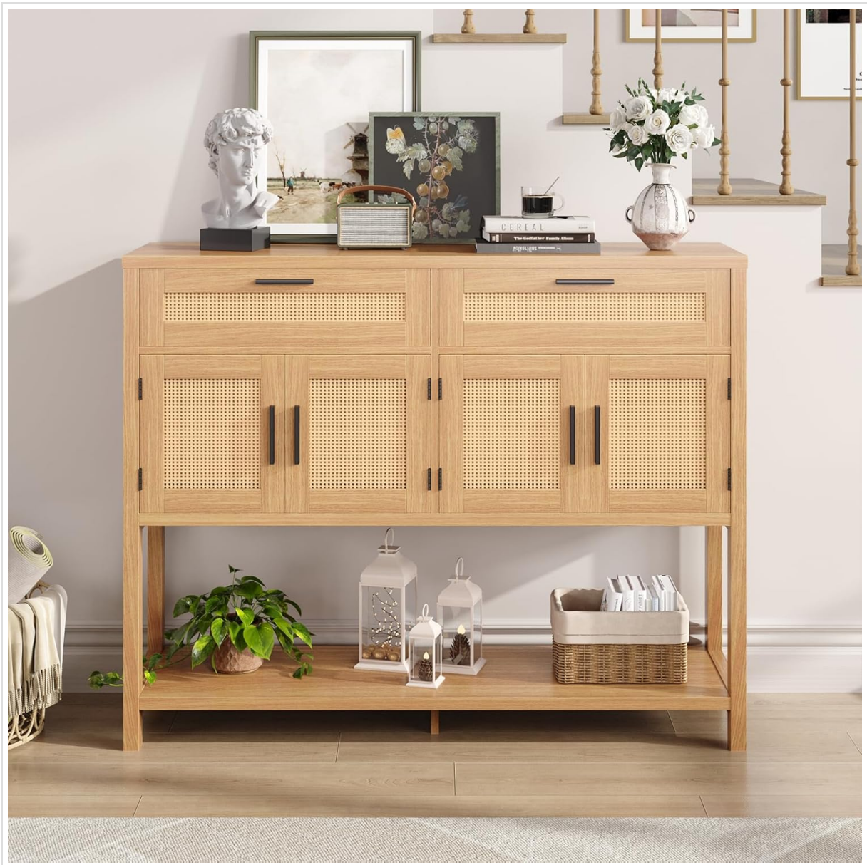
Figure 2.1: The complete FiveWillowise Buffet Sideboard Cabinet. This image displays the complete FiveWillowise Buffet Sideboard Cabinet, highlighting its natural wood finish, two top drawers, four rattan-front doors, and an open bottom shelf. Dimensions are shown as 47.2 inches wide, 14.2 inches deep, and 37.5 inches high, with a weight capacity of 120 lbs on the top surface.