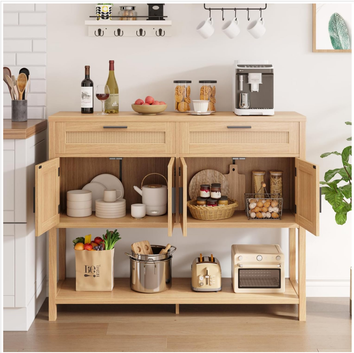
Figure 4.2: Open doors. This image shows the four rattan-front doors of the cabinet opened, revealing interior shelving for organized storage of larger items.