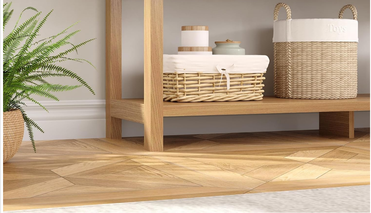
Figure 4.3: Open bottom shelf. This image highlights the spacious open bottom shelf of the cabinet, suitable for storing baskets or decorative items.

Provide ample storage and display space and can support up to 66 pounds