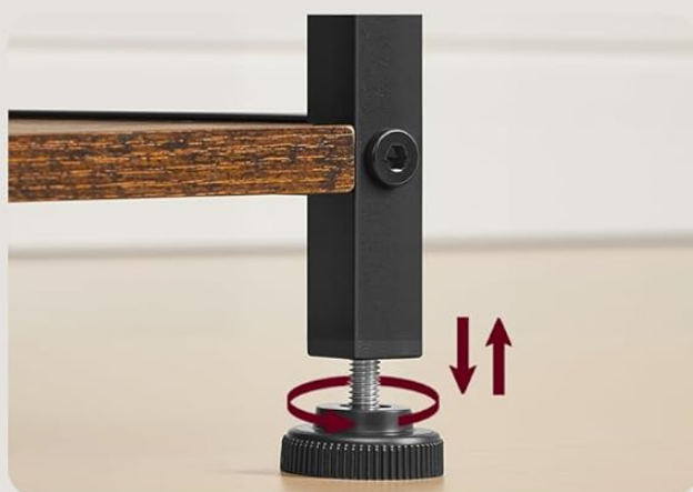
Patas ajustables para mayor estabilidad