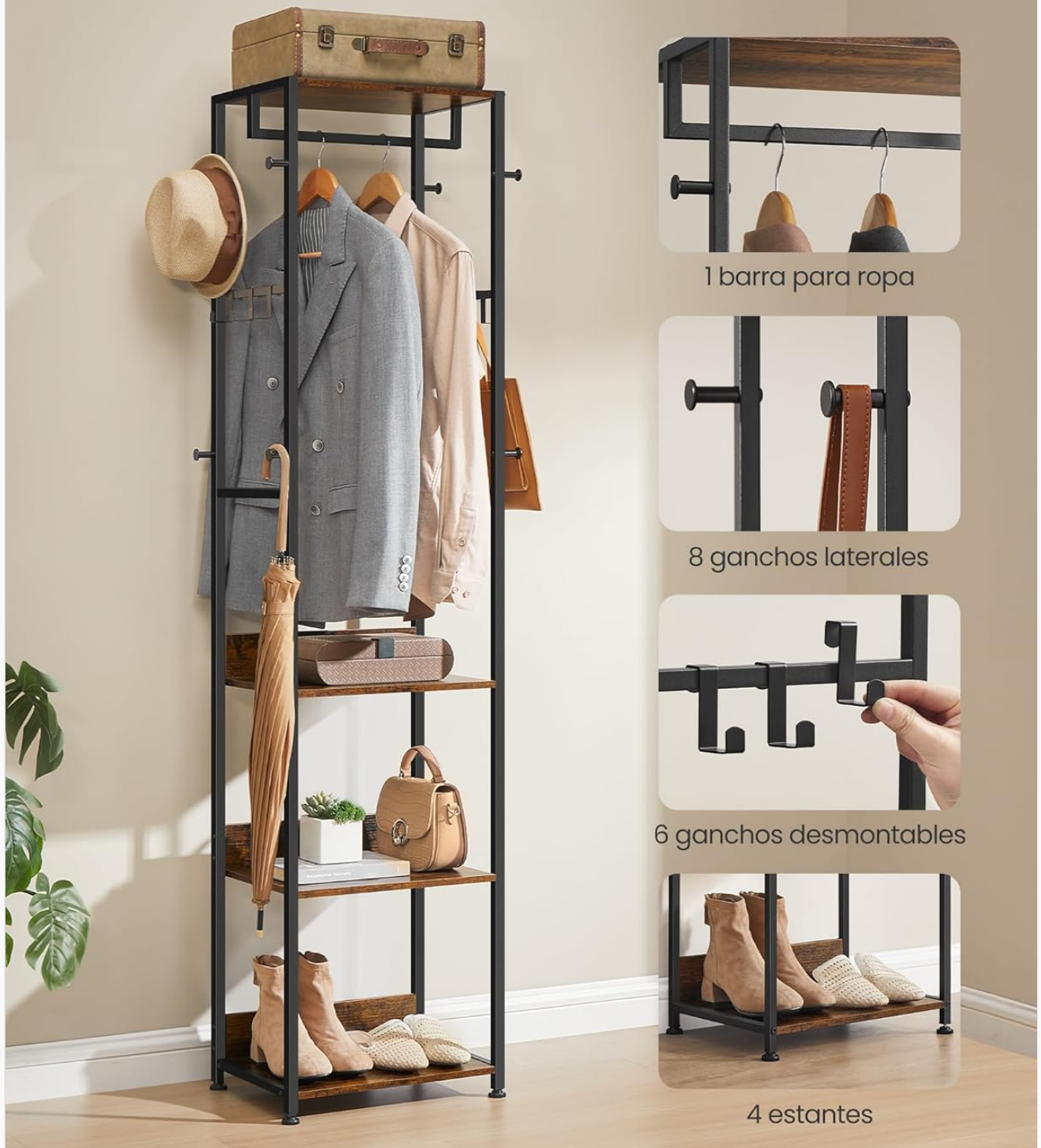
Image 3.1: Breakdown of the coat rack's features, showing the hanging bar, 8 side hooks, 6 removable hooks, and 4 shelves.