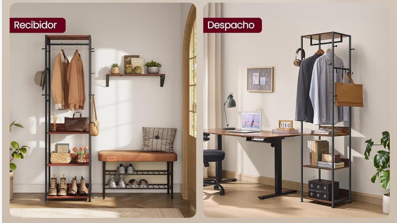
Image 5.1: Versatile usage examples of the coat rack in a living room, bedroom, entryway, and office setting.