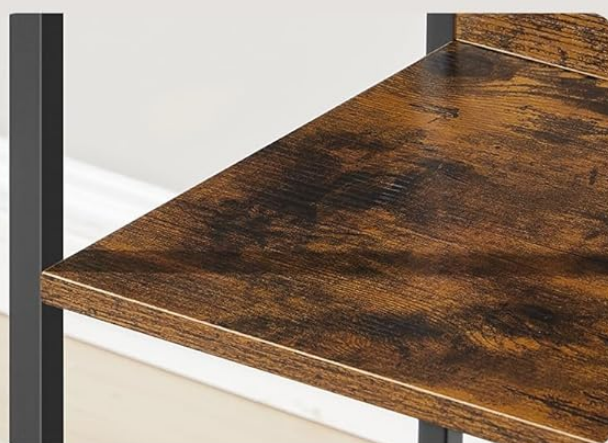
Paneles de aglomerado duraderos

Image 4.1: Details of the robust construction, including rust-resistant coating, adjustable feet for stability, and durable particleboard shelves.