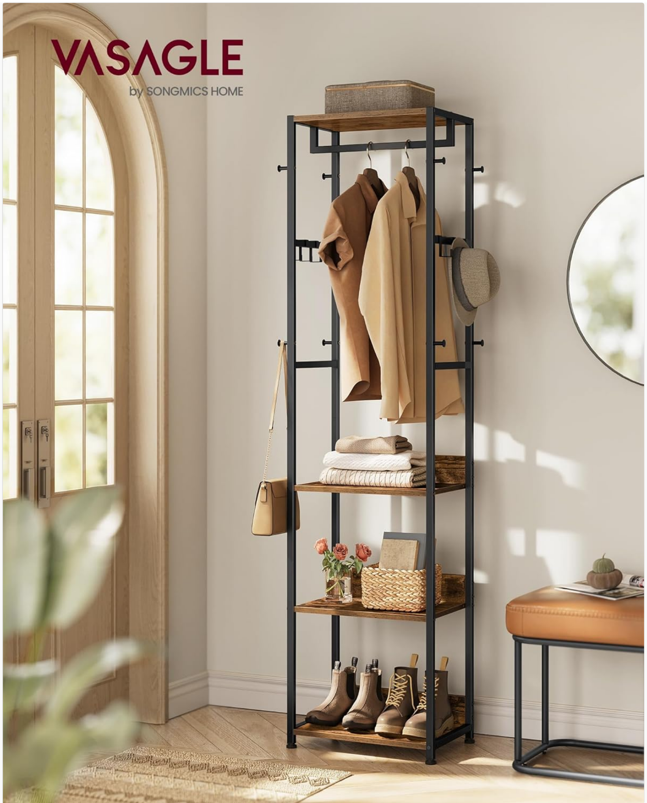
Image 1.1: The VASAGLE Perchero RCR061BD04 assembled in an entryway, showcasing its storage capabilities.