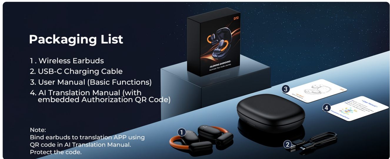
Image 2.1: Illustration of the items included in the product packaging.

Note: The QR code in the AI Translation Manual is essential for binding the earbuds to the translation application. Please protect this code.