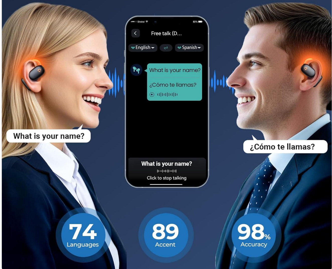
Image 3.1: Visual guide for downloading the companion application for real-time translation.

Scan the QR code in the User Manual to download the APP on iOS /Android. (Free to use) Use the translation earbuds via Bluetooth connection.