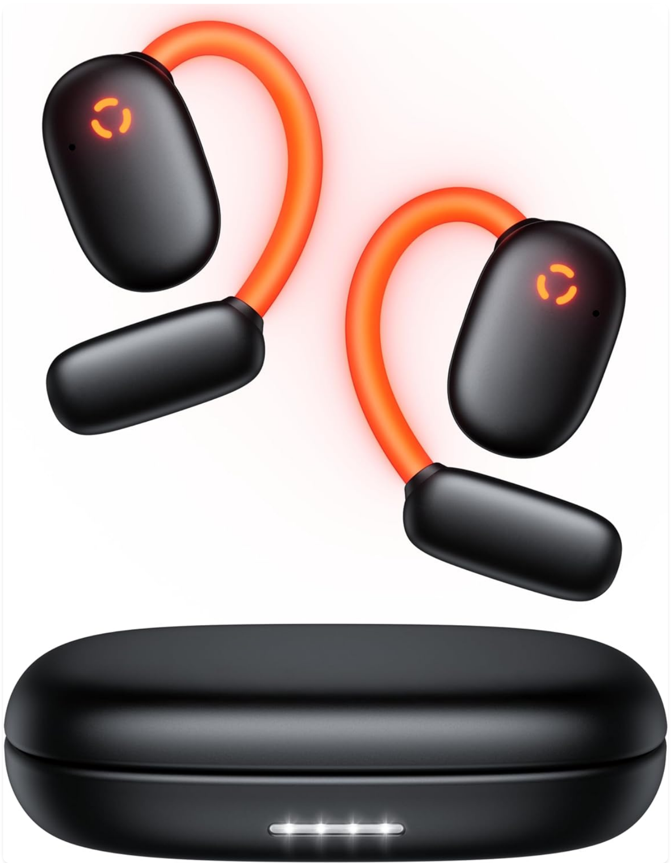
Image 1.1: occiam AI Translation Earbuds D72 with their charging case.