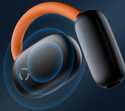
Image 4.1: Overview of the touch control functions on the earbuds.