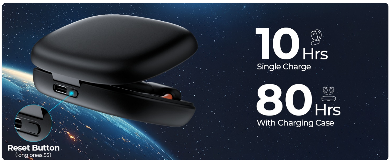
Image 5.1: Battery life and charging capabilities of the earbuds and case.