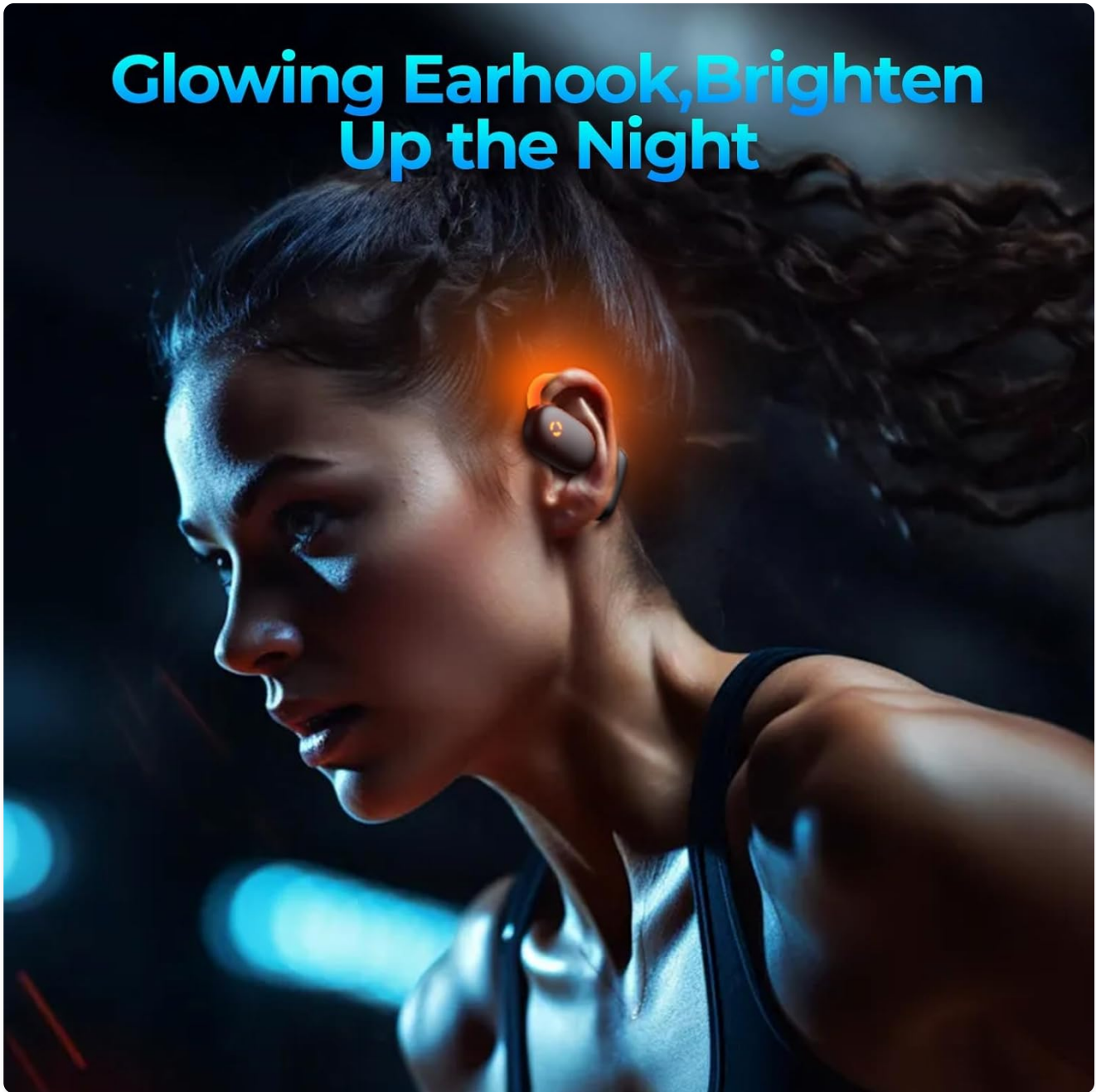
Image 4.4: The glowing earhook feature enhances visibility during low-light conditions.

The earbuds feature an activated glowing earhook for safety during nighttime activities. To turn the earhook light off, tap either earbud 5 times. Repeat the action to turn the light back on.