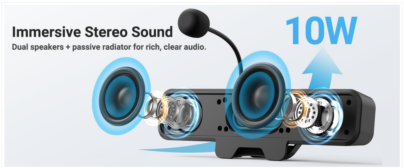
Figure 6: Immersive Stereo Sound

An internal diagram of the speaker, showing the dual high-performance drivers and a passive bass radiator, which work together to produce rich, clear audio with enhanced bass.