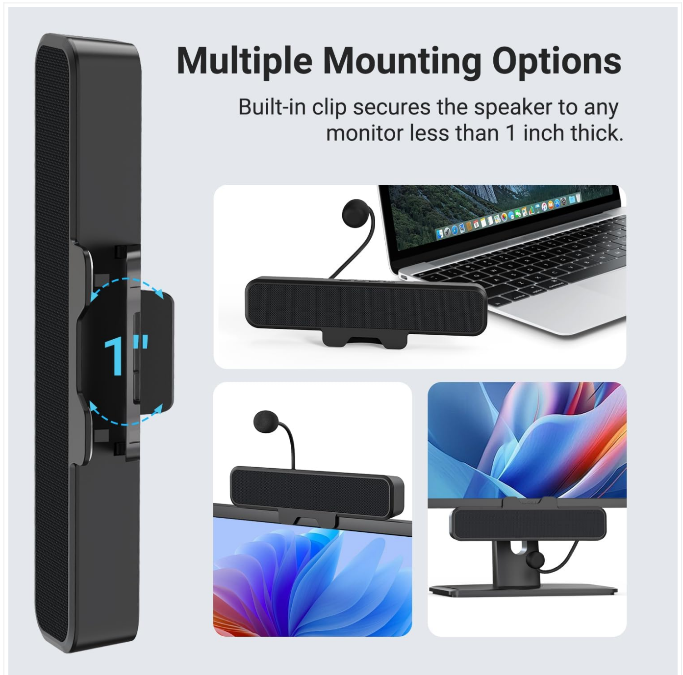
Figure 2: Multiple Mounting Options

This image illustrates how the speaker can be securely clipped to the top of a monitor (up to 1 inch thick) or placed on a desk using its integrated stand. Note: Not compatible with curved-back monitors for clip-on mounting.