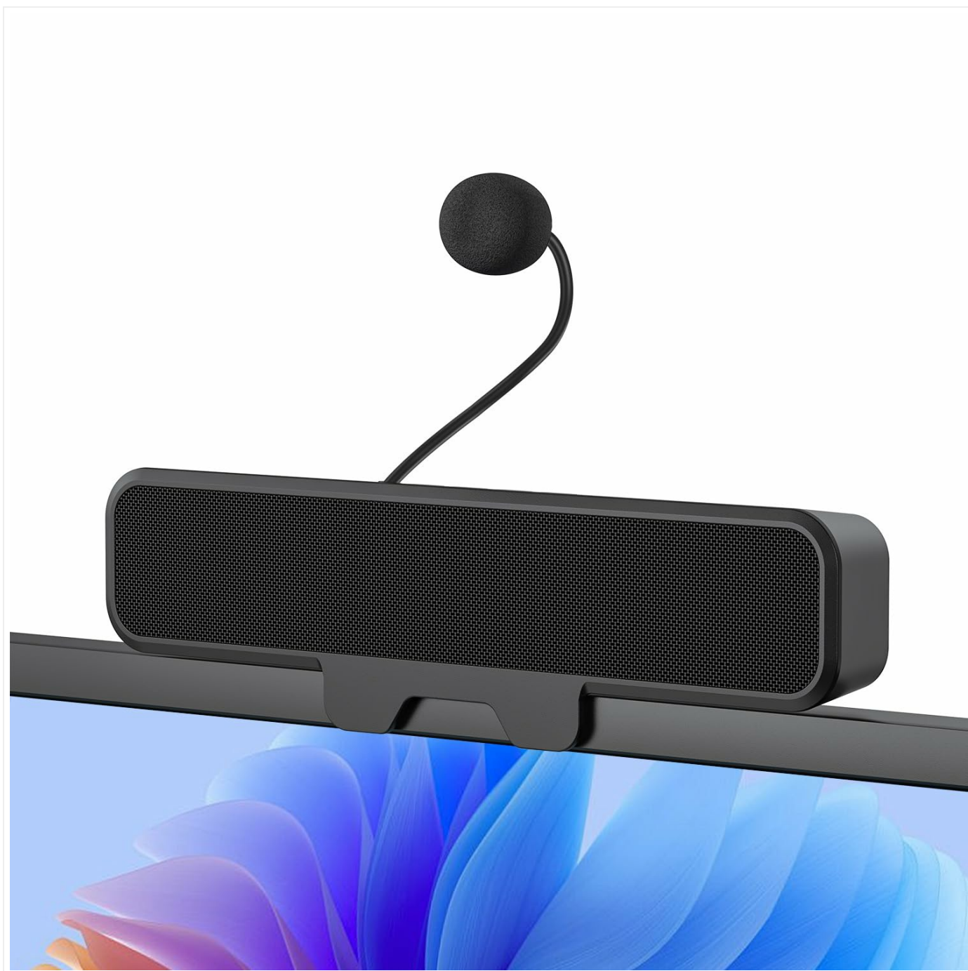
Figure 1: INGA HKDR631M Computer Speakers

A black soundbar-style speaker with a detachable microphone attached, positioned on a desk in front of a computer monitor displaying a video conference.