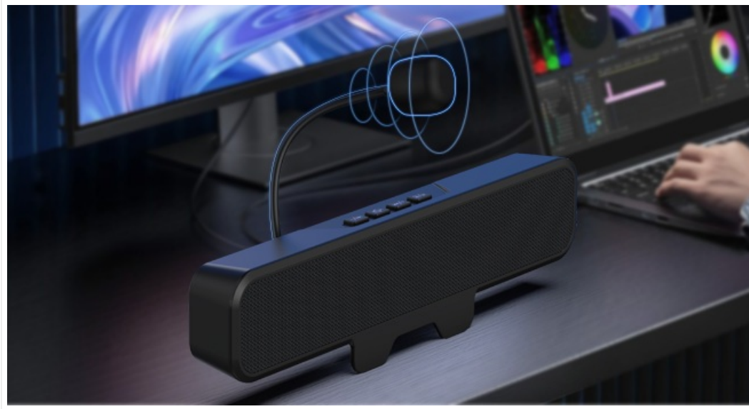
Figure 3: Attaching the Detachable Microphone

A close-up view of the speaker unit, highlighting the port where the flexible, unidirectional microphone is inserted.