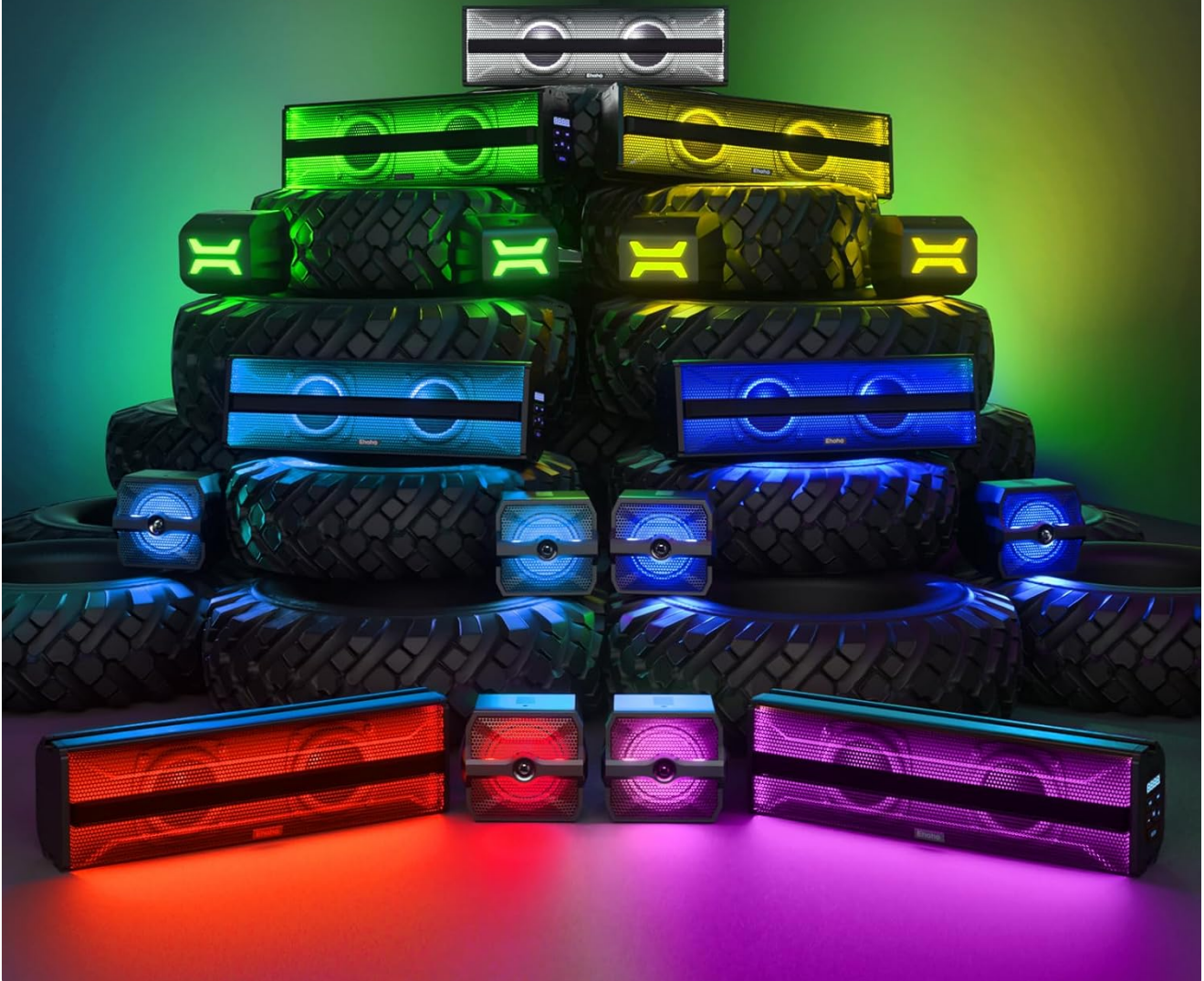
Image: Multiple Ehaho sound bars and speakers displaying various beat-synced RGB light colors.