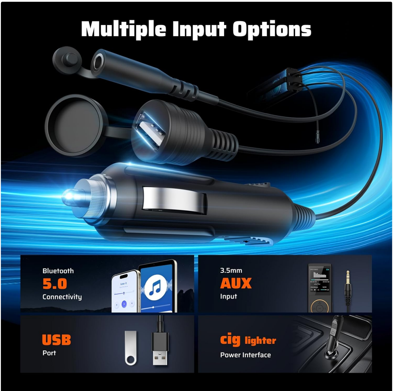
Image: Diagram illustrating the various input options and power connection methods for the sound bar system.