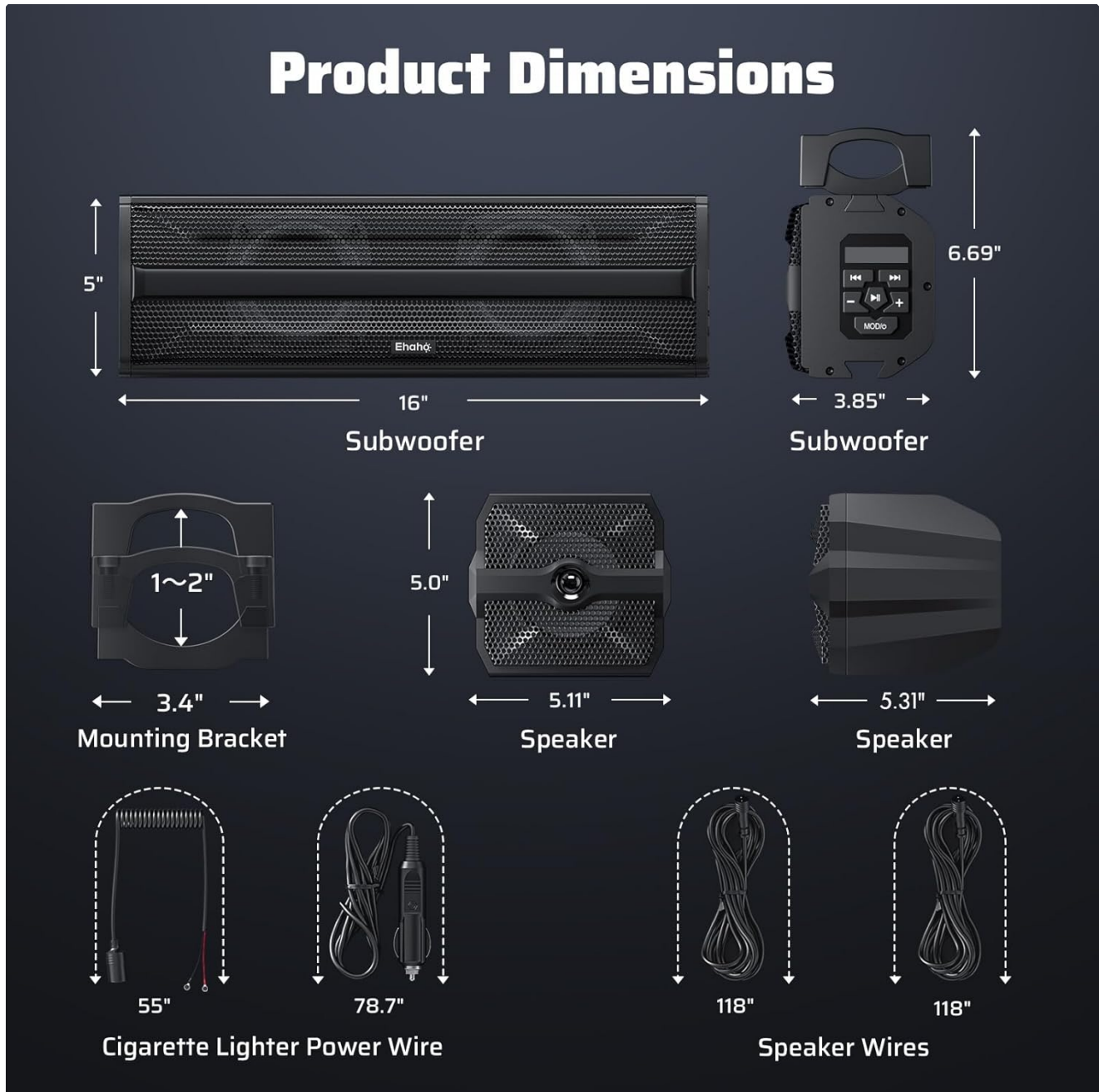
Image: Detailed dimensions of the soundbar, speakers, mounting brackets, and included cables.