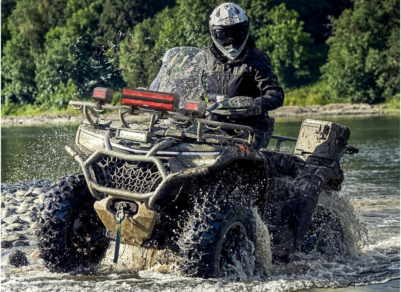
Image: An ATV splashing through water, highlighting the IP66 waterproof and dustproof features of the sound bar.