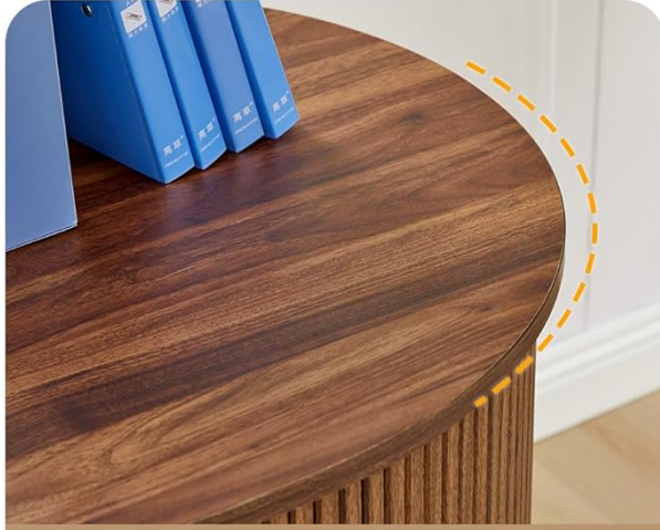
Curved Table Corner