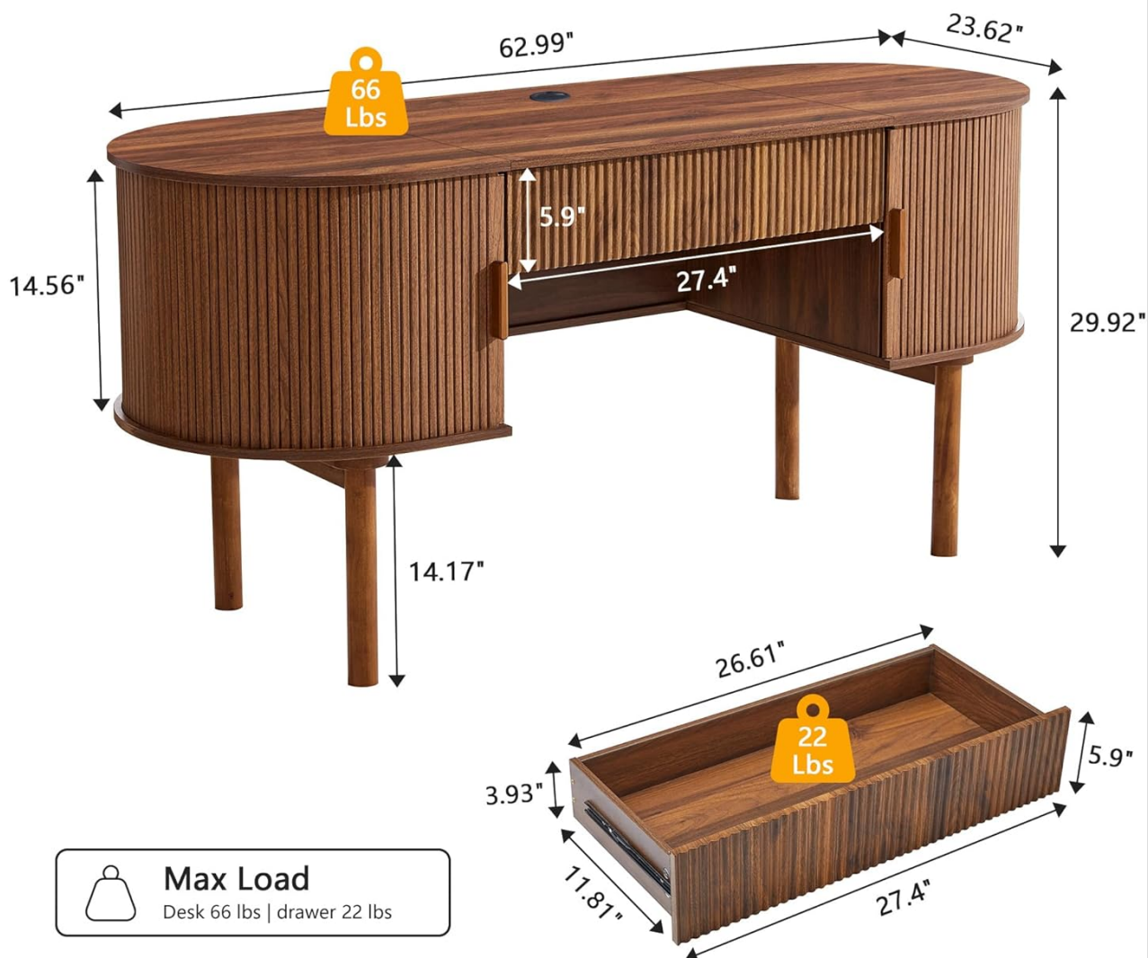
Image: An example of the desk components, though actual parts may vary.