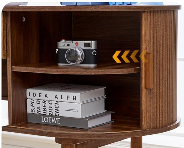
Sliding Tambour Door