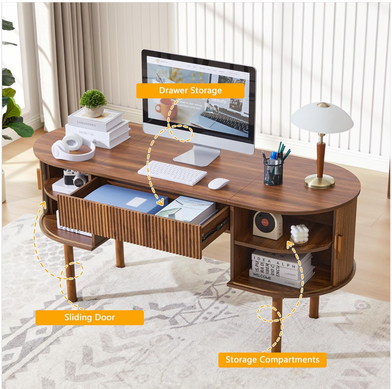
Image: A close-up view of the open drawer, highlighting its storage capacity.