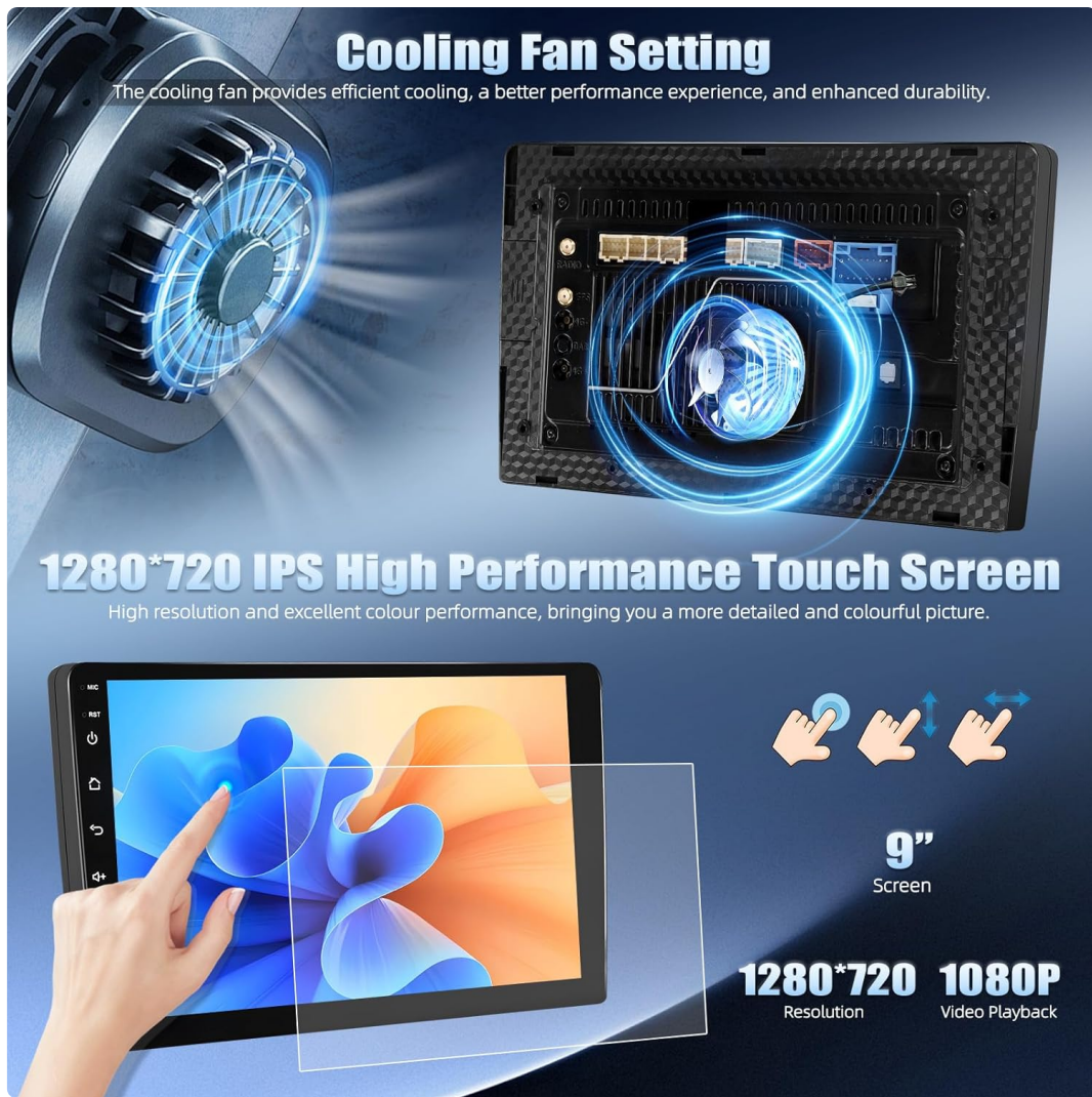
Image 2.2: Details on the integrated cooling fan for optimal performance and the high-resolution 9-inch IPS touchscreen.