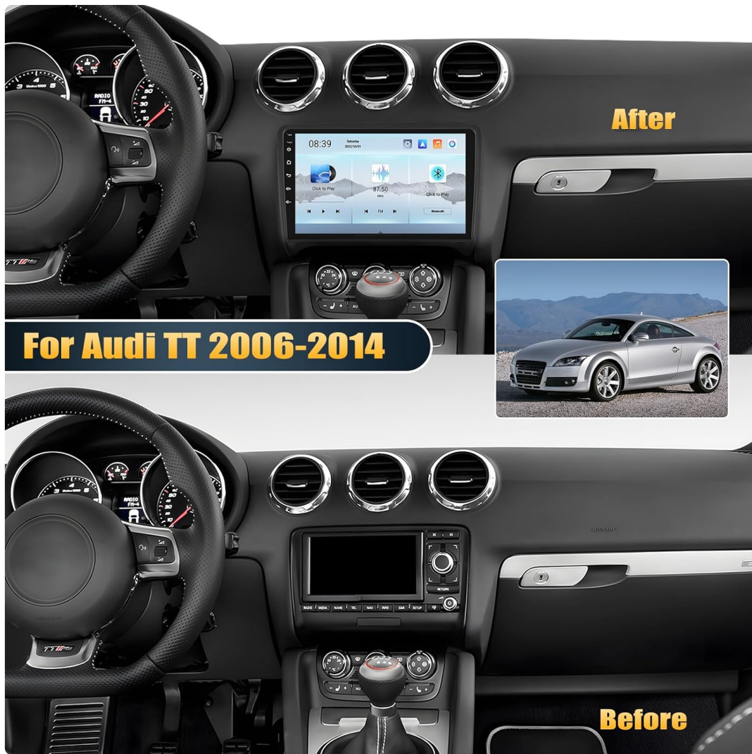
Image 3.1: Visual comparison of the Audi TT dashboard before and after the CAMECHO autoradio installation.