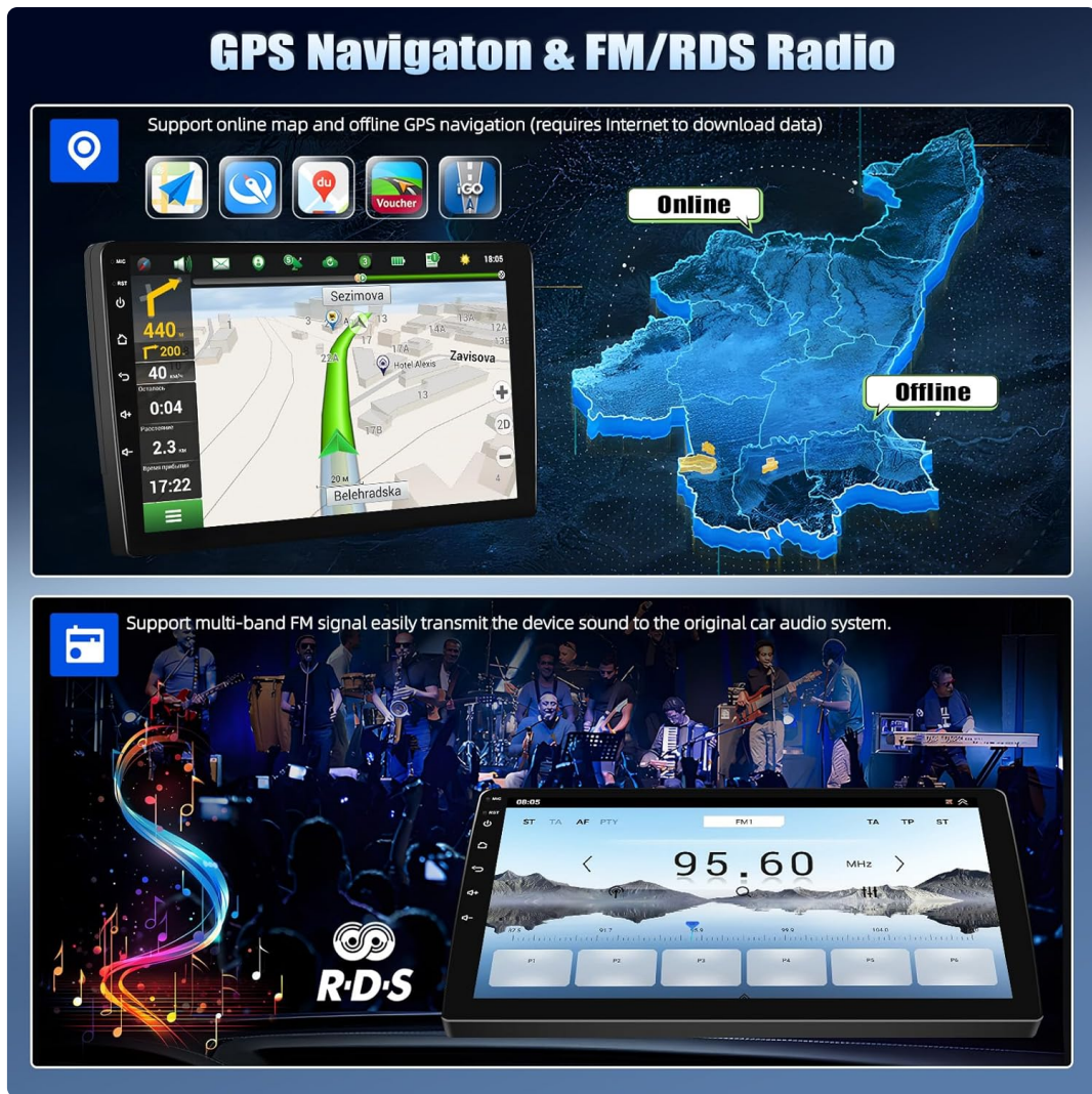
Image 6.1: FM/RDS radio interface, demonstrating station tuning and information display.