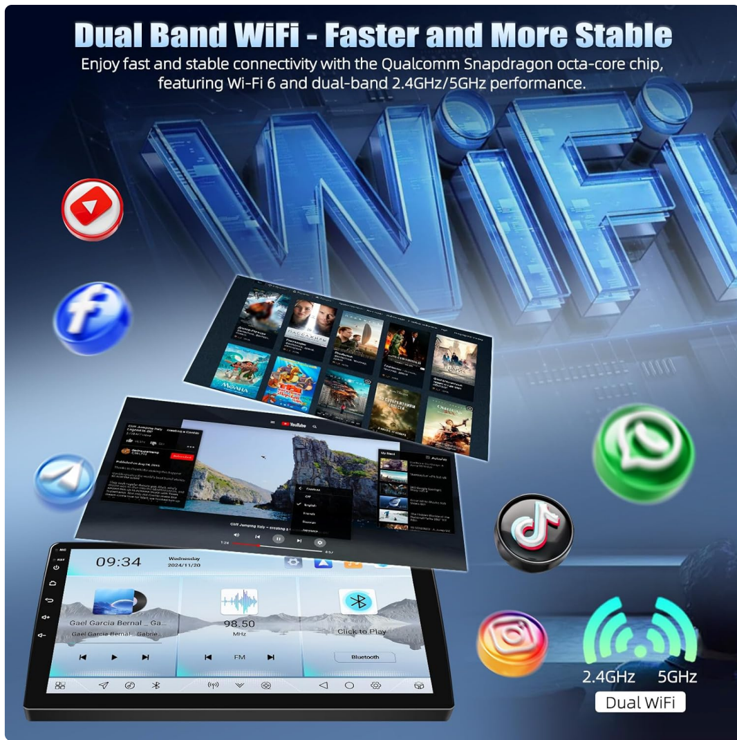
Image 5.2: Illustration of the dual-band WiFi capability, enabling access to online content and applications.