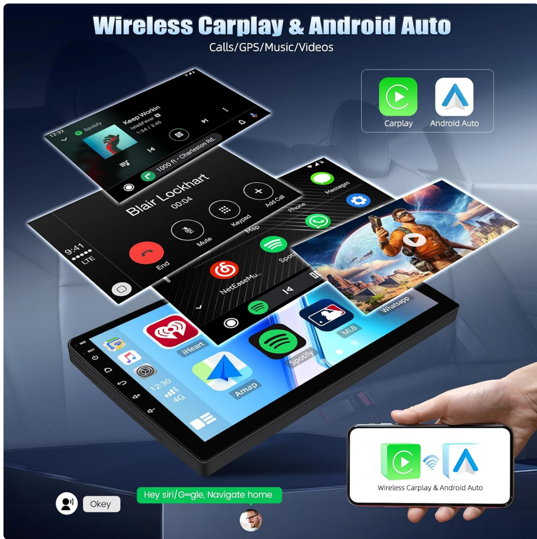
Image 5.1: Display of the Wireless CarPlay and Android Auto interface, demonstrating integrated smartphone applications.