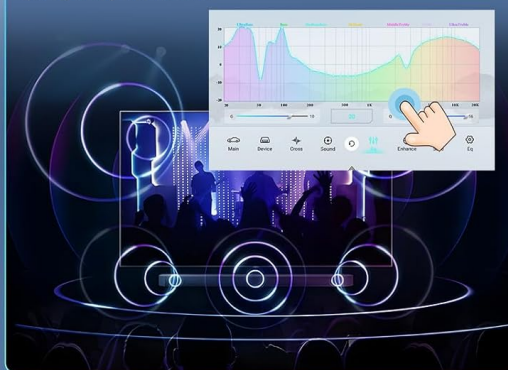
Image 2.1: Overview of key features including the Qualcomm Snapdragon processor, Bluetooth, Dolby Audio, Hi-Res Audio, and DSP for enhanced sound.

Advanced audio processing for enhanced sound quality and performance