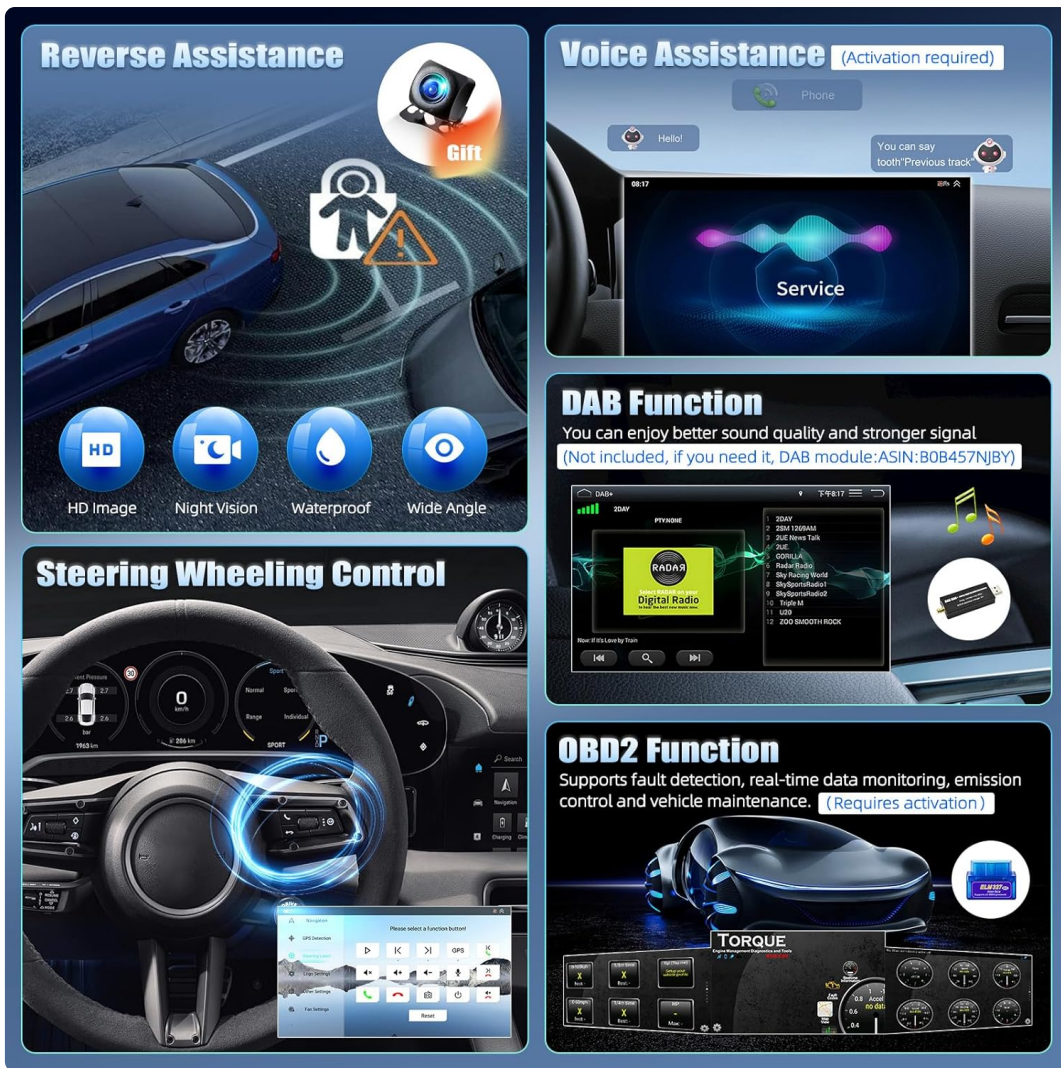
Image 7.1: Overview of reverse assistance, voice control, DAB+ radio, OBD2 diagnostics, and steering wheel control features.