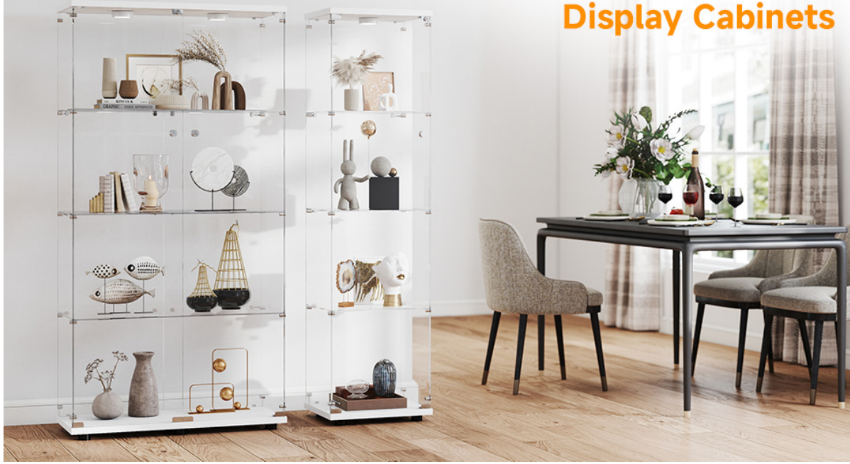
Image 1.1: The Zevemomo Tempered Glass Display Cabinet (Single Door-WHITE) showcasing various items in a living room.