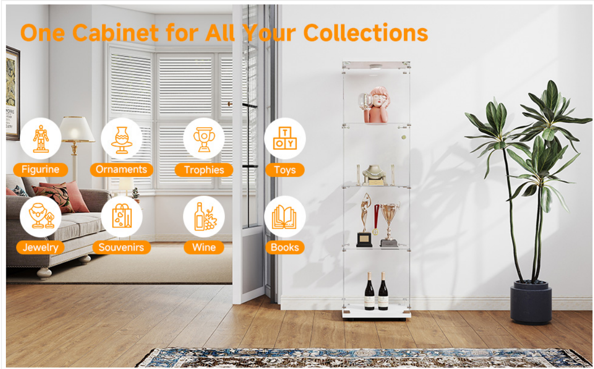
Image 6.1: The high-quality tempered glass used in the cabinet, designed for durability.