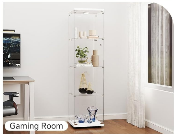
Image 8.1: The cabinet's large capacity, suitable for displaying a wide range of items.