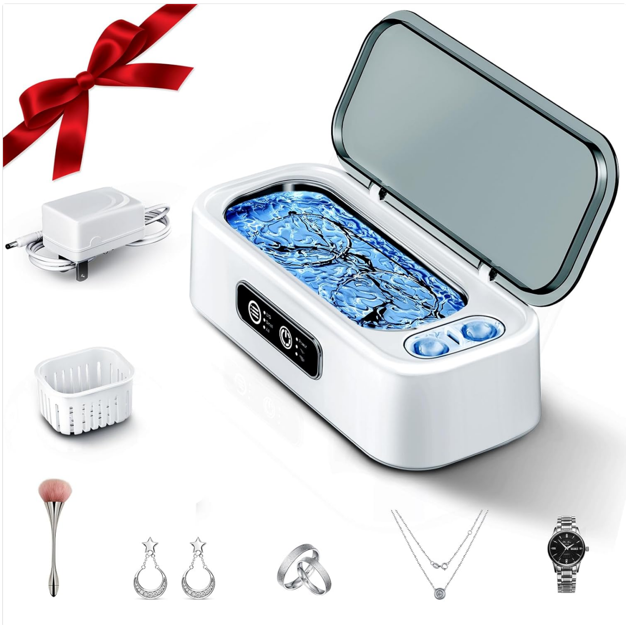
Figure 1: SUNPOW Ultrasonic Jewelry Cleaner Machine and included accessories.