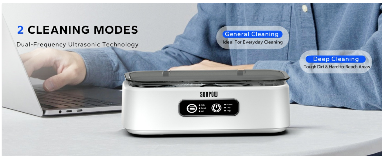
Figure 6: Intuitive control panel for easy operation.