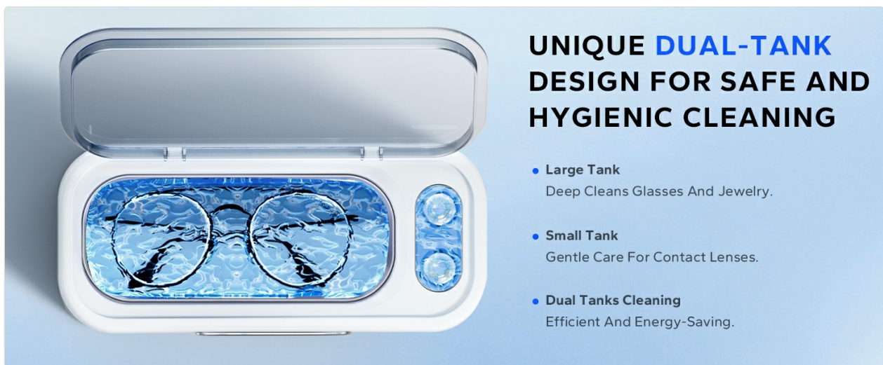
Figure 5: Cleaning modes and their applications.