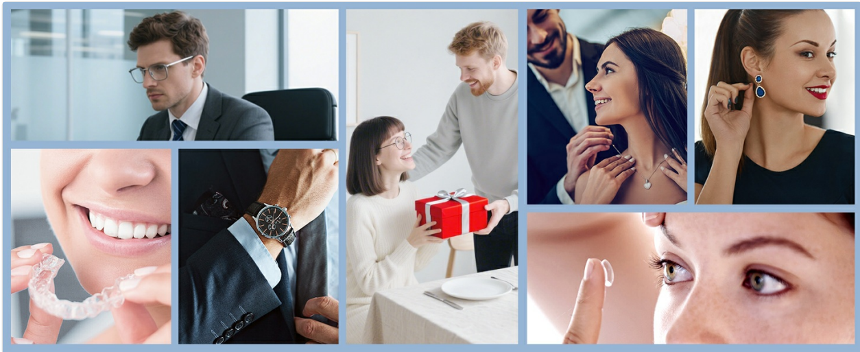
Figure 7: Guidelines for item compatibility.