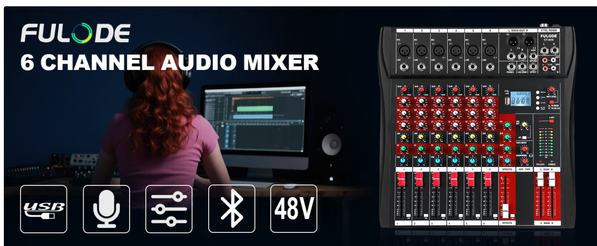
Image: Overview of the FULODE CT-60 mixer, illustrating its main features and compact design.