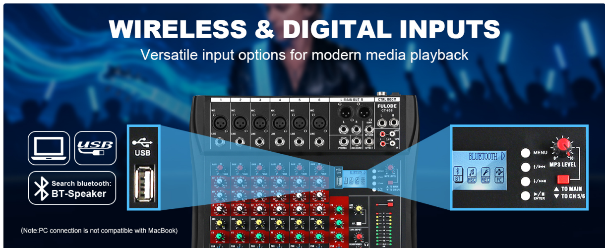
Image: Visual guide to connecting devices via USB or Bluetooth, highlighting the "BT-Speaker" pairing name.