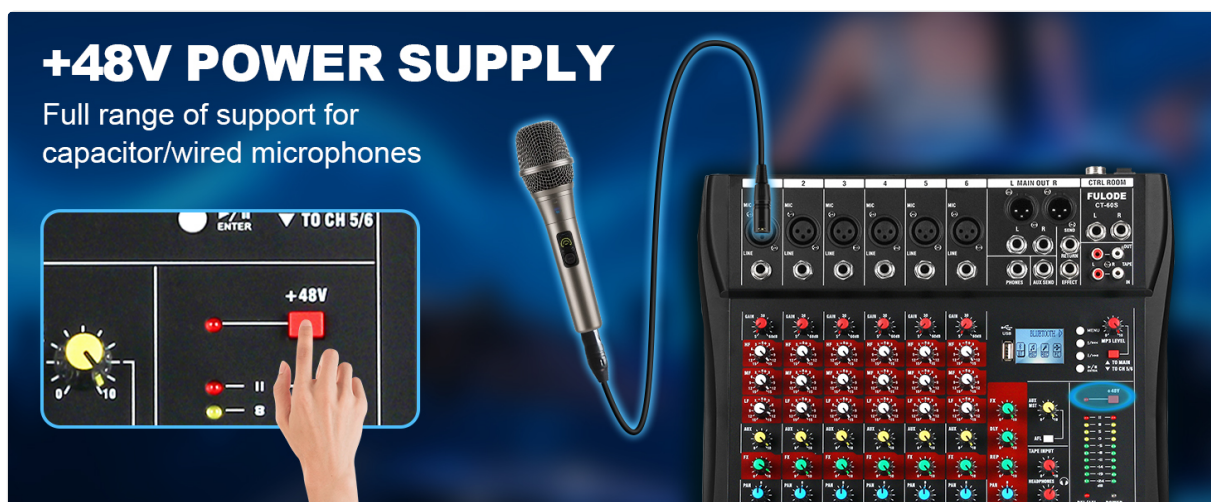
Image: Illustration of the +48V phantom power feature, essential for condenser microphones.

Caution: Do not activate +48V phantom power when dynamic microphones or other non-phantom powered devices are connected via XLR, as this may cause damage.