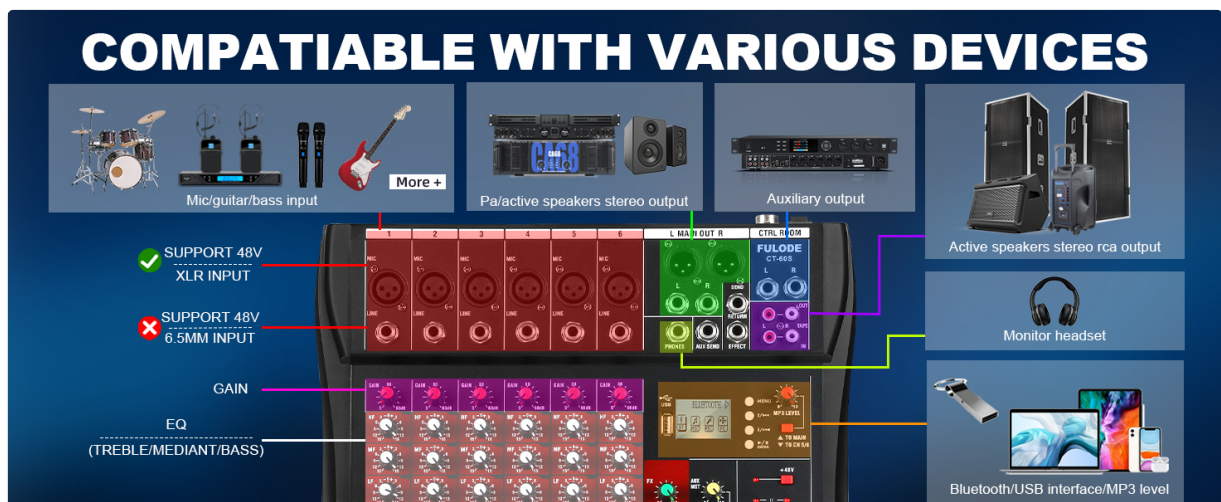
Image: Connectivity diagram illustrating how to connect microphones, instruments, speakers, and other audio devices to the mixer.