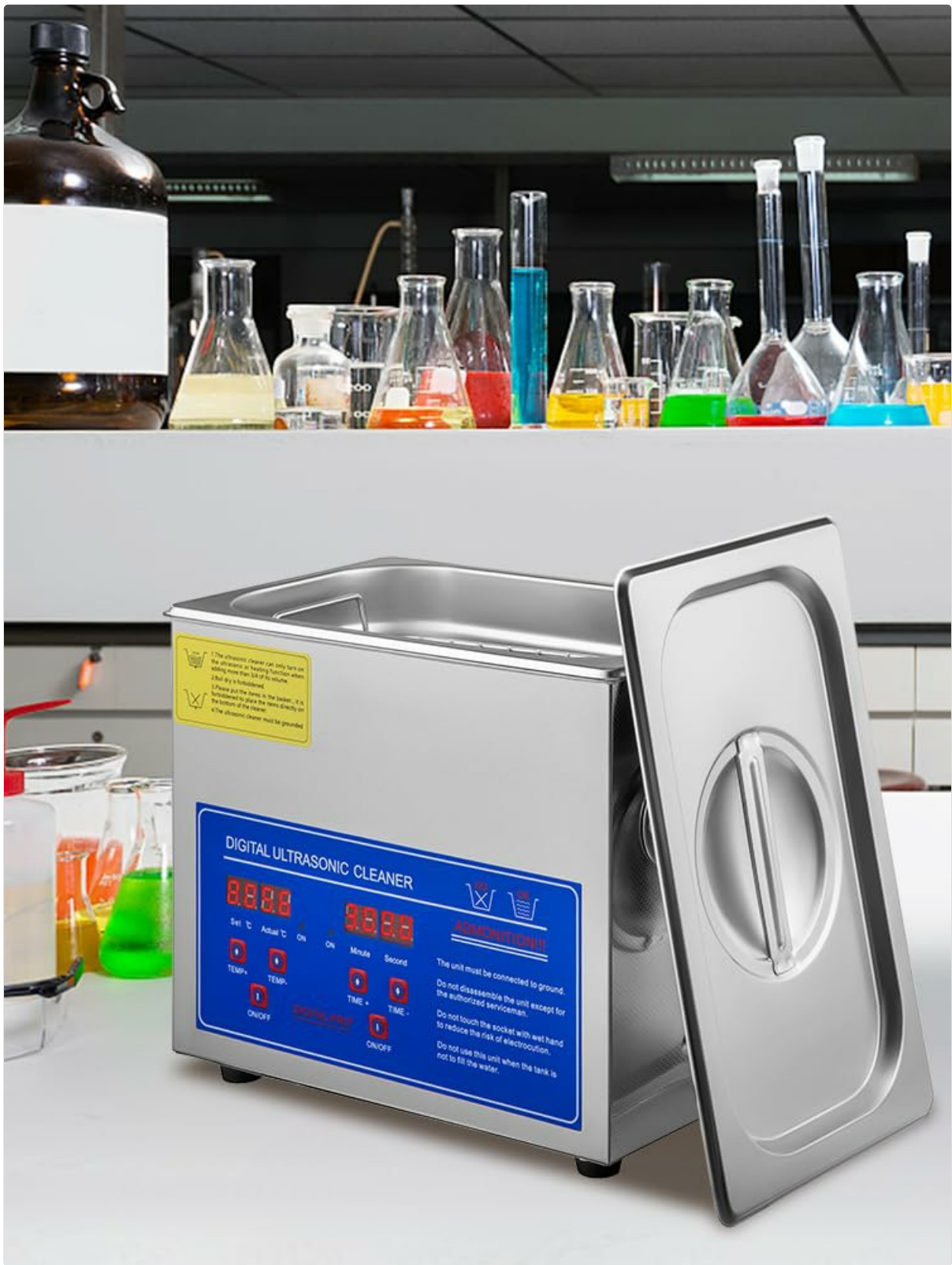
Image: The ultrasonic cleaner with its lid removed, revealing the stainless steel cleaning tank.