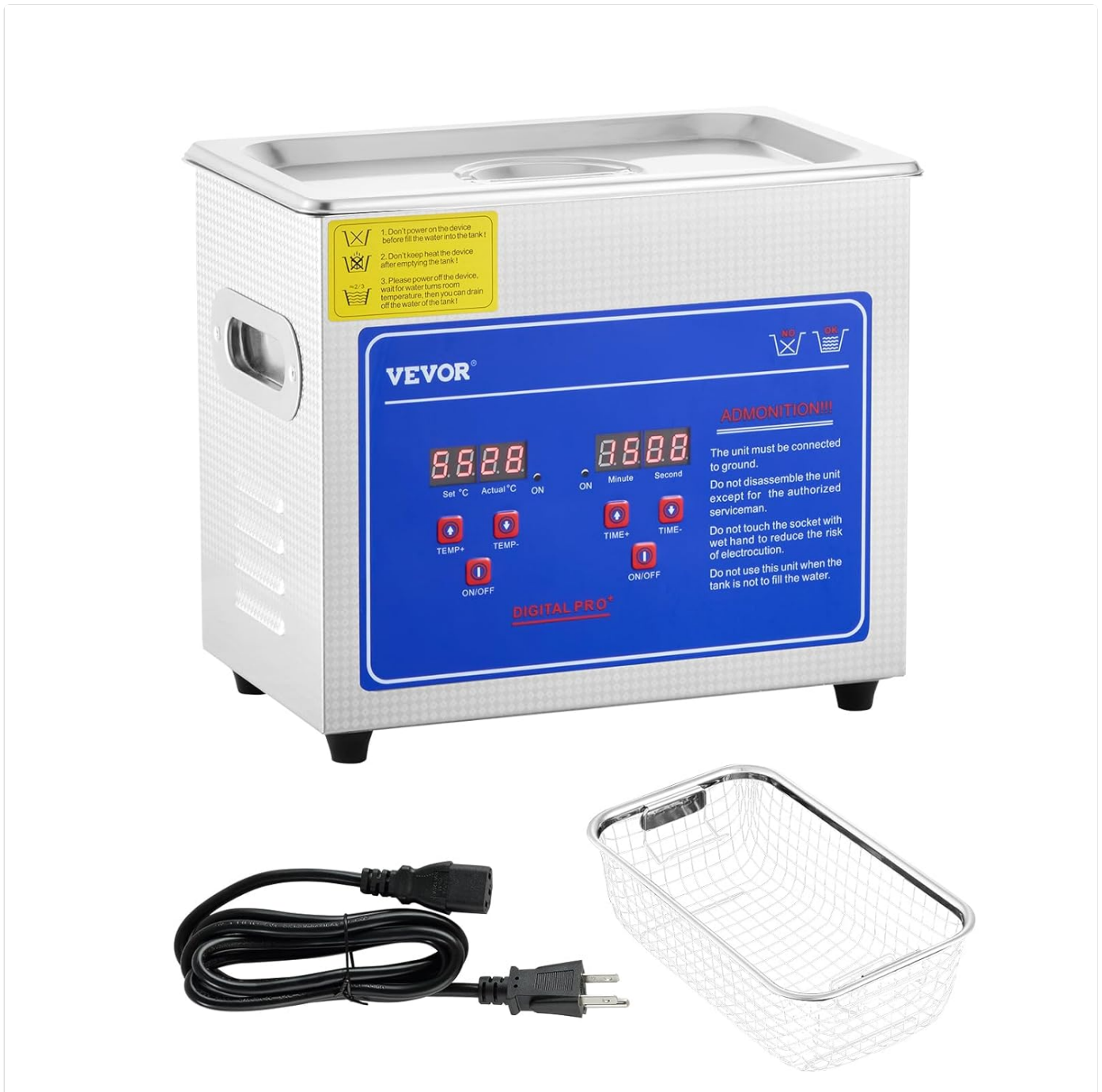
Image: The VEVOR 3L Ultrasonic Cleaner, showcasing its compact design and digital control panel.