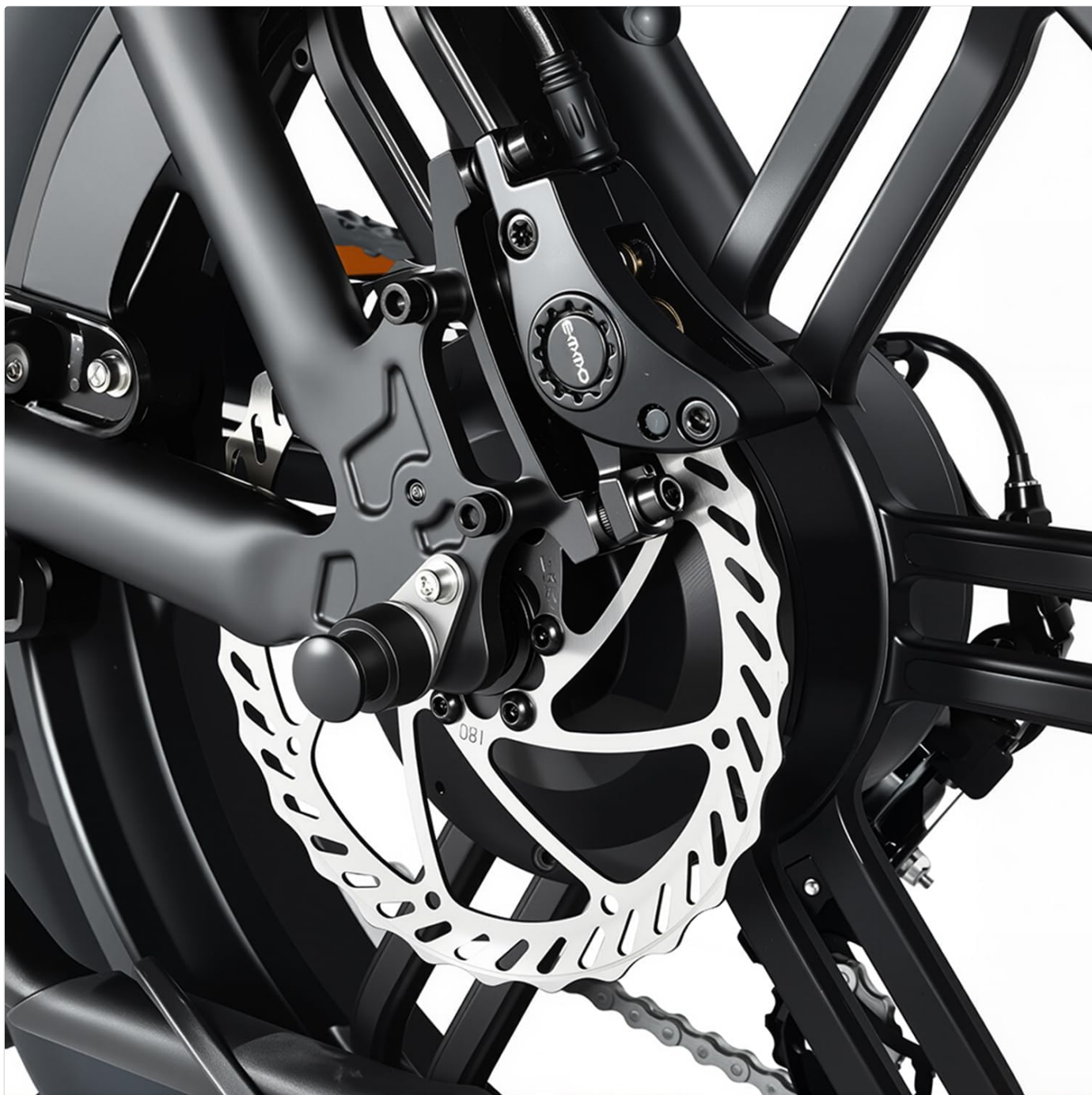
Figure 6: Detail of the rear hydraulic disc brake system, complementing the front for balanced stopping.