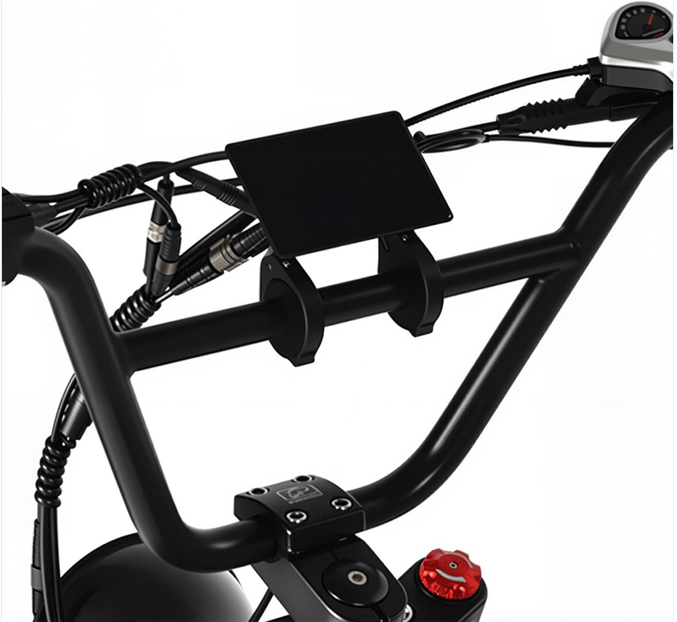
Figure 3: The handlebar assembly, showing the digital display and control buttons.

Familiarize yourself with the controls located on the handlebars.