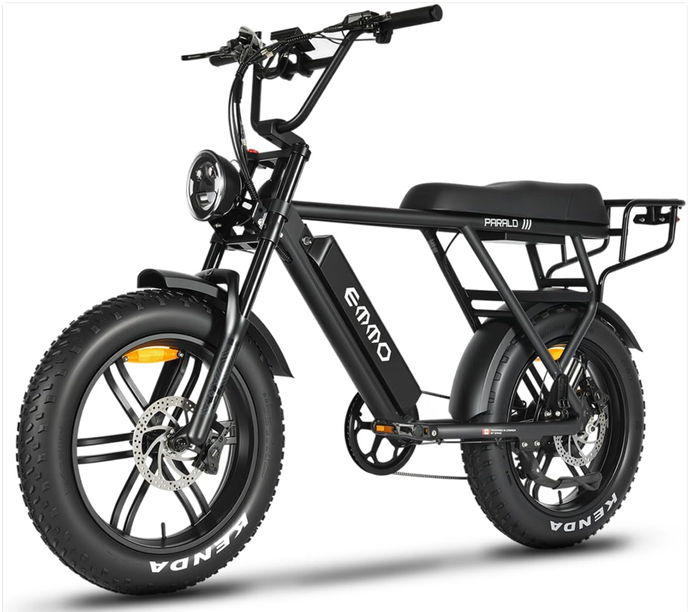
Figure 1: The EMMO Paralo Electric Fat Tire Bicycle, showcasing its robust frame and fat tires.