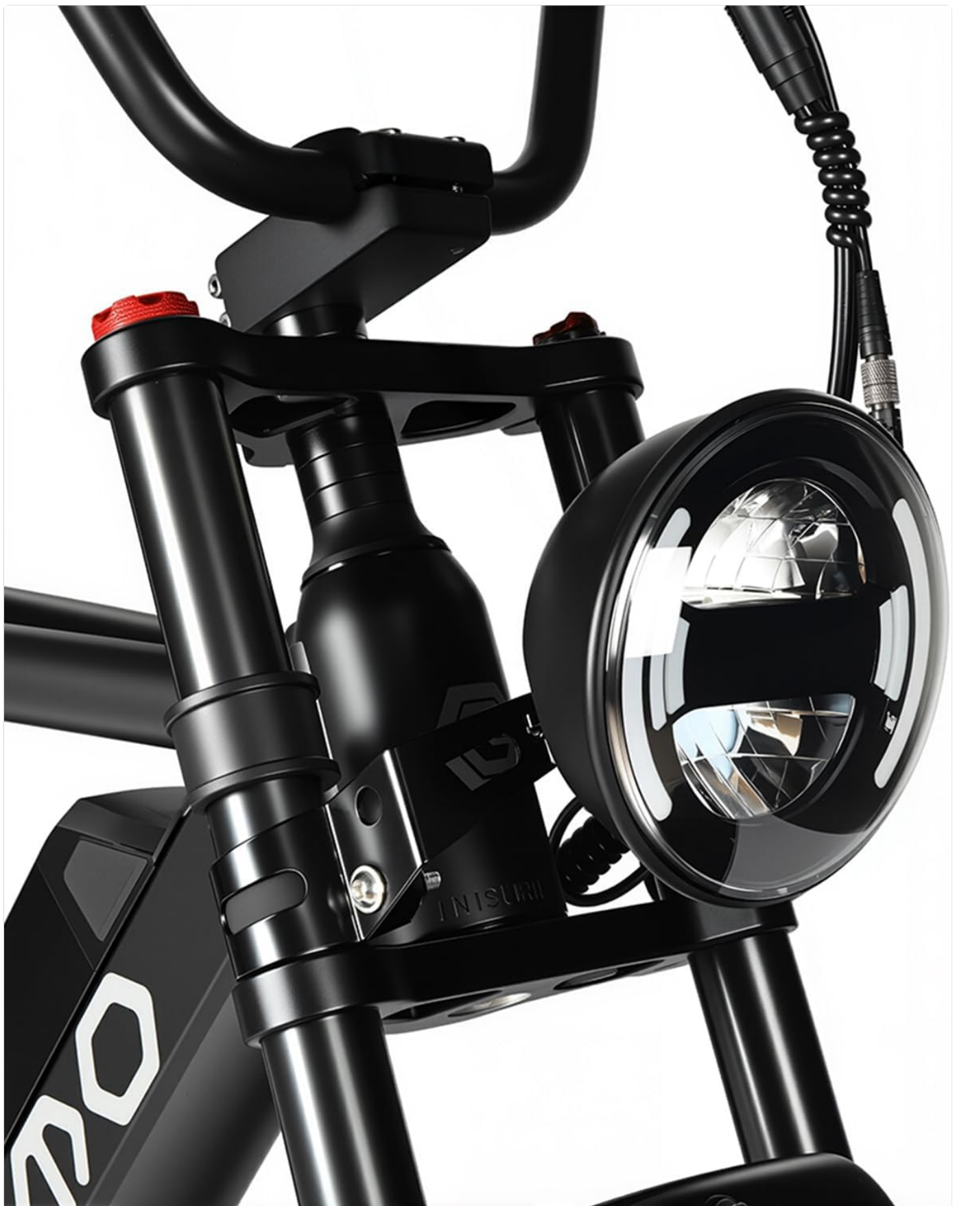
Figure 4: The integrated LED headlight, providing illumination for night riding.