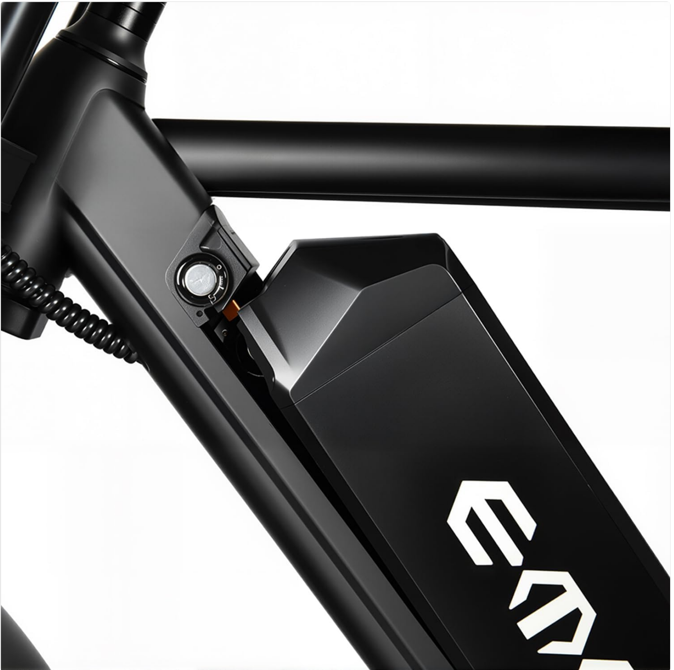
Figure 2: The removable battery pack, designed for easy installation and charging.

The EMMO Paralo features a removable 48V/15.6Ah Lithium battery. Ensure the battery is fully charged before your first ride.