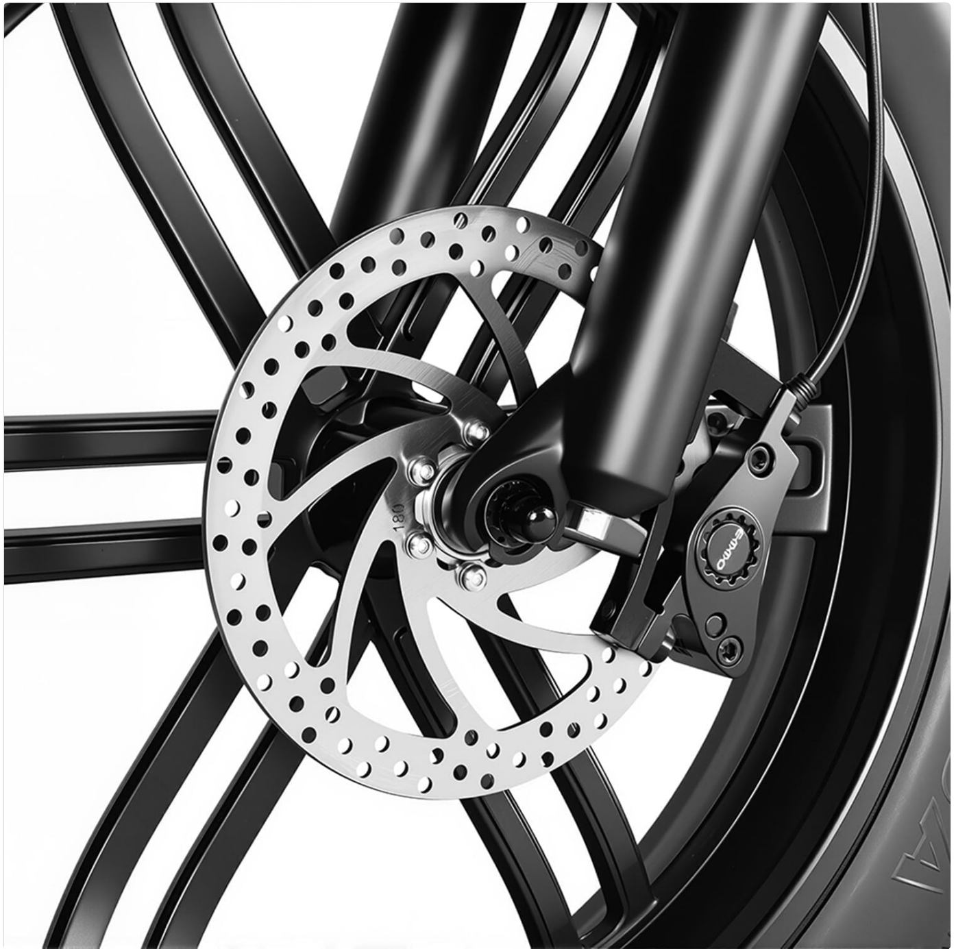
Figure 5: Detail of the front hydraulic disc brake system, ensuring strong and consistent braking performance.

The EMMO Paralo is equipped with dual-piston hydraulic disc brakes for reliable stopping power.