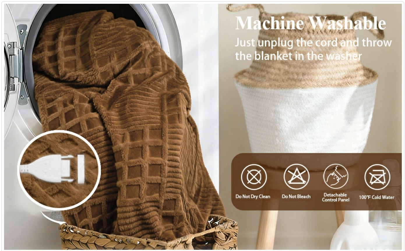
Image: Machine washable instructions, emphasizing detachment of the control panel and cold water wash.