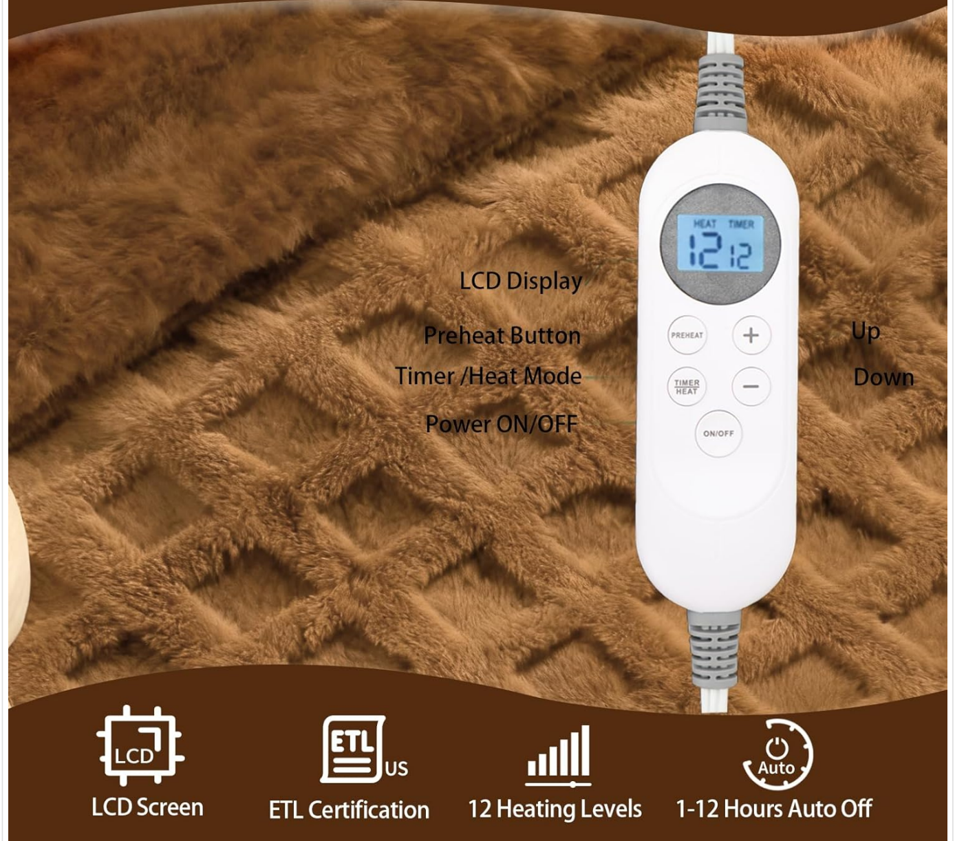
Image: The multi-function digital controller for the heated blanket.