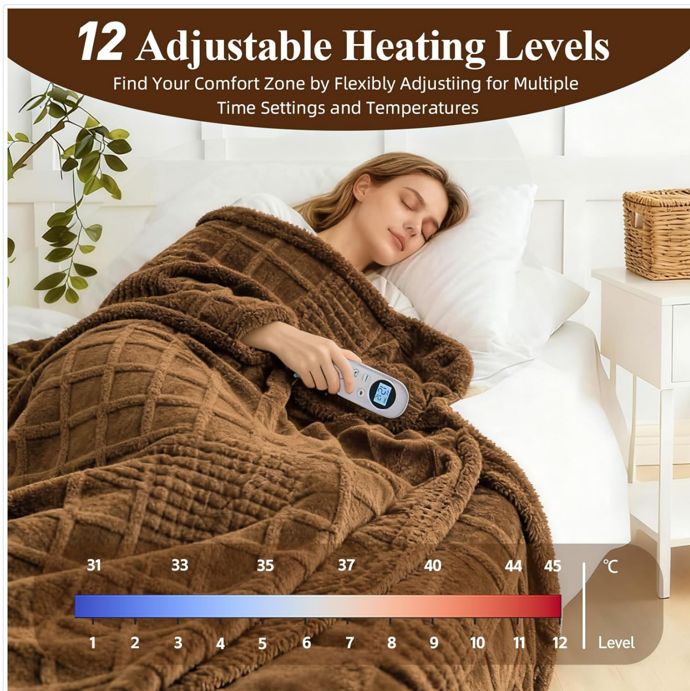
Image: Illustration of 12 adjustable heating levels for personalized comfort.