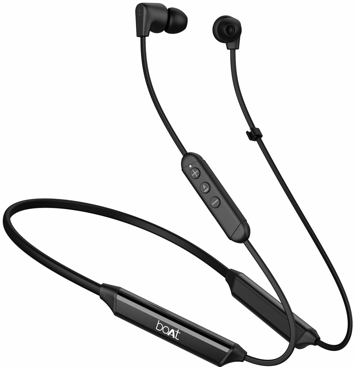
Image: The boAt Rockerz Trinity Gen 2 neckband, illustrating its long battery life with "150 HOURS PLAYBACK" text.