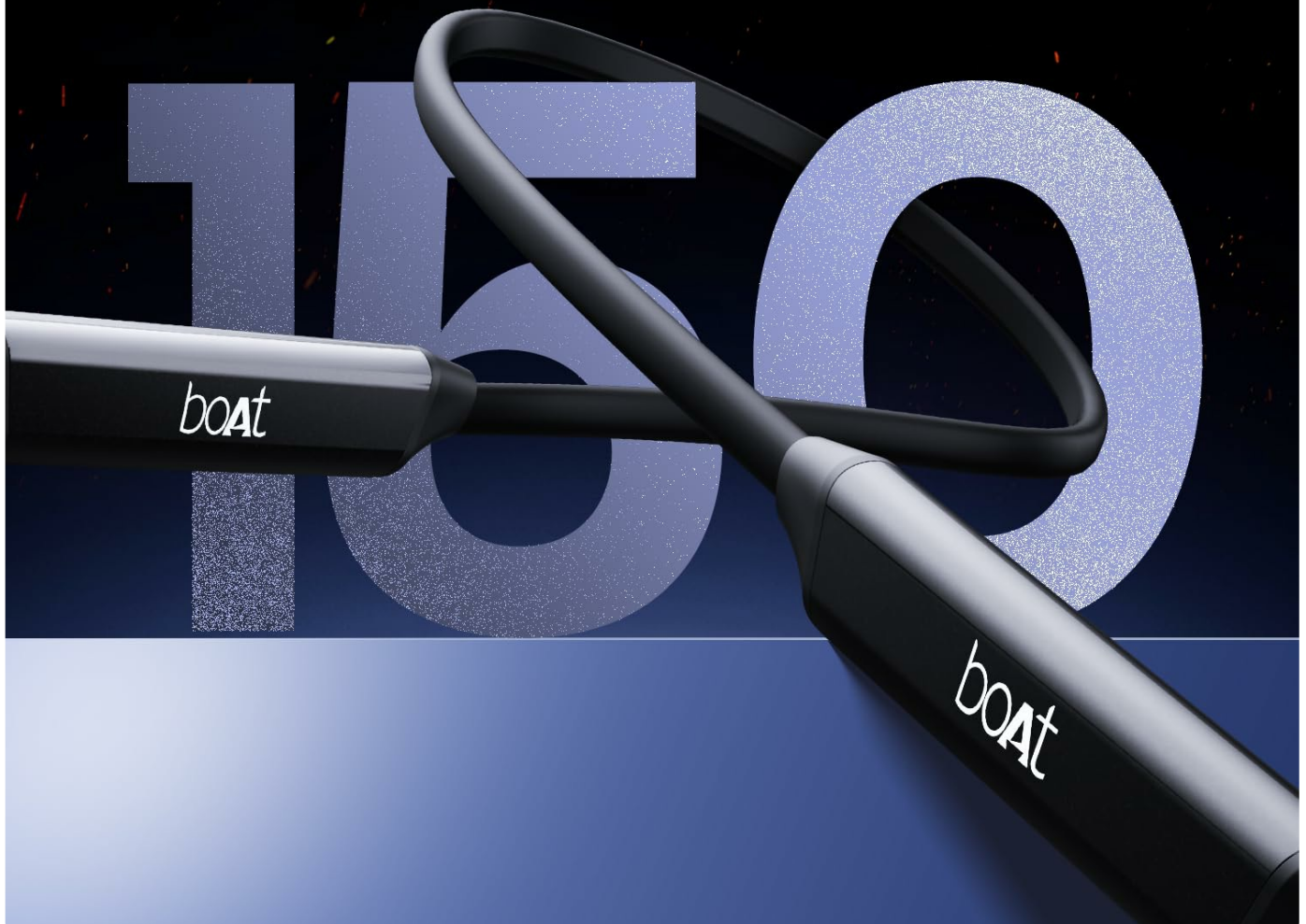
Image: The boAt Rockerz Trinity Gen 2 earbuds with water droplets on them, illustrating their IPX5 water resistance rating.