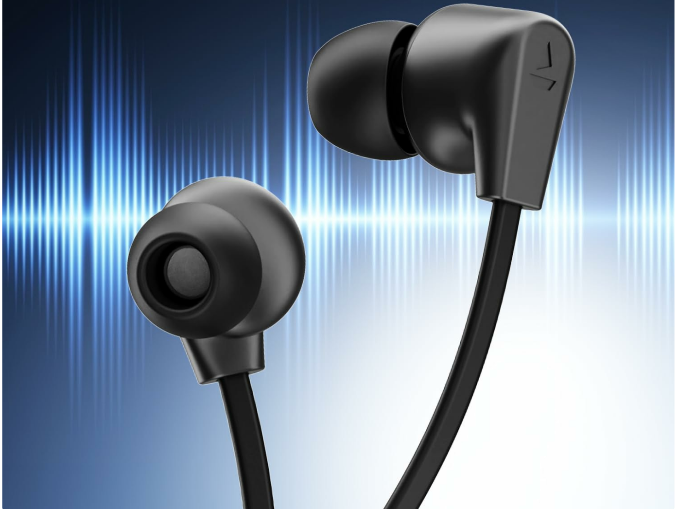
Image: A close-up of a boAt Rockerz Trinity Gen 2 earbud, emphasizing the AI-ENx™ technology for clear voice calls.