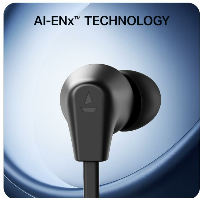
Image: A detailed view of the boAt Rockerz Trinity Gen 2 earbuds and the inline control panel, showing buttons for volume and playback.