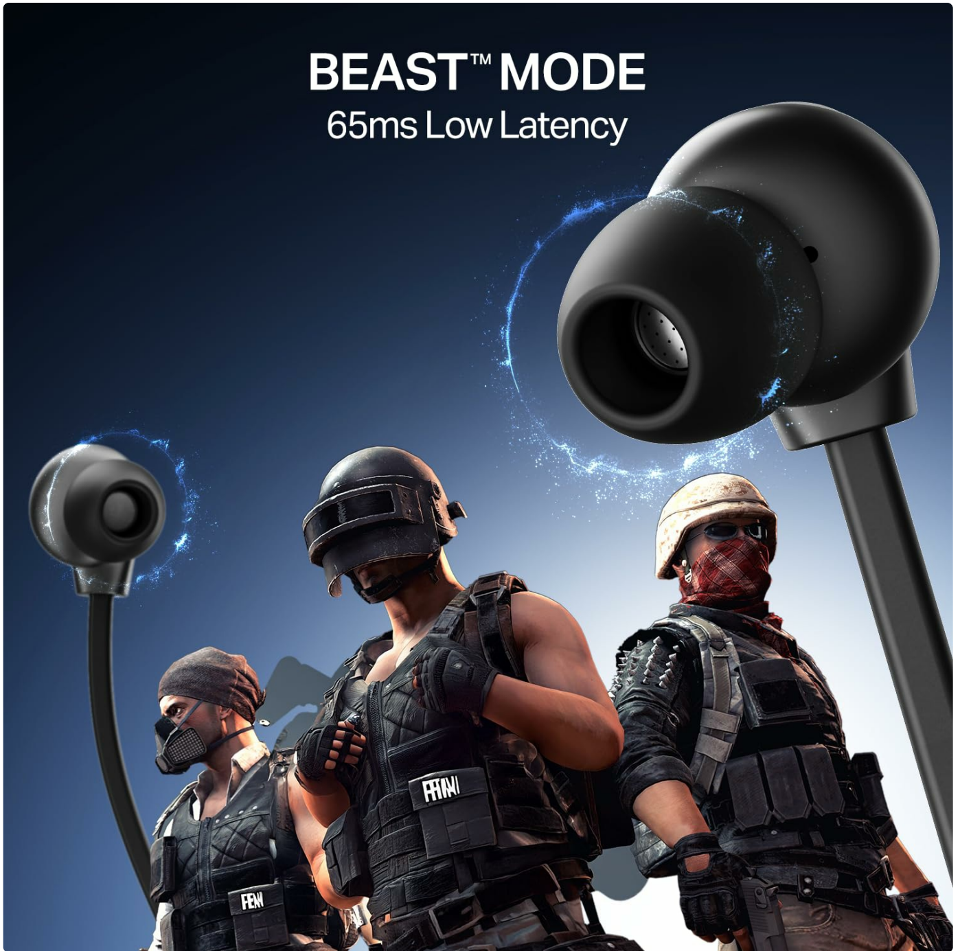
Image: A close-up of the boAt Rockerz Trinity Gen 2 earbuds, highlighting the availability of dual EQ modes for sound customization.

cycle through available EQ presets. This allows you to adjust the sound profile to your preference.