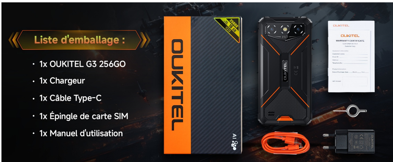
Image: Contents of the OUKITEL G3 retail package, including the smartphone, charger, Type-C cable, SIM ejector pin, and user manual.