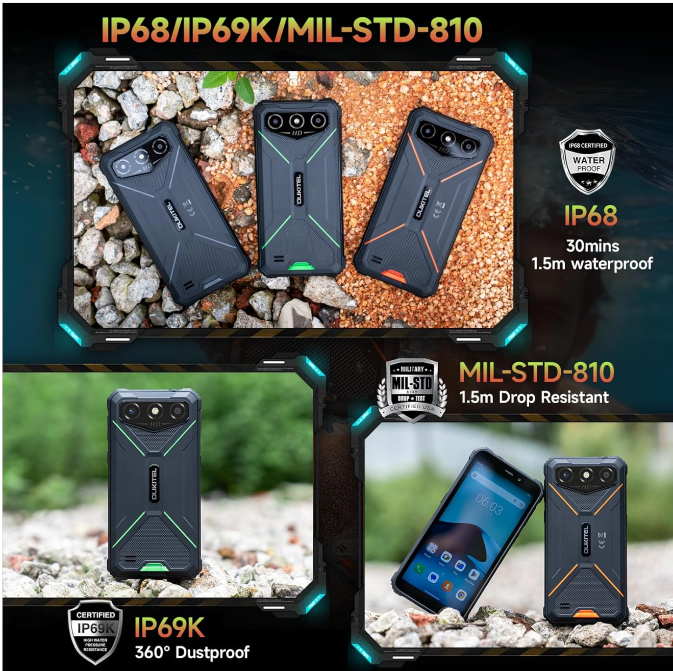
Image: The OUKITEL G3 smartphone displayed in various rugged environments, highlighting its IP68 water resistance, IP69K dust resistance, and MIL-STD-810H drop resistance certifications.