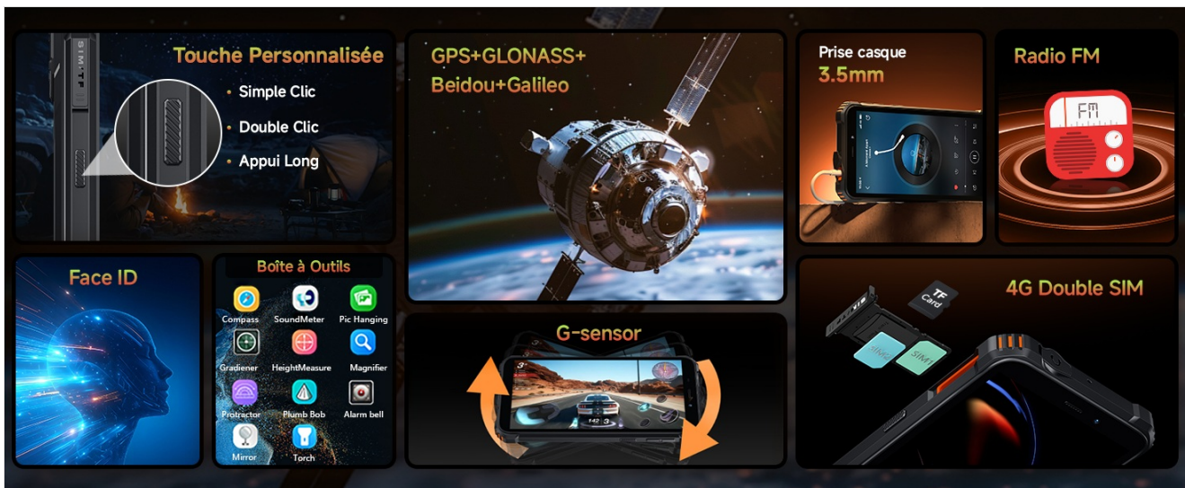
Image: An illustration detailing the OUKITEL G3's custom key functionality, Face ID, GPS navigation, and built-in toolbox applications.