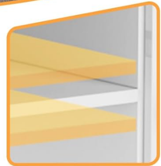
Position Adjustable Shelf

Image: A close-up showing the functional elements of the TV stand: the sliding barn door mechanism, a built-in power strip with AC outlets and USB ports on the top surface, and the three-position adjustable shelves within the side compartments.