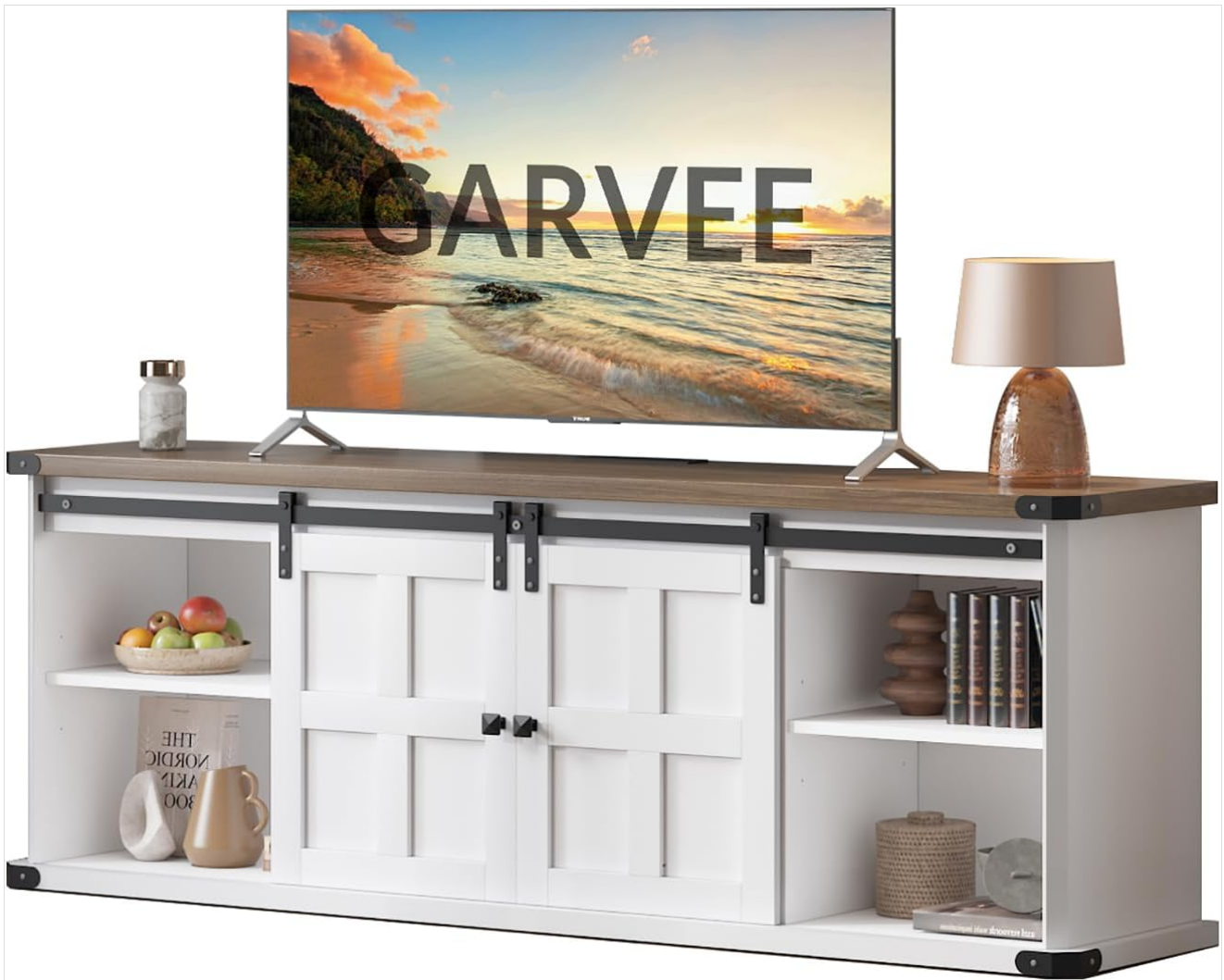
Image: The Garvee 70-inch Farmhouse TV Stand, white with a coffee-colored top, featuring sliding barn doors, shown in a living room with a television placed on it.