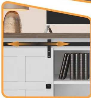
Sliding Bin Door Design