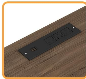
Built-in 2 AC Sockets 2 USB Ports