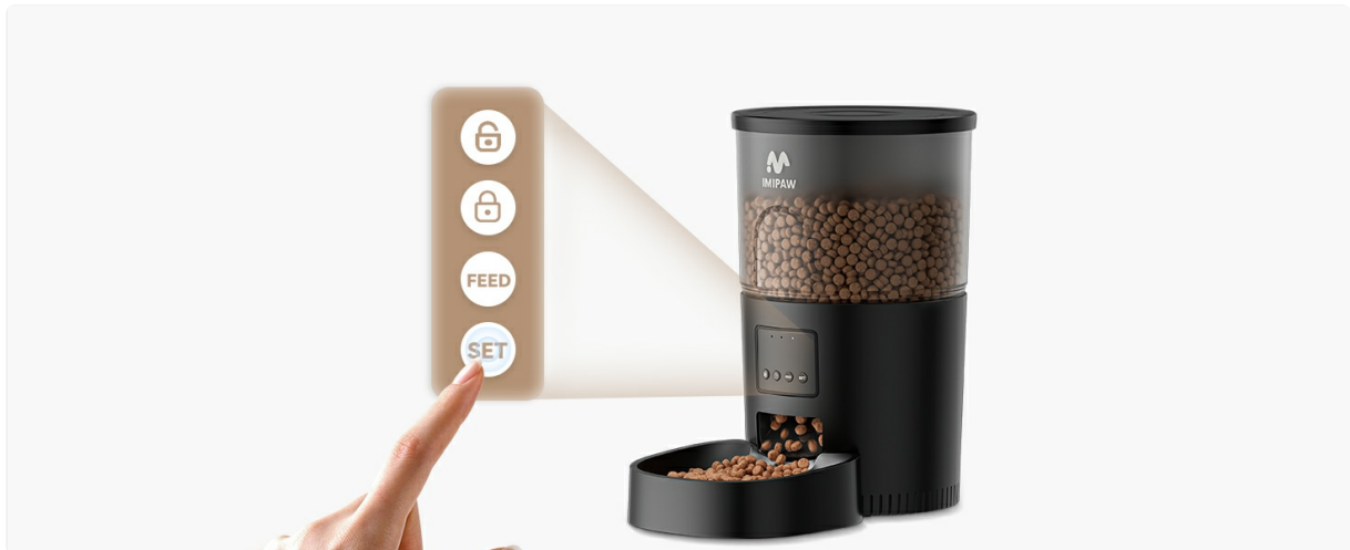
Image: Features of the feeder including the security lock, anti-slip bottom, and durable nylon braided power cable.