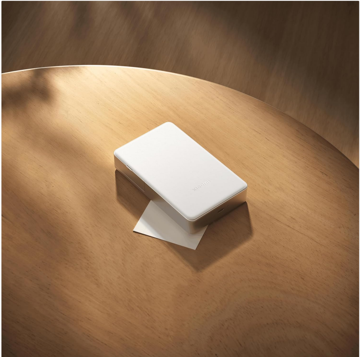
Image 3.1: The Xiaomi Portable Photo Printer Pro positioned on a wooden table, actively printing a photo, with the printed image emerging from the top slot.