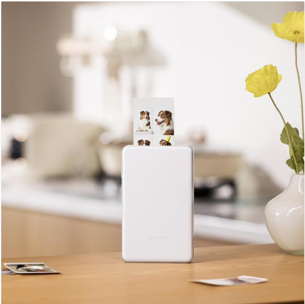
Image 2.1: The Xiaomi Portable Photo Printer Pro with photo paper being inserted into the paper tray, demonstrating the correct orientation.