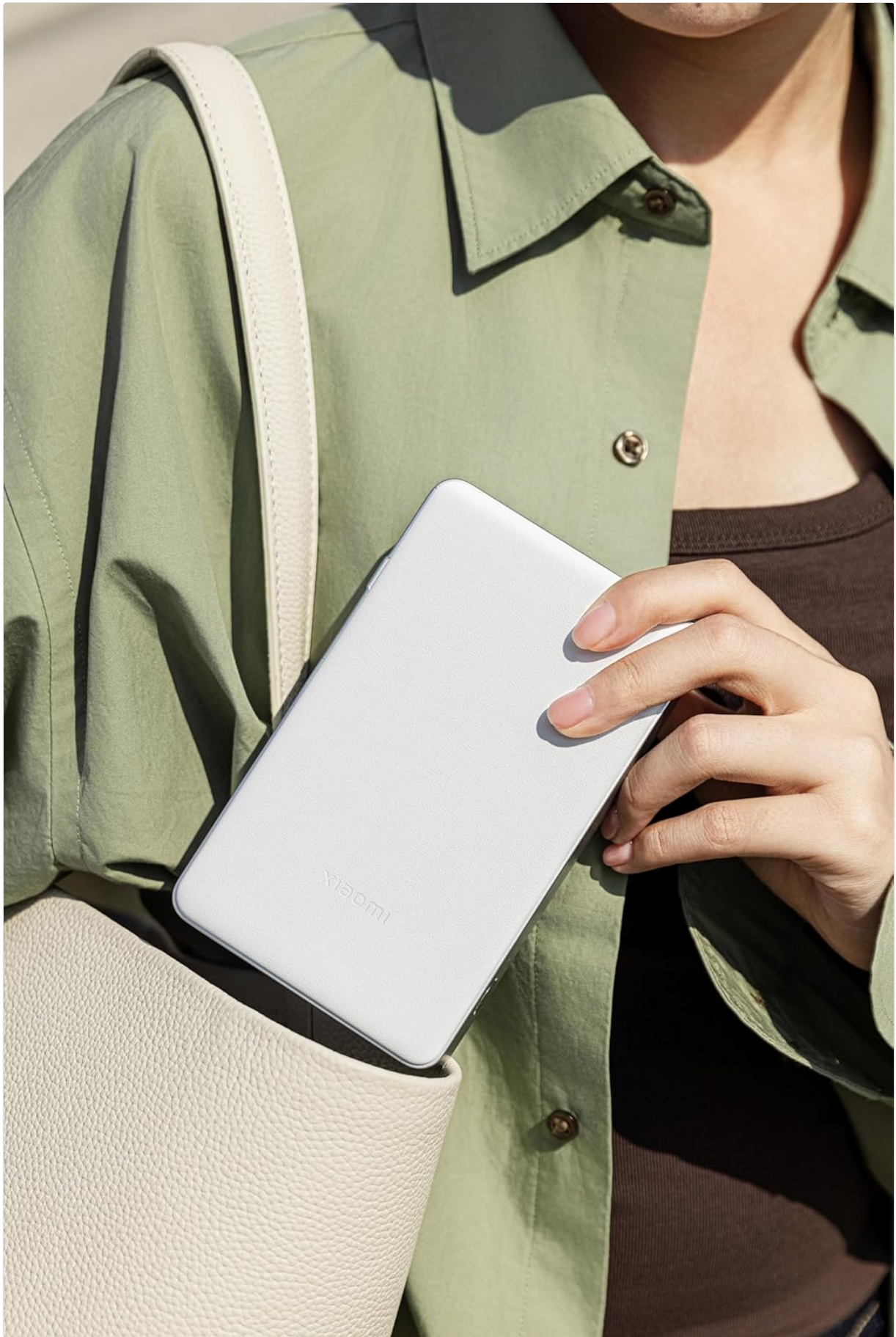
Image 3.2: The Xiaomi Portable Photo Printer Pro being held in a hand, illustrating its portability and ease of handling for on-the-go printing.