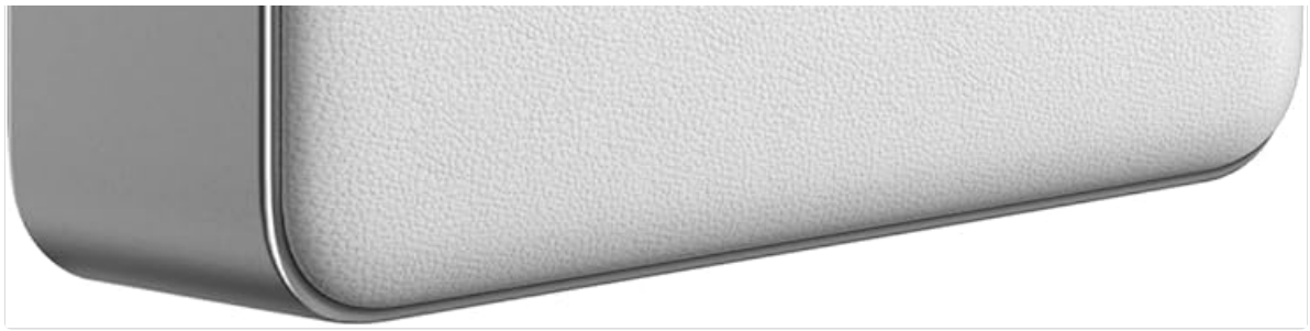
Image 1.2: Side view of the Xiaomi Portable Photo Printer Pro, highlighting its slim profile and power button location.