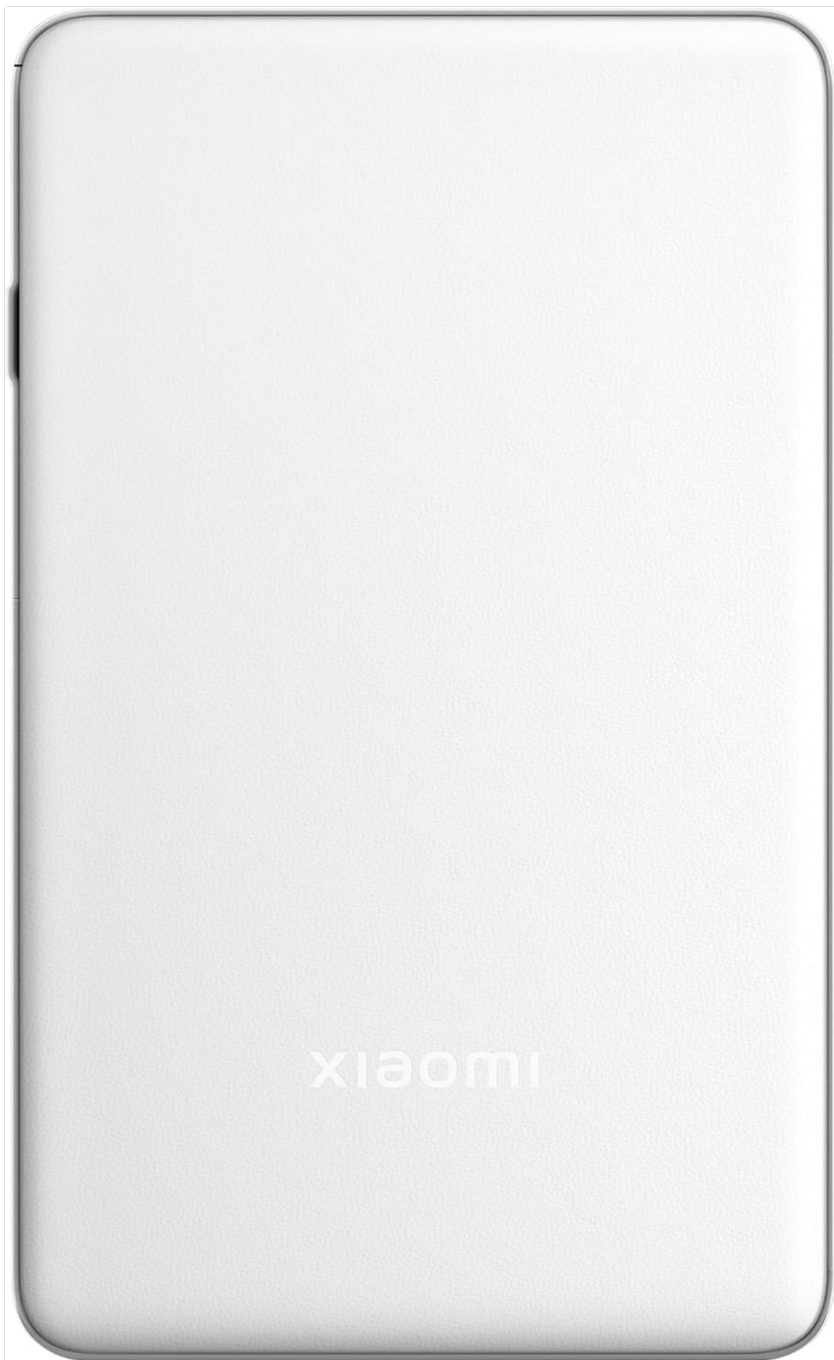
Image 1.1: Top view of the Xiaomi Portable Photo Printer Pro, showcasing its minimalist design and compact form factor.