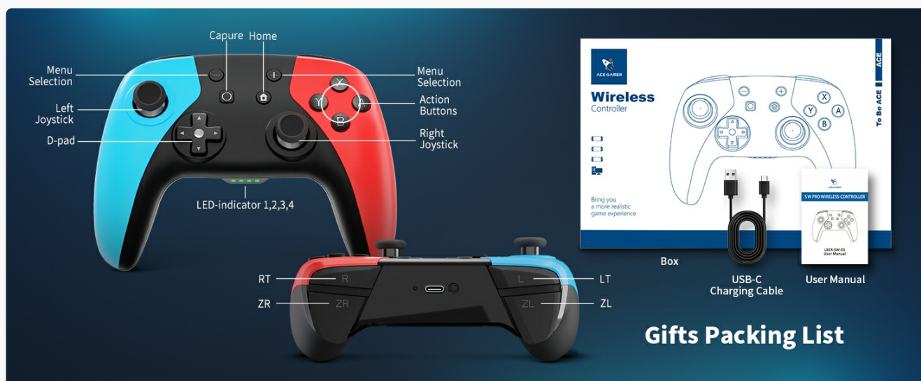
Image: The controller with the 'Home' button indicated for waking up the console.

After the initial connection, simply press the HOME button on the controller to wake up your Nintendo Switch device. (Note: This feature is not supported for Switch 2 console wake-up).