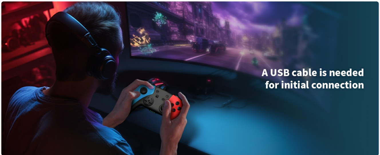
Image: Visual representation of the controller's 4-level vibration and 6-axis gyro sensor capabilities in action during gameplay.