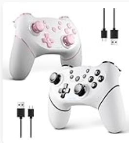
Image: The AceGamer Wireless Controller, USB-C charging cable, and user manual as included in the package.