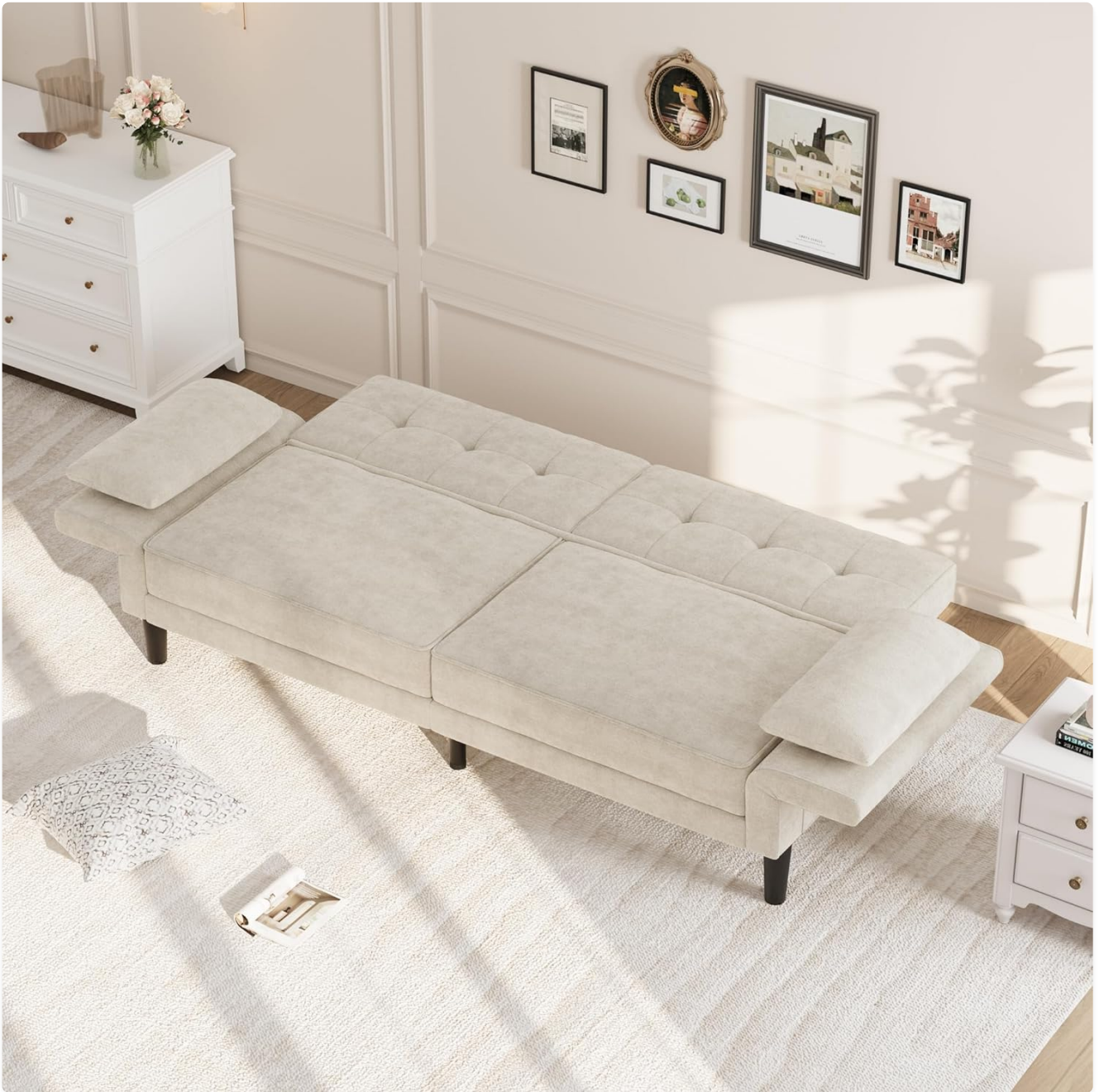
Image: An aerial view of the Garvee Futon Sofa Bed fully converted into a flat bed, showcasing its extended sleeping surface suitable for a bedroom or guest room.