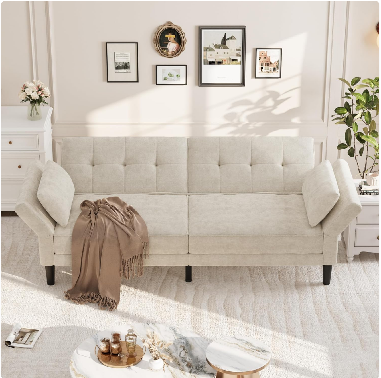
Image: The Garvee 89-inch Chenille Futon Sofa Bed in beige, presented as a sofa in a living room setting. It features a tufted backrest and two matching pillows.