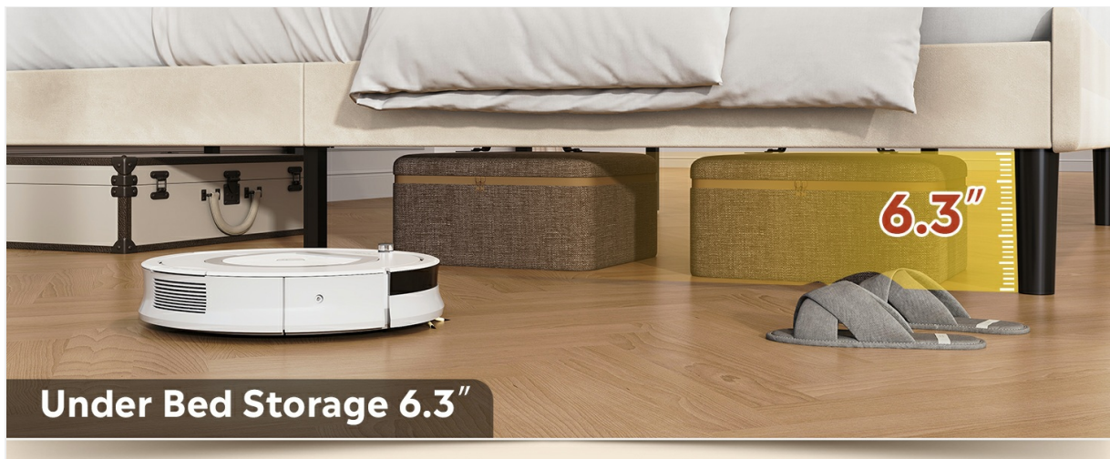
Image 4: Illustration of the 6.3-inch under-bed clearance, demonstrating space for a robotic vacuum and storage.

Video 2: WLIVE Upholstered Bed Frame with Headboard. This video highlights the key features and design aspects of the bed frame.