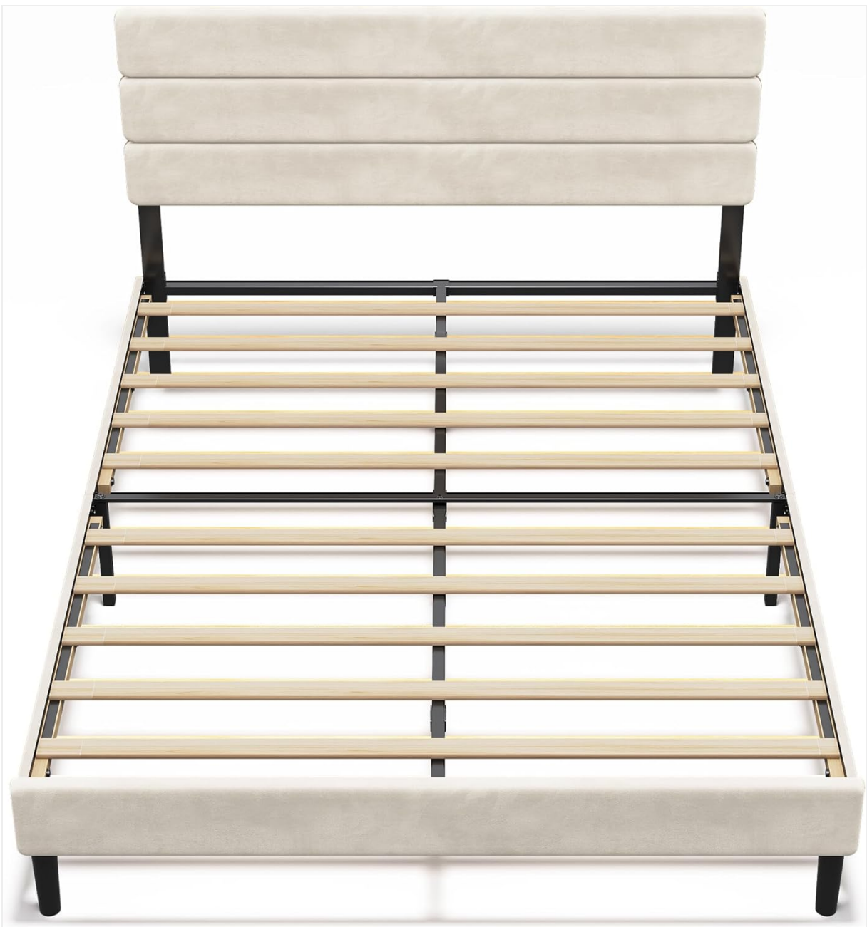
Image 3: Top-down view of the bed frame showcasing the sturdy wooden slats that support the mattress.