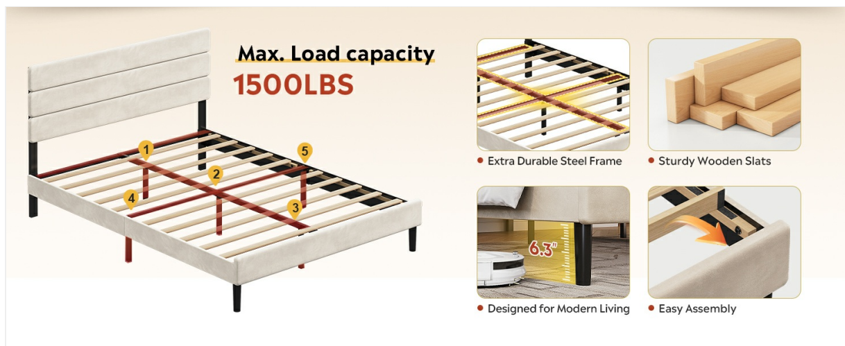
Image 2: An exploded view of the bed frame components, highlighting the steel frame, wooden slats, and assembly points.