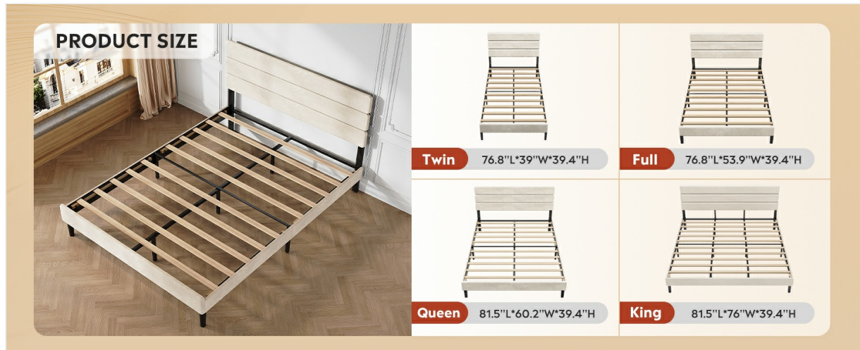
Image 5: Size chart illustrating dimensions for Twin, Full, Queen, and King bed frames.