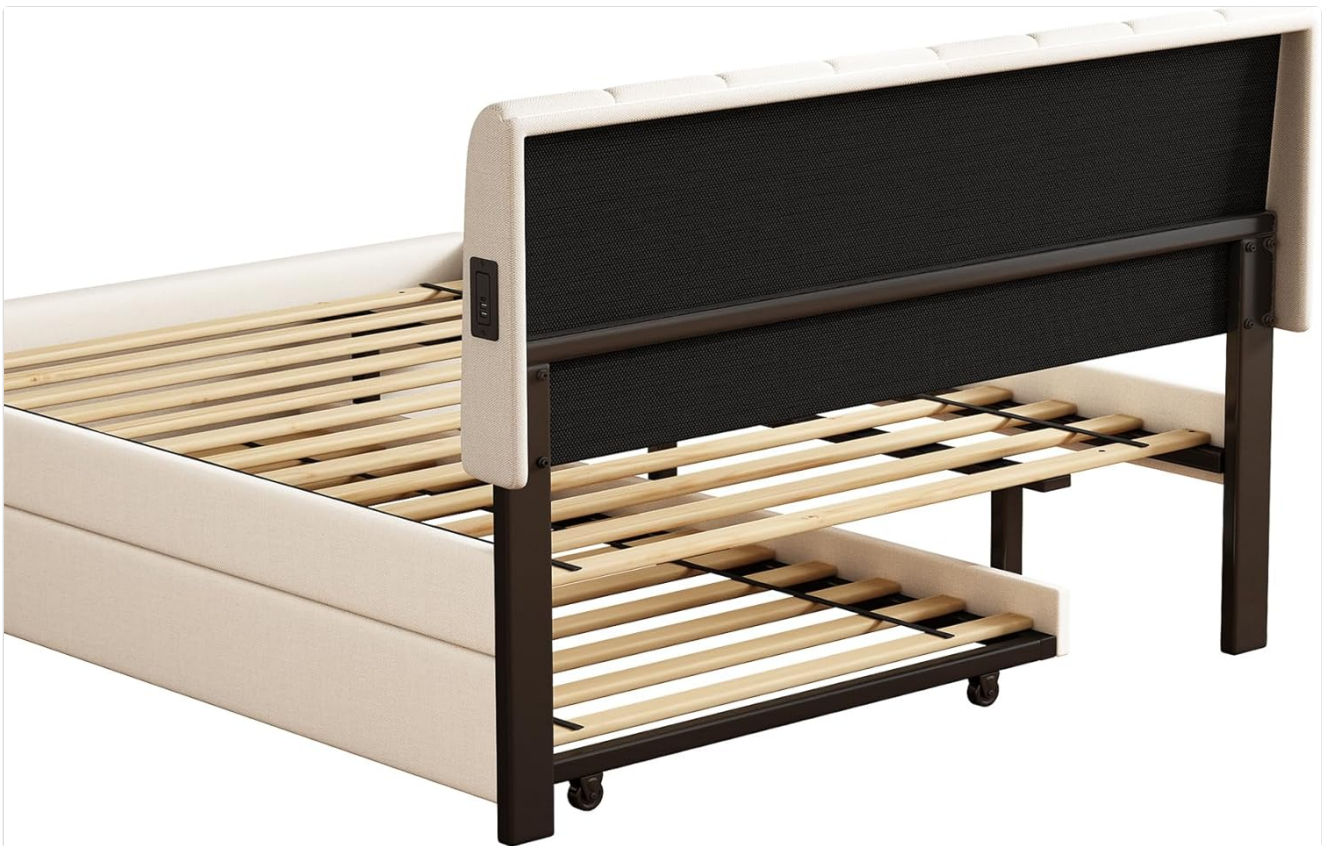
Figure 3: This image highlights the charging station located on the side of the headboard, featuring two standard outlets, one USB port, and one Type-C port for convenient device charging.