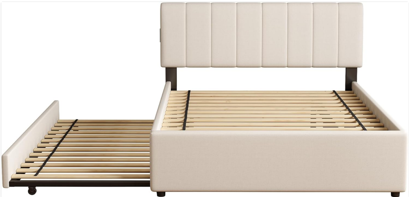
Figure 4: This image demonstrates the trundle bed in its fully extended position, ready for use as an additional sleeping surface.