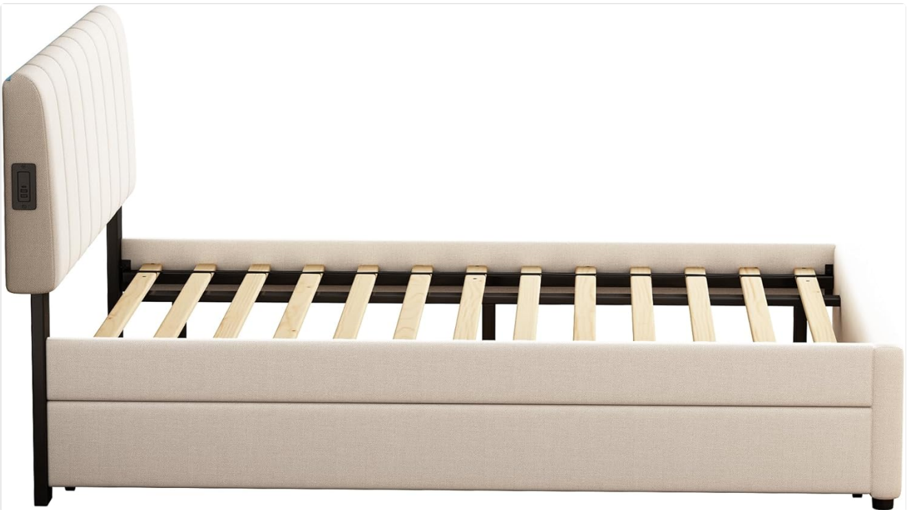
Figure 2: A side profile of the bed frame, illustrating the robust wooden slat system and metal keel designed for mattress support and durability.