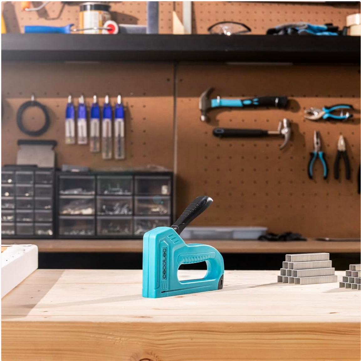
Image 4.2: The Cecotec FastTacker Manual Stapler with a strip of staples visible in its magazine, ready for use.