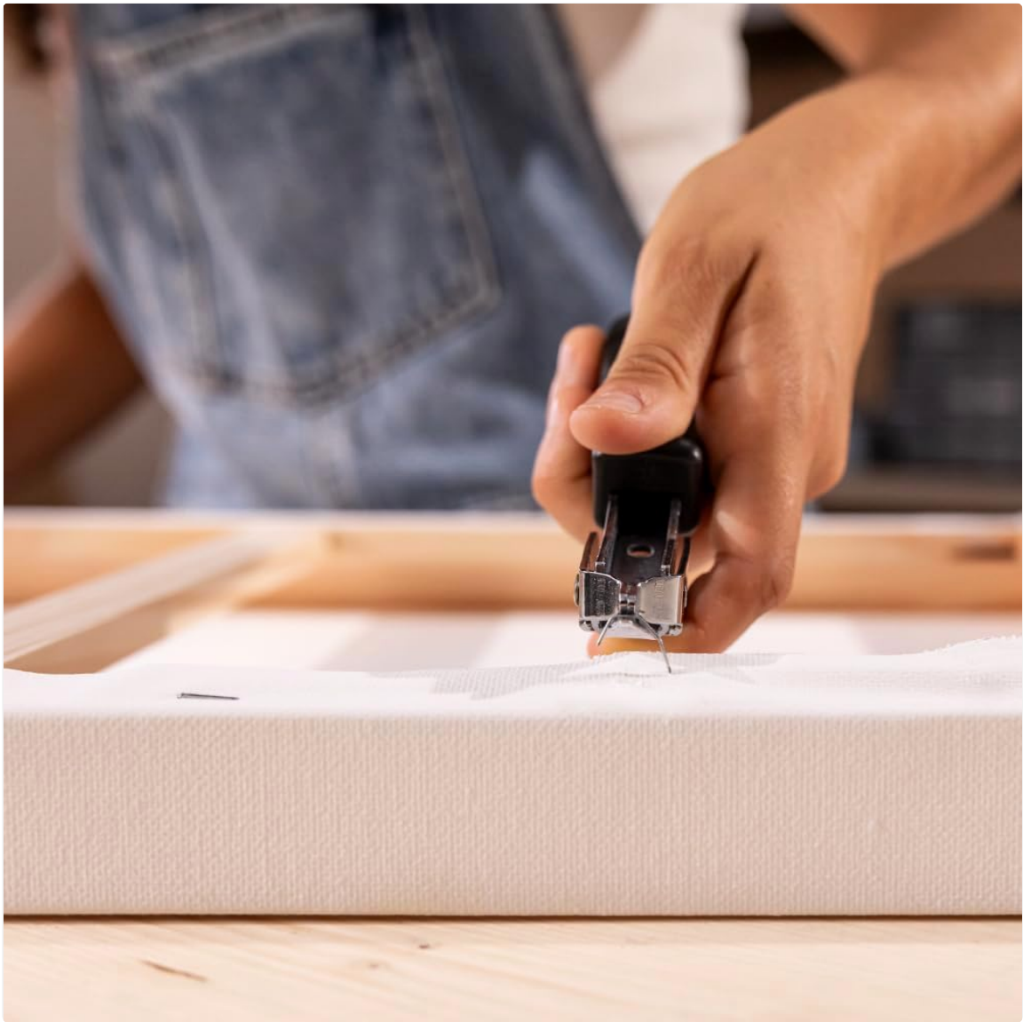
Image 5.1: A user operating the Cecotec FastTacker Manual Stapler to secure fabric onto a wooden frame, demonstrating its application in upholstery or DIY projects.