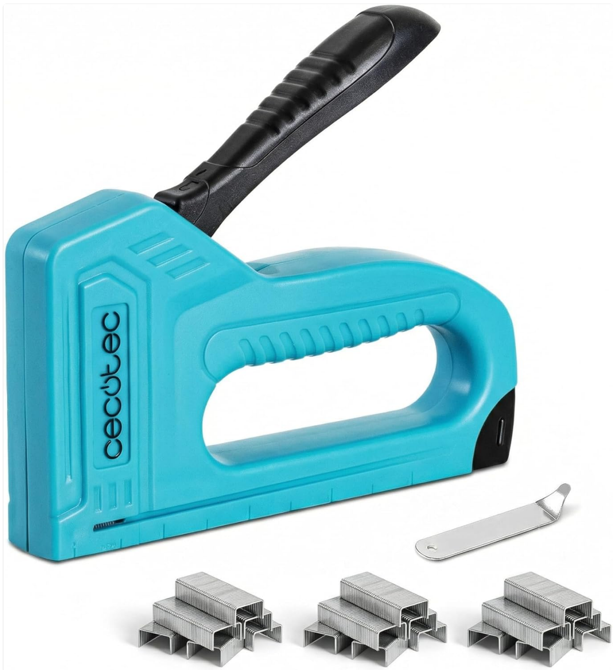
Image 1.1: The Cecotec FastTacker Manual Stapler positioned on a workbench, surrounded by various tools and stacks of staples, illustrating its intended use in a practical environment.