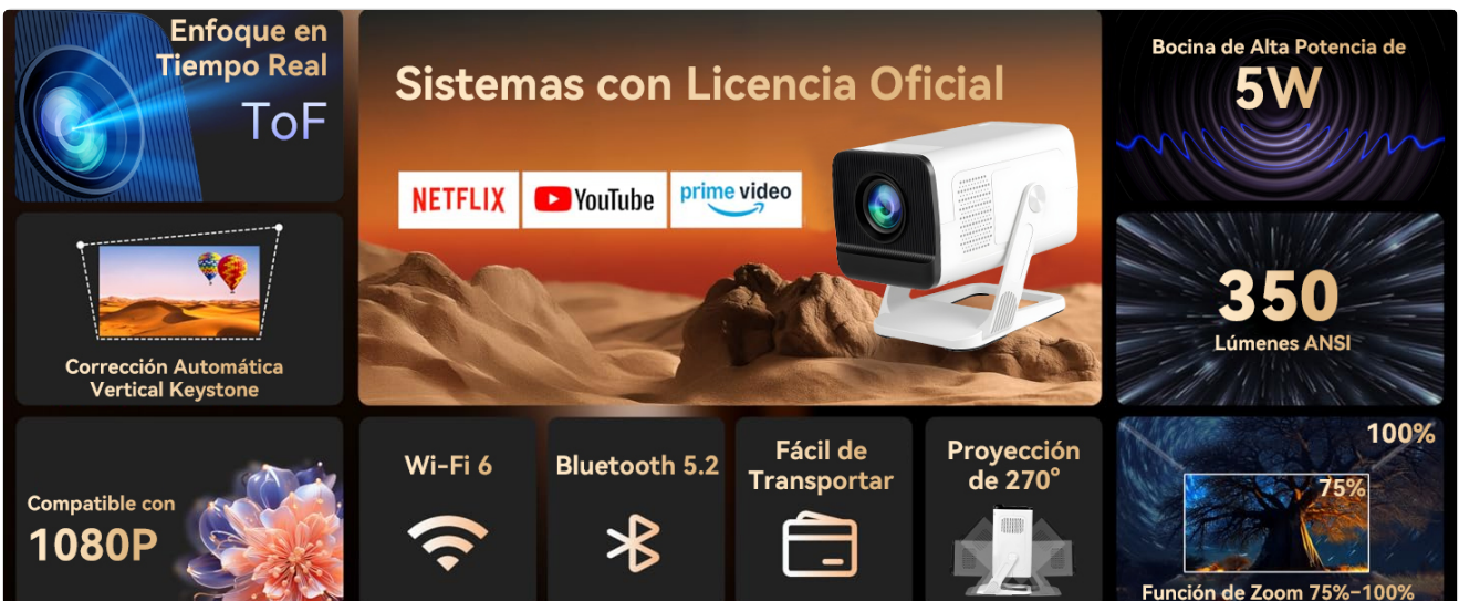
Image: The projector's smart interface with various streaming applications.

Use the included remote control to navigate the projector's smart interface. The Air Remote function allows for intuitive control by moving your wrist.