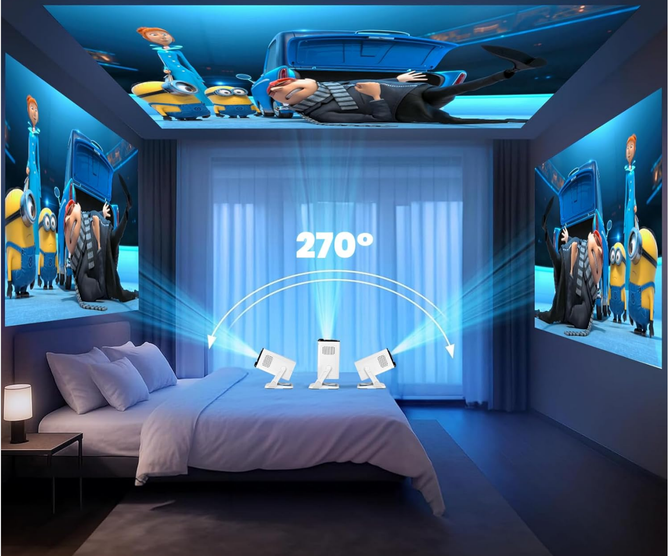
Image: Example of the projector being used to display content on a bedroom ceiling.

¡Solo inclínalo y proyecta — tu techo se convierte en una pantalla inmersiva!