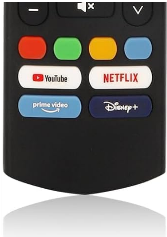
Figure 4.1: Front view of the vSeeBox Bluetooth Voice Remote Control.