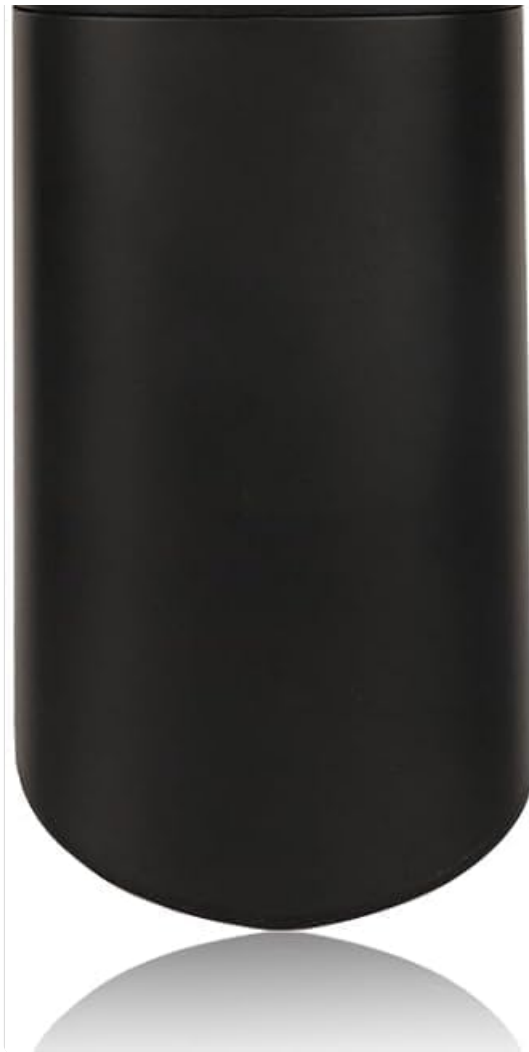
Figure 5.1: Back view of the vSeeBox Bluetooth Voice Remote Control with IR learning instructions.