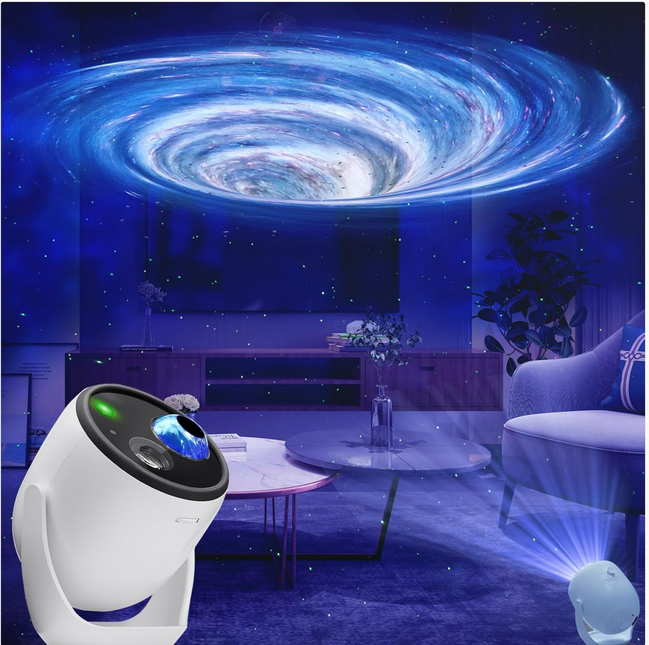
Image 1.1: The MHAZDZE 3D Galaxy Projector in a living room setting, projecting a vibrant galaxy scene.