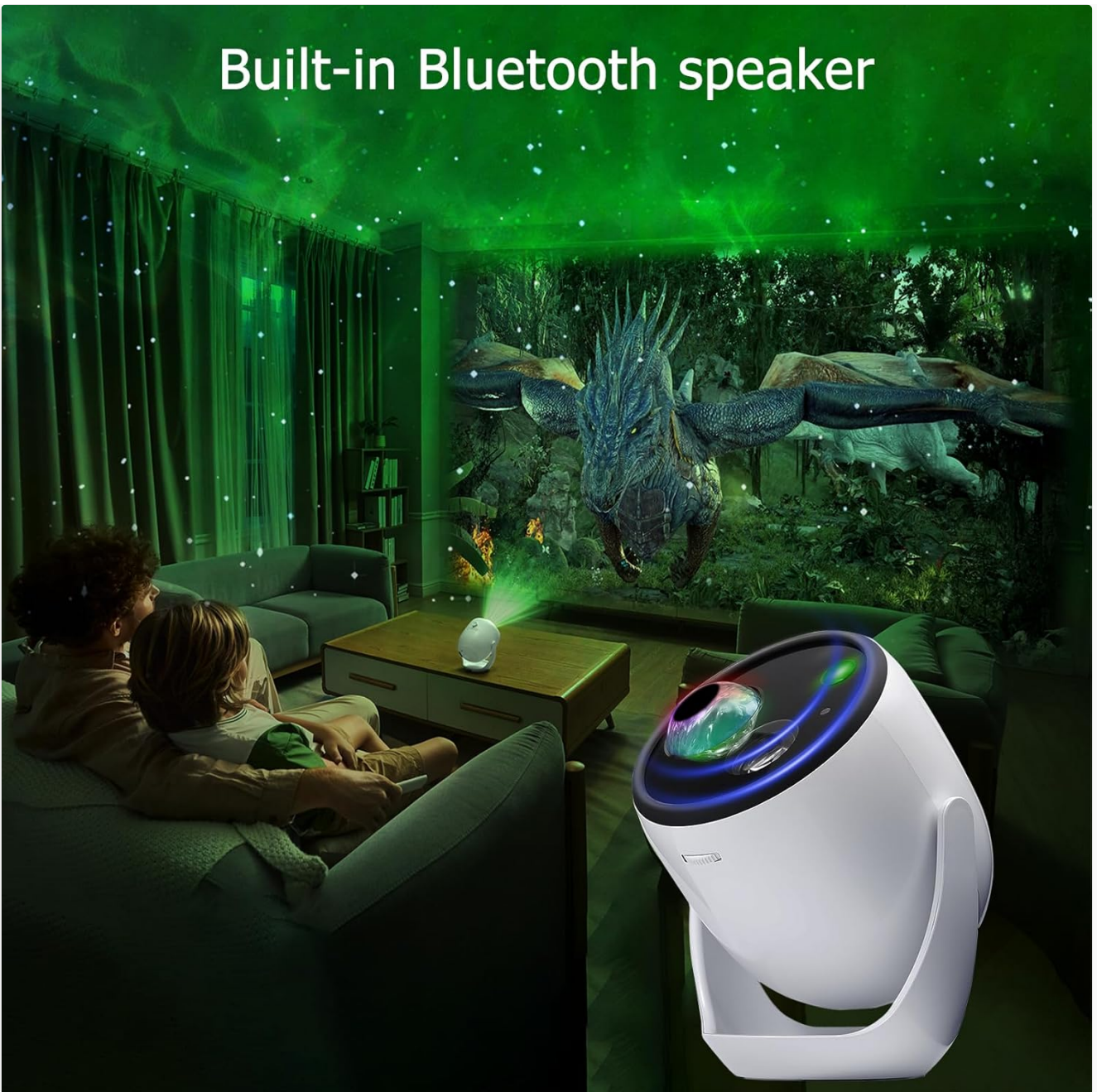
Image 6.3: The projector's built-in Bluetooth speaker enhances the immersive experience.