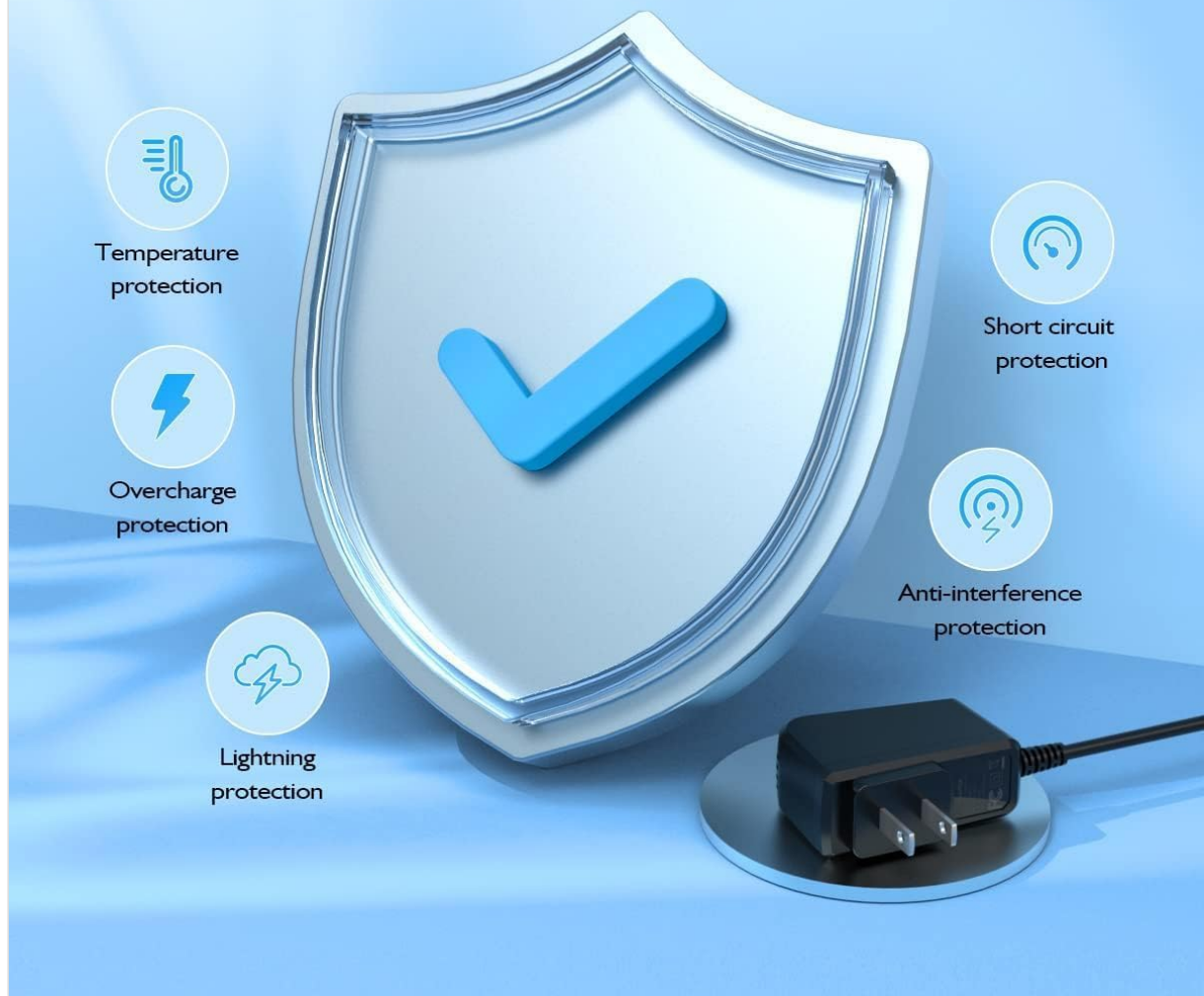
Image: This diagram illustrates the multiple protection features integrated into the eeTao charger, ensuring safe and reliable charging. These include temperature protection, overcharge protection, short circuit protection, anti-interference protection, and lightning protection.

Multiple professional protection, so that fast charge more safe