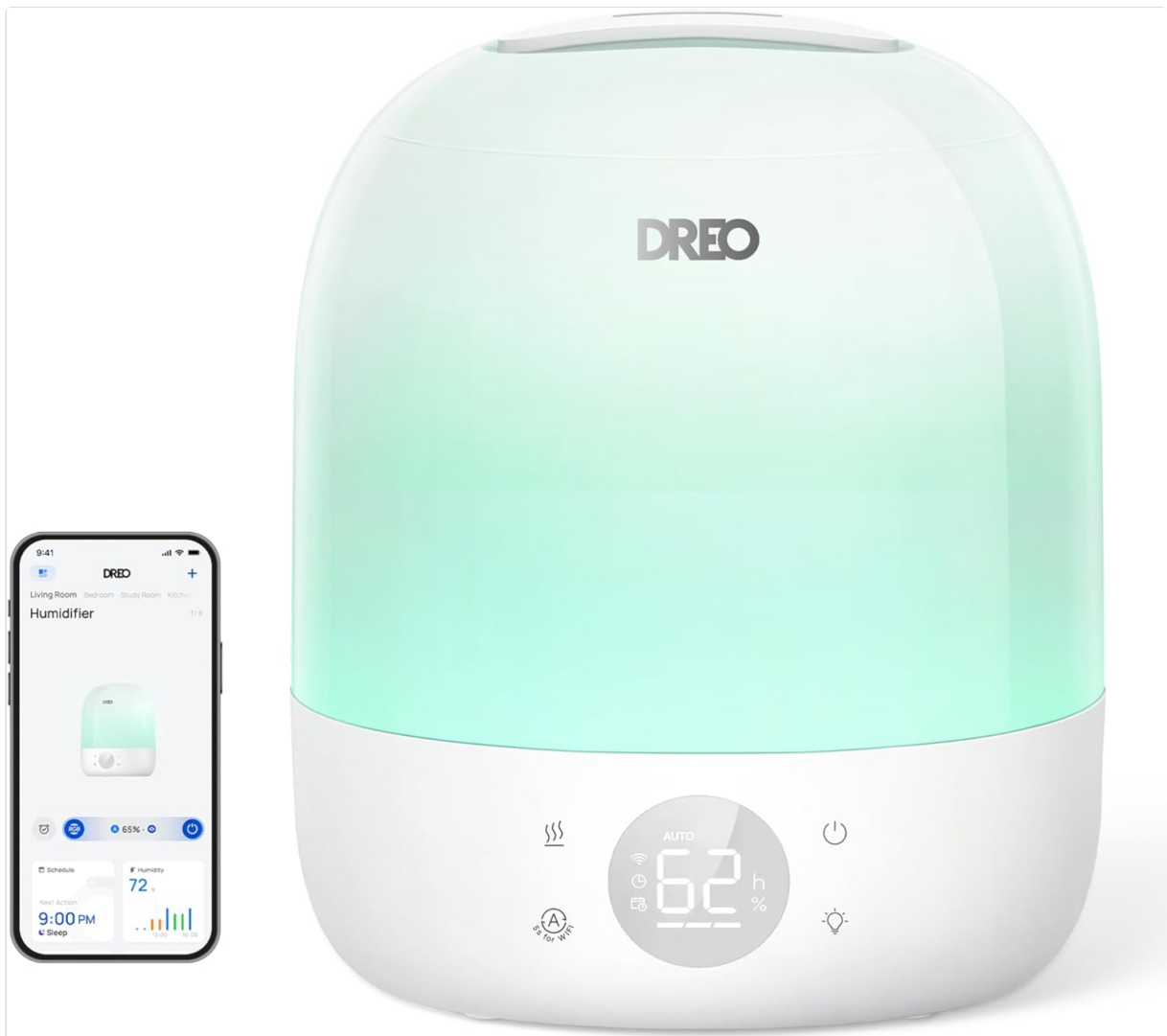
Image: The DREO HM409S humidifier shown next to a smartphone displaying its control app. The humidifier features a translucent top section that glows with an RGB light, a digital display showing humidity, and touch controls.