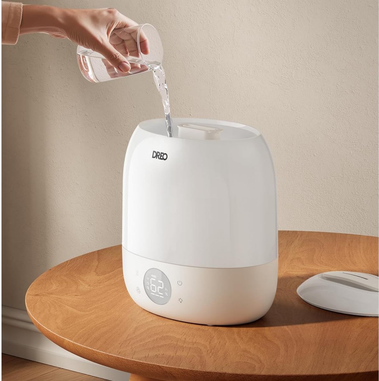
Image: A hand pouring water directly into the top opening of the DREO HM409S humidifier, demonstrating its top-fill design.